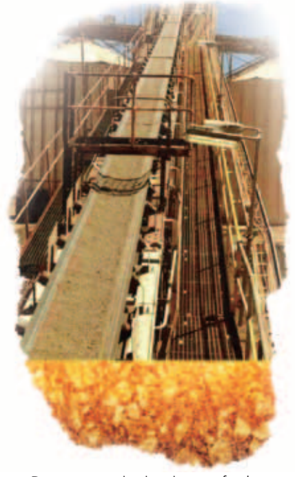
Dry commissioning of the processing plant commenced on 18 December 2014

Production process: ore will be crushed by tertiary crushers (including ball mills) into a particle size of about 12 millemeters and stored in fine ore bin. The ore will then grinded to about 150 microns with ball mills. Coarse native gold will be extracted through a Nelson Acacia gravity separation system, while finer gold will be extracted by means of tank leaching and activated carbon adsorption. After being further extracted through electrolysis, the gold will be poured into gold dore at the gold room before delivery to Perth Mint for sale.