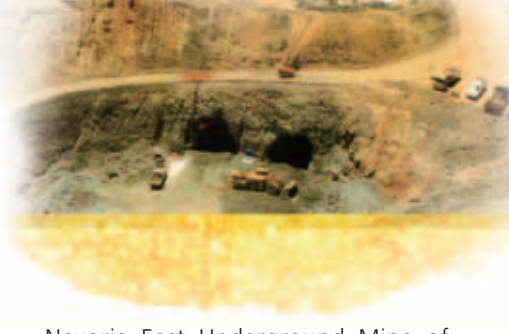
Nevoria East Underground Mine of the SXO gold mine

Through two exploration programs, the total JORC Codecompliant gold resource of the Australia Gold Project has been increased to 23,375,000 tons at an average grade of 3.8 gram/ton for 2.83 million ounces, representing an increase