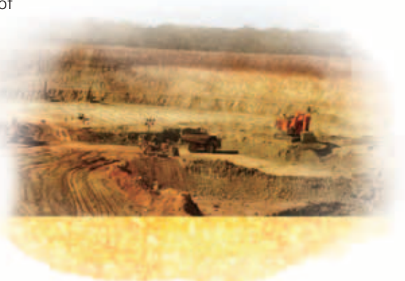
Cornishman South Open Pit of the Australia Gold Project

In December 2014, Hanking Gold also formed an alliance with a specialist underground Australian mining company to jointly develop the Nevoria East Underground Gold Mine. This alliance allowed the Company to better utilize its assets such as the processing plant and other infrastructures to increase the total gold production of the Company. The Company plans to produces 100,000 ounces gold in 2015, thus effectively increasing the value of the Australia Gold Project.