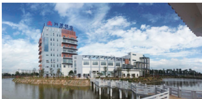
興發鋁業控股有限公司總部