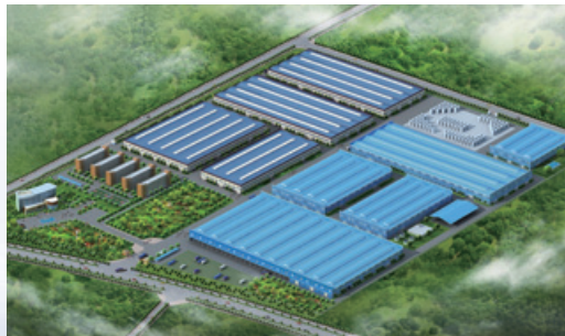
廣東興發鋁業（江西）有限公司