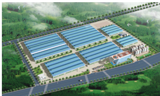
廣東興發鋁業（河南）有限公司