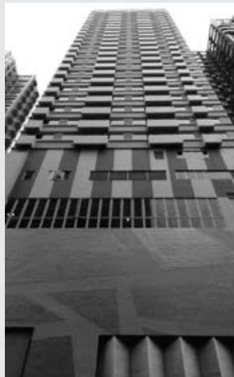
214 guest-room Best Western Grand City Hotel Queen's Road West