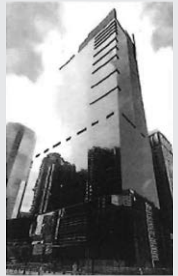
633 King's Road North Point

Net Asset Value: HK$12.1 billion (by DTZ) HK$1.36 per share