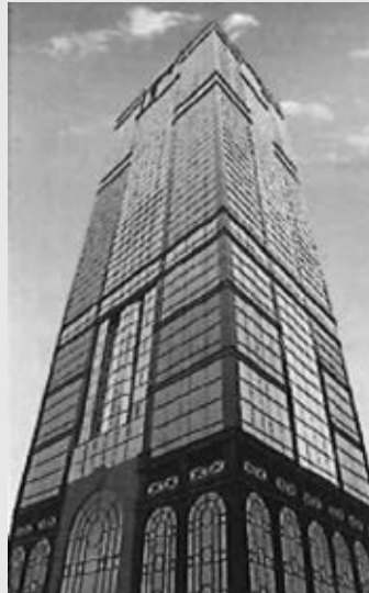
318 guest-room Ramada Hong Kong Hotel