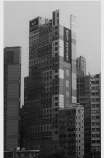
396 guest-room Best Western Grand Hotel Tsimshatsui