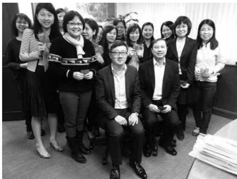
Daily Management Team of Financial Control, Property Managements, Hotel Operations and Developments