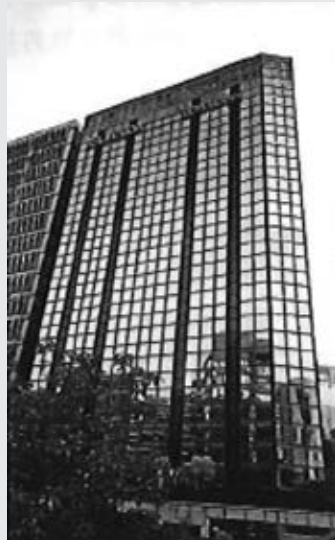
206 guest-room Ramada Hotel Kowloon Tsimshatsui