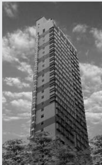
258 guest-room Best Western Hotel Causeway Bay