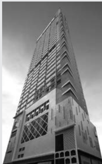
432 guest-room Best Western Hotel Harbour View Queen's Road West