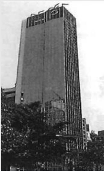
Shun Ho Tower Central