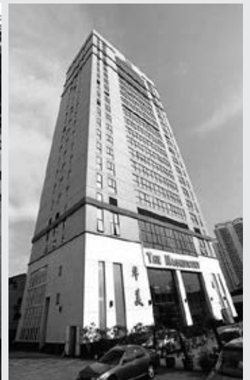
213 guest-room Magnificent International Hotel Shanghai