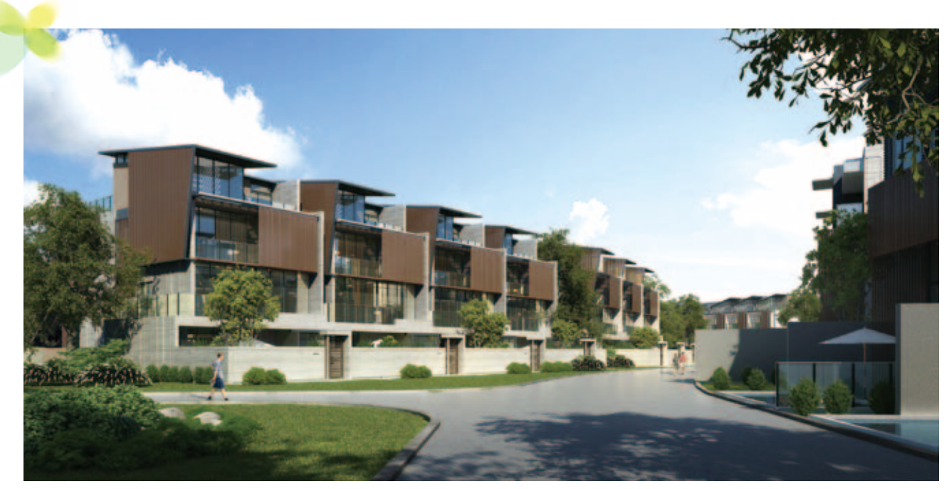
Yunshan Yujing 雲山御景