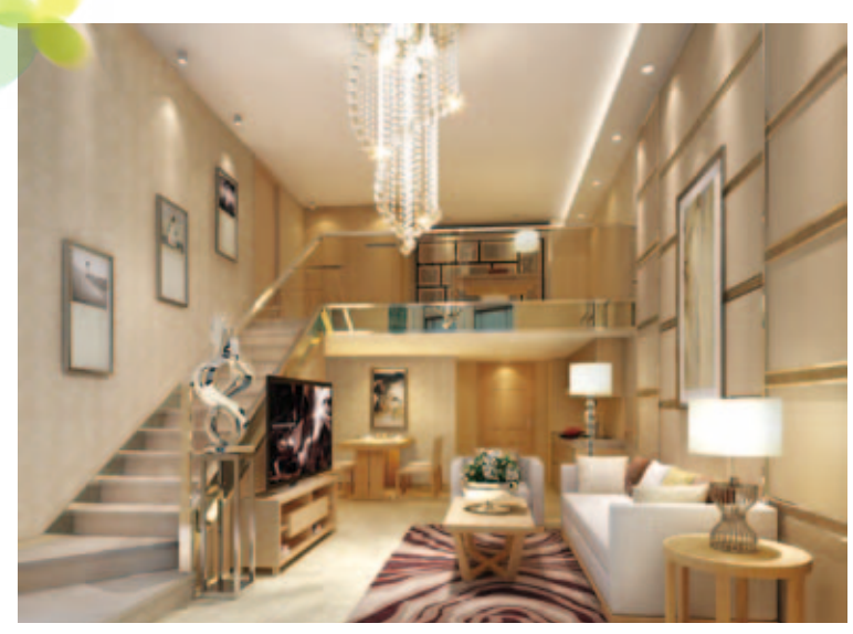
Central Park 珠光新城國際

"Central Park" is located at Lot H3-3, Zhujiang New Town, Tianhe District, Guangzhou, the PRC, and is entitled to total GFA of approximately 36,559 sqm, which will be developed into a 30-storey building including service apartments, a street-level commercial podium and a 4-storey underground car park. The project is currently in its final stage of construction and is expected to be completed in the second half of 2015.