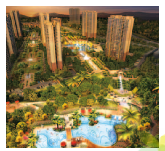
Yujing Scenic Garden 御景山水花園