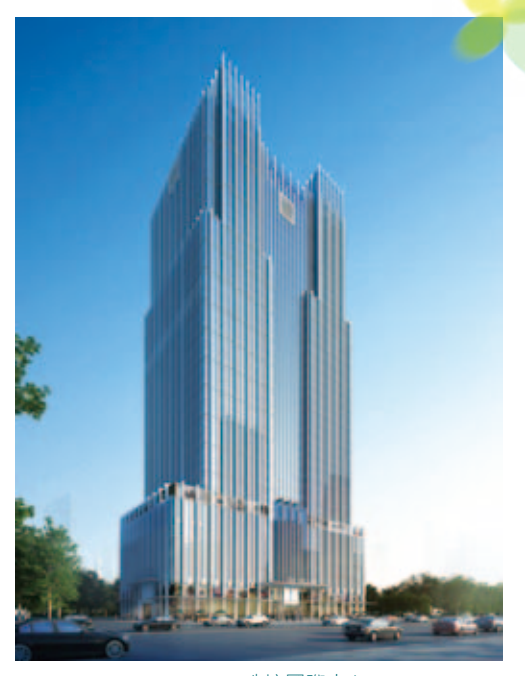
Zhukong International 珠控國際中心