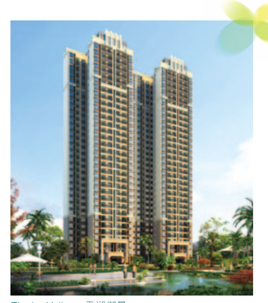
Tianhu Yujing 天湖御景

「天湖御景」位於中國廣州市從化溫泉鎮九里 步區水底村,佔地面積約55,031平方米。該 土地位於御景山水花園旁邊,本集團考慮將 該土地與御景山水花園一併開發,從而擴大 本集團於從化地區之發展及版圖。該項目將 發展成為一幢32層現代住宅大樓,總建築面 積約240,296平方米。年內,第一期預售已經 啟動,錄得合約銷售約183,623,000港元。本 集團將繼續推售第一期及第二期,以達成二零 一五年目標。該項目若干部份預期將於二零 一六年交付。