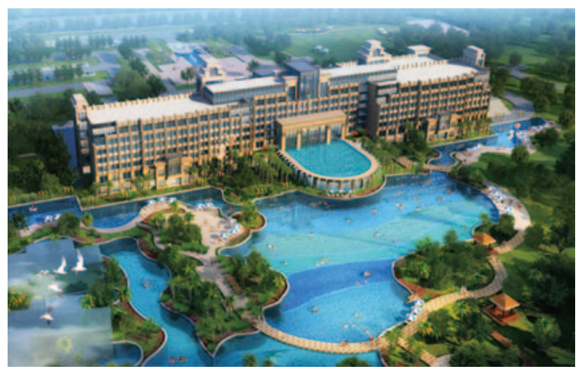
Pearl Yunling Lake 珠光●雲嶺湖