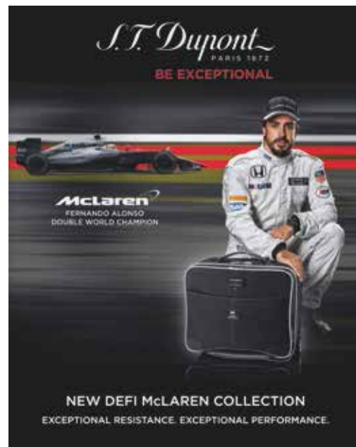
S.T. Dupont 'NEW DEFI McLAREN COLLECTION' leathersgoods. 「都彭」的「NEW DEFI McLAREN COLLECTION」皮具。