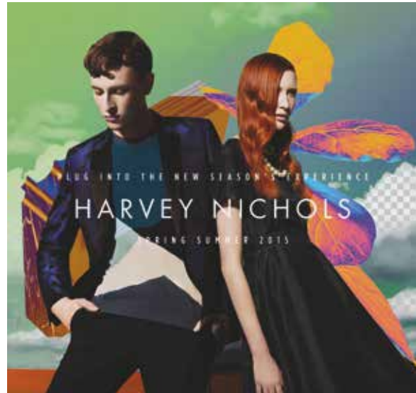
Spring / Summer 2015 fashion at Harvey Nichols. 於「Harvey Nichols」的二零一五年春/夏季時裝。

In view of these results, the Board is recommending the payment of a final dividend of HK6.0 cents per ordinary share, compared to a total dividend of HK31.0 cents per ordinary share in the previous year.