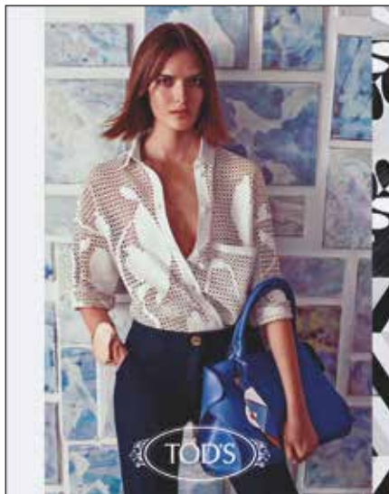
Tod's handbag. 「Tod's」手袋。