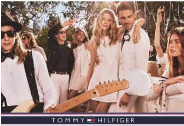
Fashionwear by Tommy Hilfiger. 「Tommy Hilfiger」時裝。