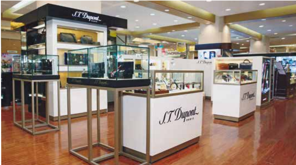
Newly opened S.T. Dupont corner at SOGO, Fuxing Store, Taipei, Taiwan. 位於台灣台北市SOGO復興館新開設的「都彭」專櫃。

Various boutiques / stores / corner newly opened by the Group during the year.