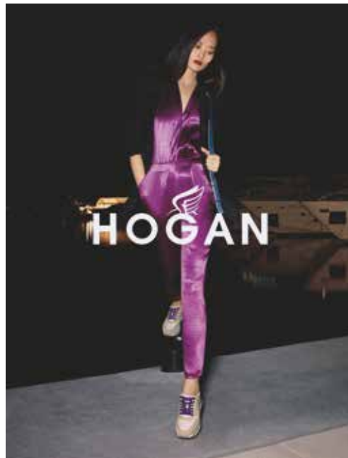
Handbag and shoes by Hogan. 「Hogan」手袋及鞋履。