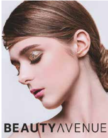
Cosmetics and skincare products at Beauty Avenue. 於「Beauty Avenue」的化妝及護膚產品。