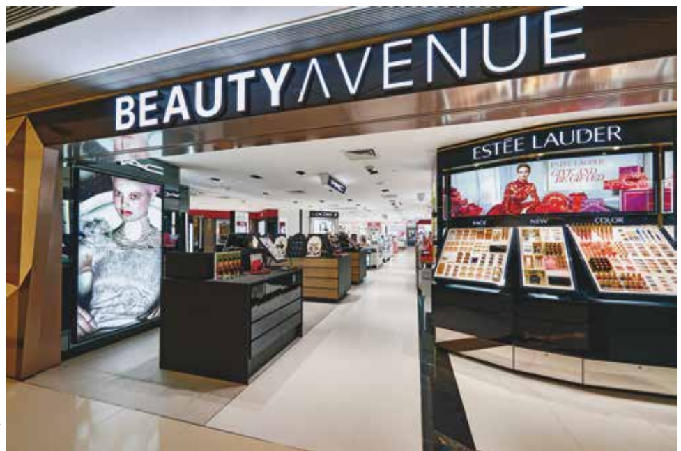
Newly opened Beauty Avenue store at Tsuen Wan Plaza, Tsuen Wan, Hong Kong. 位於香港荃灣荃灣廣場新開設 的「Beauty Avenue」店。