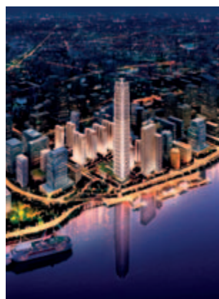
南京春江紫宸 Nanjing Chungjiang Central