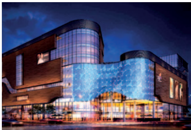
杭州金沙天街 Hangzhou Jinsha Paradise Walk

Due to the commencement of construction of new investment properties, the valuation gain of investment properties of the Group amounted to RMB2.22 billion from January to June 2015.