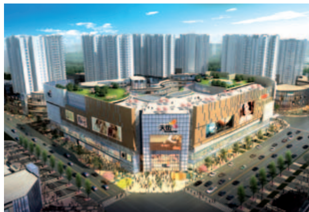
成都金楠天街 Chengdu Jinnan Paradise Walk