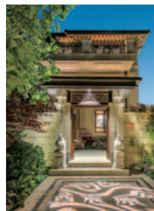
北京西宸原著 Beijing Jade Mansion