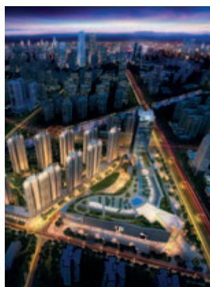
杭州春杭州春江郦城 Hangzhou Chunjiang Central