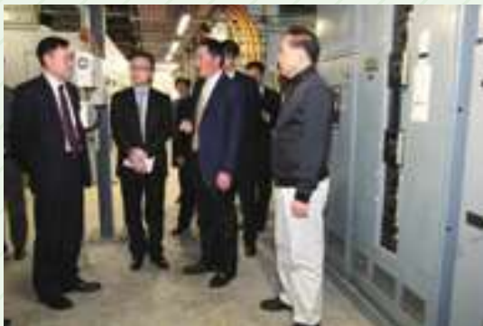
The Company's general manager leading the HSE inspection team

perils were solved and eliminated effectively. During the year, the Company incurred no safety accidents. In 2015, there was no work-related death or injuries.