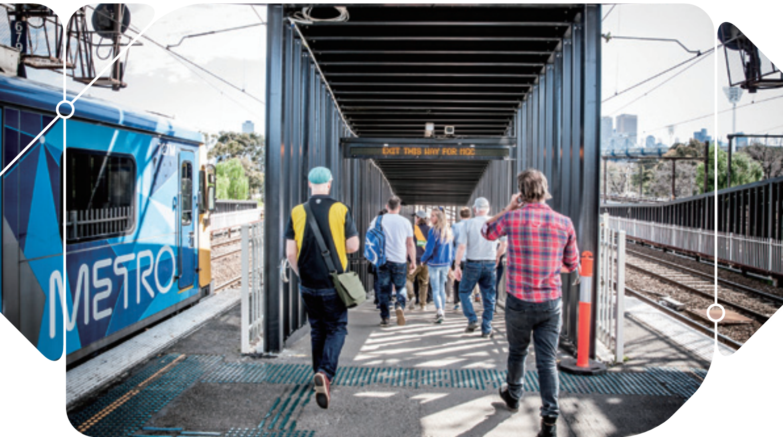
MTM in Melbourne provides excellent services and enhances connectivity in the area

solutions being explored with Tianjin Metro (Group) Company Limited may necessitate changes to design schemes and the general layout plan.