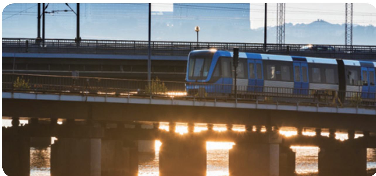
MTRS was granted an extension of the Stockholm Metro operating concession for six years to 2023

In Tianjin, our 49% owned associate, Tianjin TJ-Metro MTR Construction Company Limited, is encountering a number of obstacles in the development of the Beiyunhe Station project on Tianjin Metro Line 6. These obstacles include softening market demand in Tianjin, especially for offices (the mix-use project has approximately 60,000 square metres GFA of offices) as well as a significant increase in the estimated construction cost due to a more complex and enlarged basement construction. We are working with our 51% partner, Tianjin Metro (Group) Company Limited to find ways to reduce the negative impact of these challenges. The possible