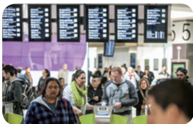
We continue to enhance the operational performance of our railways outside of Hong Kong

In Beijing, our 49% associate Beijing MTR Corporation Limited ("BJMTR") operates three lines (Beijing Metro Line 4 ("BJL4"), Daxing Line and Beijing Metro Line 14 ("BJL14")) and entered