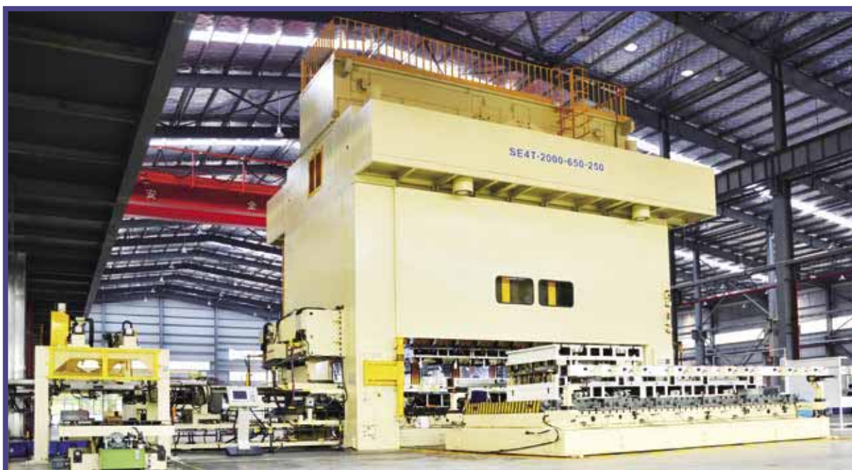
2,000 tonnes stamping machine for automobile components located at Digidie Guangdong (Zhongshan) Automobile Industrial Park

At the same time, we continued to see significant progress in the other business lines of the Group. During the year, our automobile business received the “Excellent Supplier” accolade from its major customer, which is a leading automaker in China, for the third consecutive year. This not only strengthened our business partnership with them, but also provided us with a valuable credential for sourcing other new orders in the automobile industry. Further, through internal production capacity adjustment, our existing Zhongshan industrial park was merged into the Group’s automobile business line, targeting at the development of new automobile customers in Guangdong Province. Together with the other two automobile industrial parks of the Group located in Wuhan and Chongqing, the reach of our precision manufacturing services covers China’s major automobile production hubs in Southern, Central and Southwest China.