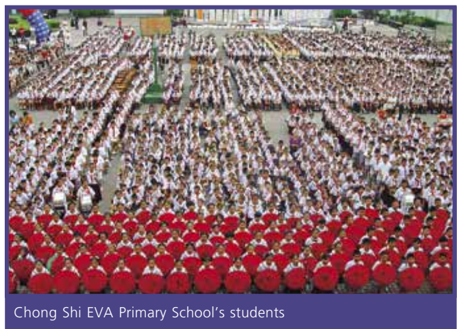
Chong Shi EVA Primary School's students

The Group believes that education is the foundation for social improvement and therefore has been contributing substantial resources to education. Back in 2008, we