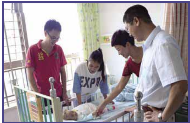
The employee caring fund committee members visited and made donations to our employee's son who suffered from an inborn illness

Back in 2008, the Group established the employee caring fund. Since its inception, the employee caring fund has been helping the employees in need or their families who suffered from hardships such as terminal diseases and accidents through cash and in-kind donations, as well as other helpful actions. In 2015, the Group's employee caring fund offered assistances to a total of 16 employees, and the actions taken included donating from the fund's own reserve, invitation of additional donations from fellow staff members and home visits.