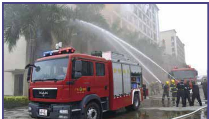
Factory-wide fire drills are organised to raise employees' awareness about occupational safety

We adopt international best practices in occupational health and safety, and follow the OHSAS18001:2007 requirements in respect of occupational health and safety management system. Therefore, we have been certified as OHSAS18001 compliant by the BSI Group since 2011. Our subsidiaries in China also comply with "Work Safety Standardisation" in China, a standard established by State Administration of Work Safety. In addition,