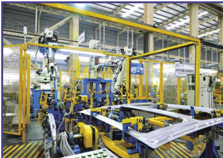
Robotic welding lines for automobiles

In recent years, Shenzhen has evolved into a high technology hub in China where many new technologies and products used in internet, communication applications and other smart devices are developed. This presents suppliers with proven track records in production innovation and technologies with lots of new business opportunities as quality and engineering expertise are also essential for these products. As an enterprise headquartered in Shenzhen,