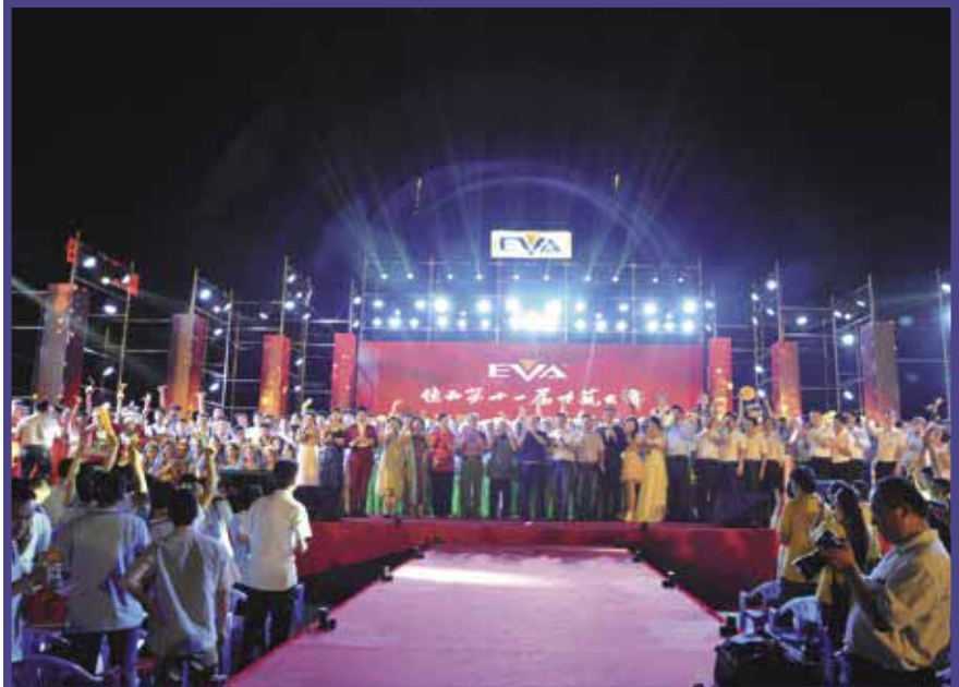
Employees are encouraged to take part in work-life balance activities

The Group encourages employees to take part in work-life balance activities and community services. These include various cultural events, employee outings, community volunteering and supporting charitable organisations. For example, as our yearly regular events, we organise new year galas at around Chinese New Year and talent competitions at around Mid-Autumn Festival every year, during which our employees are encouraged to perform on the stages