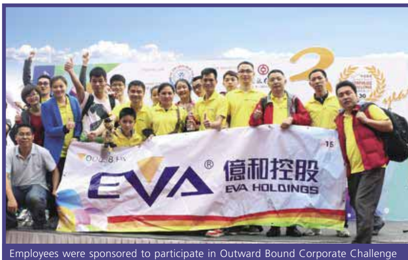
Employees were sponsored to participate in Outward Bound Corporate Challenge

donated for the construction of Chong Shi EVA Primary School in Zhangjiajie, Hunan Province, China, and this school has been providing learning opportunities for many underprivileged children since then. In 2015, we continued our student sponsorship programme with the Shenzhen Polytechnic, which provided financial assistance to hardworking students through the “EVA Scholarship”.