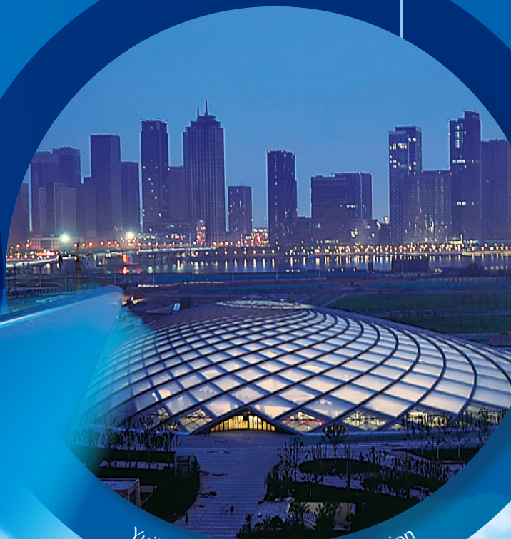
Yujiabao High Speed Railway Station