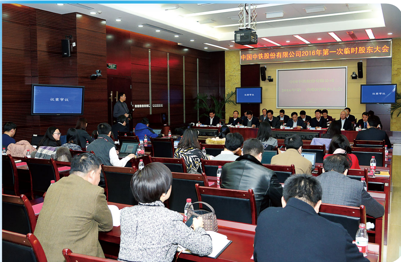
Shareholders' General Meeting