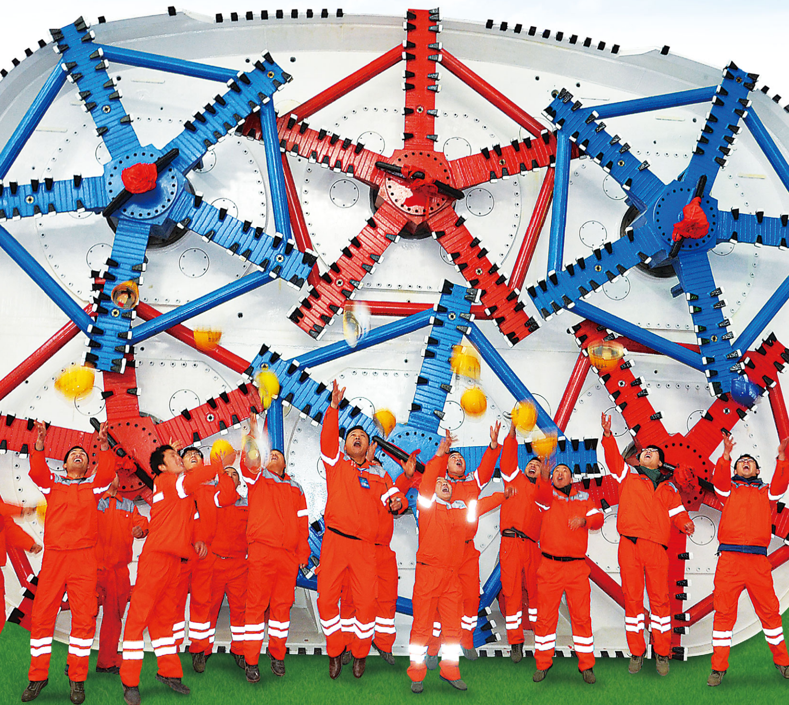
The world's largest rectangle shield push bench

As one of the largest integrated construction groups in China and Asia, we are committed to improving construction technique, strengthening quality controls and enhancing the standard of project management to create a brighter prospect for shareholders and a better living environment for the general public.