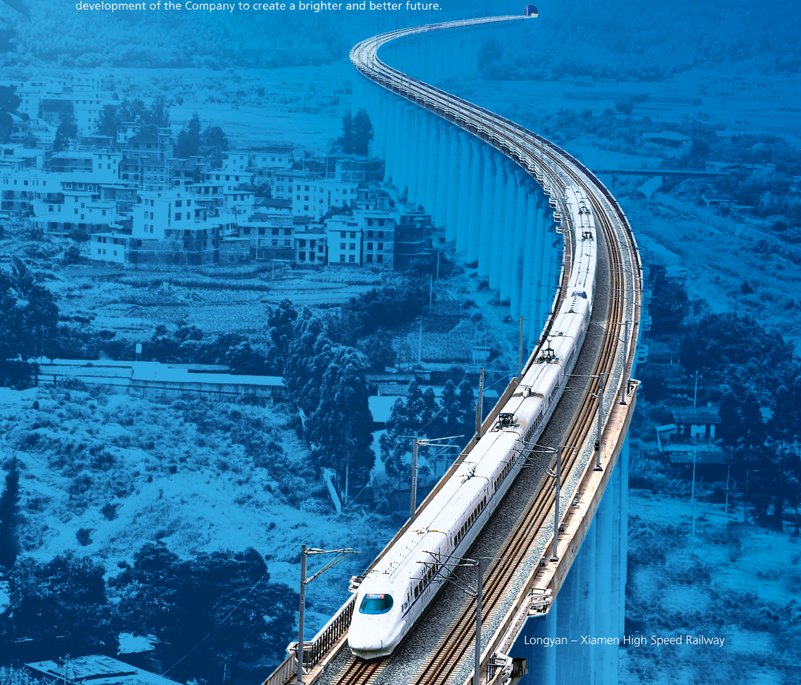
Longyan – Xiamen High Speed Railway

Adhering to the motto of "strive to challenge limits and achieve excellence", the Company is committed to continuous development of the Company to create a brighter and better future.