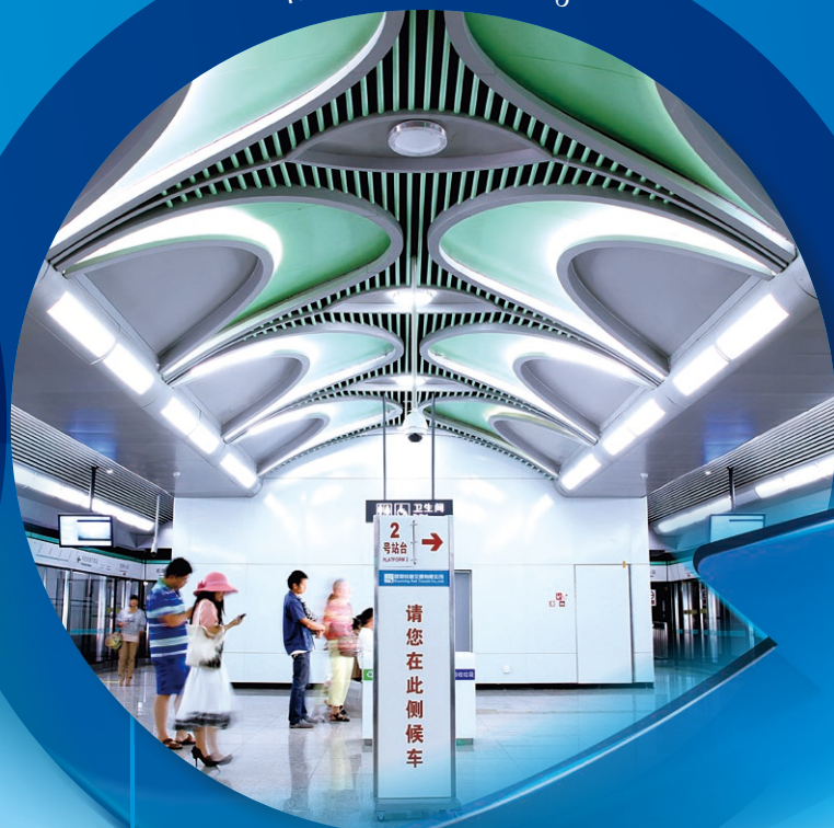
Kunming Metro Line 6