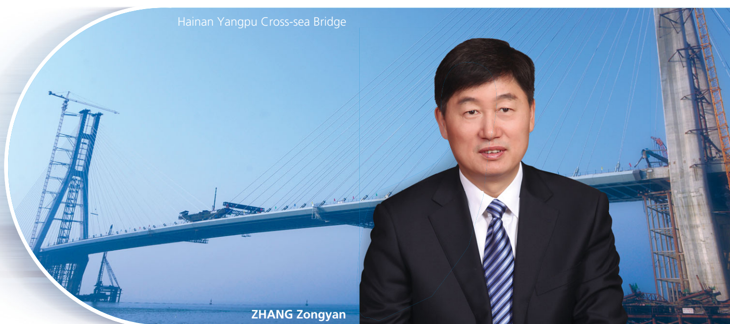
Hainan Yangpu Cross-sea Bridge

In 2015, with respect to the infrastructure market, the State continued to push forward the policies on an inter-connected network of infrastructural facilities, "One Belt, One Road", co-development of Beijing-Tianjin-Hebei and Yangtze River Economic Belt, continuously improved efficiency and quality of foreign investment and promoted the international development of priority industries. The infrastructure investment model is undergoing remarkable changes, and the policies and systems in relation to PPP are under improvement. The State stepped up its efforts in the construction of key projects, and implemented and moved forward the overall planning for a number of key projects in respect of the railways in the central and western regions, railway transport, highways, urban infrastructure (such as underground integrated utility tunnels and sponge cities), irrigation works and hydroelectricity projects, municipal environmental protection projects and general aviation airports. Fixed asset investments, including railways, highways and waterways, remained at a high level. Stimulated by a series of favourable government policies including the continuation of the monetary easing policy and reduction in interest rates and deposit reserves, the property sector slowly picked up.