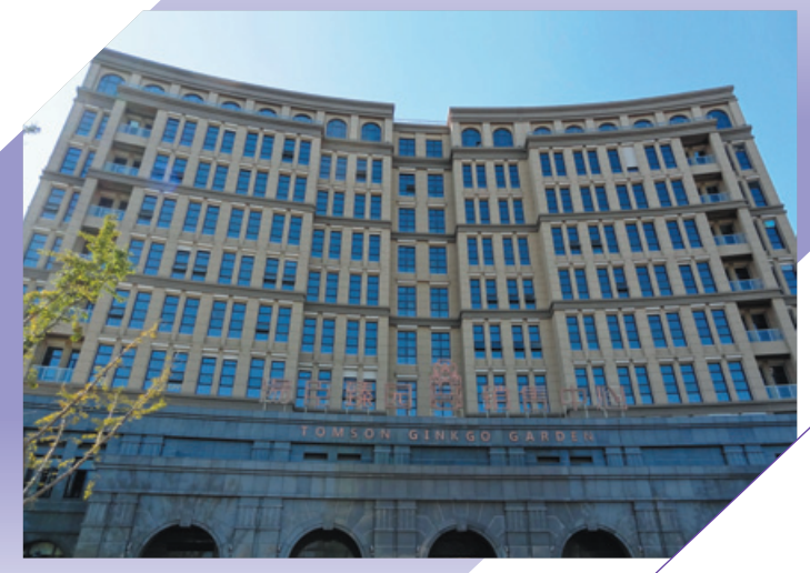
Commercial-cum-office Building 商用辦公大樓