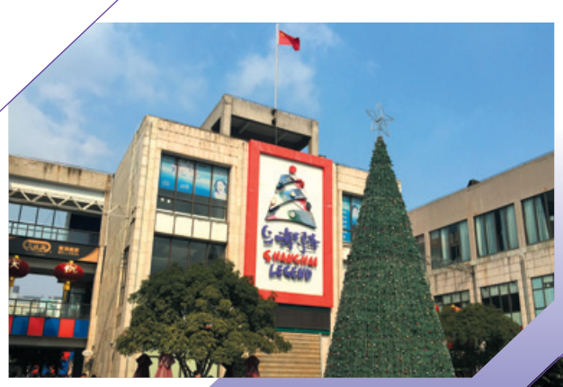
Shanghai Chuan Qi 上海傳奇

此外,微電子港公司於張江園區內擁有一幅地 塊面積約15,000平方米之土地儲備,以作為商 業廣場第二期發展之用。