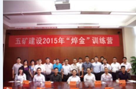
Career training and development program for third echelon staff 舉辦第三梯隊人才粹金訓練營培訓活動，高度重視培養企業內部人才