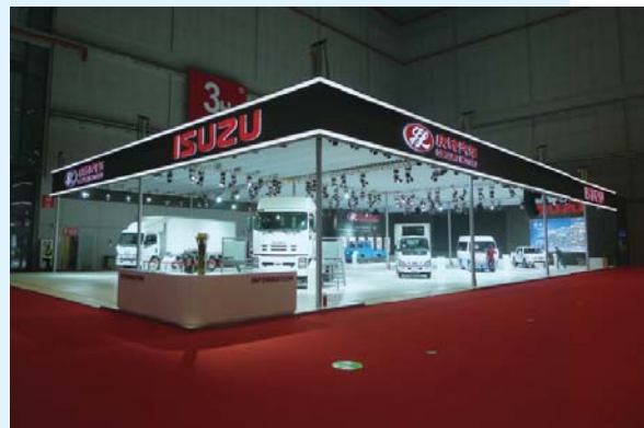
參加上海國際車展 Participating in the Shanghai International Car Show