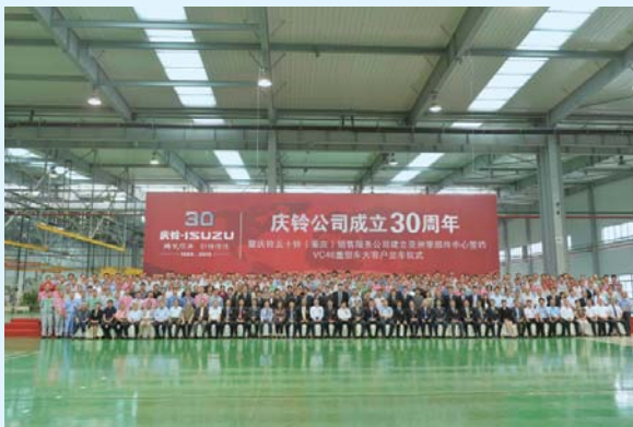
慶鈴公司成立30周年慶典儀式 30th anniversary ceremony of the Company

1) introduce commercial plans and marketing operation standards that complies with market development needs on a timely basis; 2) through in-depth research in the region market environment, characteristics of product and users, so as to commence the building of sales and marketing network with the aim to lay a strong basis in marketing management and enhance the quality of marketing network.