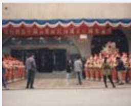
1994 The 3rd anniversary of the establishment of Shiwang Dongpeng Ceramic Group (石 灣東平陶瓷集團)