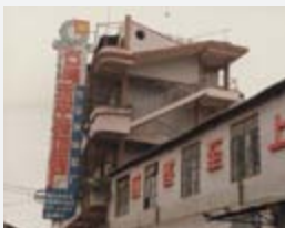
90's The exterior of Dongpeng Ceramic Central Factory

A SMALL STEP FORWARD FOR DONGPENG CERAMICS IS A GIANT LEAP FOR THE WHOLE INDUSTRY.