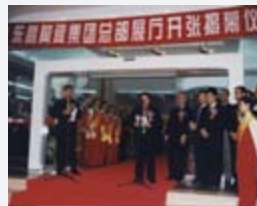
1997 The official establishment of Dongpeng Ceramic Group, and the inauguration of the exhibition hall of the headquarters in the same year