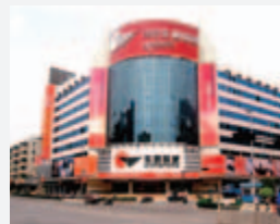
2005 The exterior of Dongpeng Building (東鵬大廈)