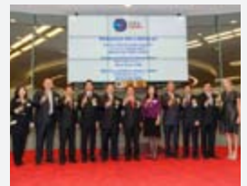
2013 Dongpeng Holdings was successfully listed in Hong Kong on 9 December