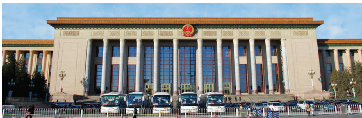
The Great Hall of the People 人民大會堂

本集團產品亦直接出口至美國、歐洲及其他亞洲國家。截至二零一四年及二零一五年十二月三十一日止年度，非國內銷售總額佔本集團收益分別約1.5%及1.9%。