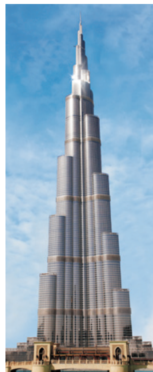
Khalifa Tower in Dubai 杜拜哈利法塔