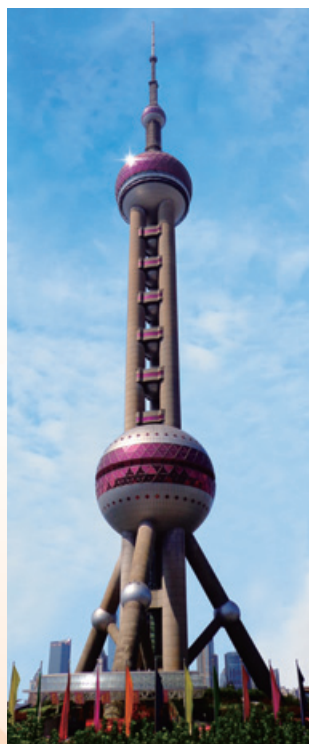
The Oriental Pearl TV Tower of Shanghai 上海東方名珠電視塔