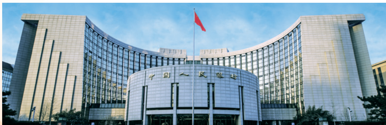
Headquarter of People's Bank of China 中國人民銀行總部

附註：本集團其他收益指製造及銷售鋁棒、模具及零部件，以及提供加工服務所產生之收益。