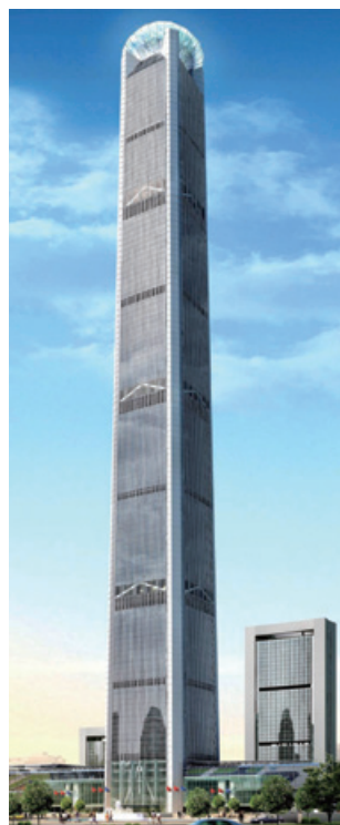
Tianjin Goldin Finance 117 Tower 天津高銀117大廈