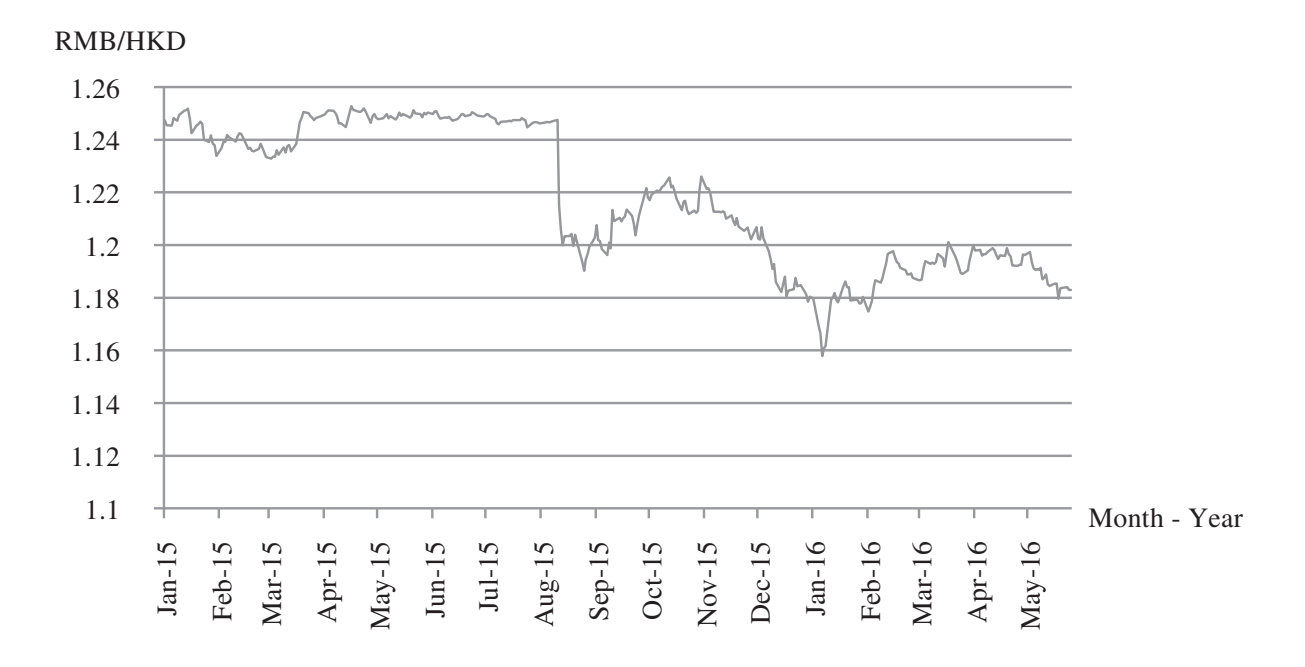
Chart 1: Daily exchange rate of offshore RMB to HKD

The Management is of the view that given the notable increase of the PRC's money supply in the past 12 months or so, and to maintain price competitiveness of the PRC's exports, the RMB may be subject to further pressure to devaluate in the future. On this basis, the Management believes that increasing HKD denominated assets through the Acquisition would contribute towards the re-balancing of the overall weighting in RMB and HKD denominated assets held by the Group, thereby adjusting the Group's exposure to the RMB exchange rate fluctuations.