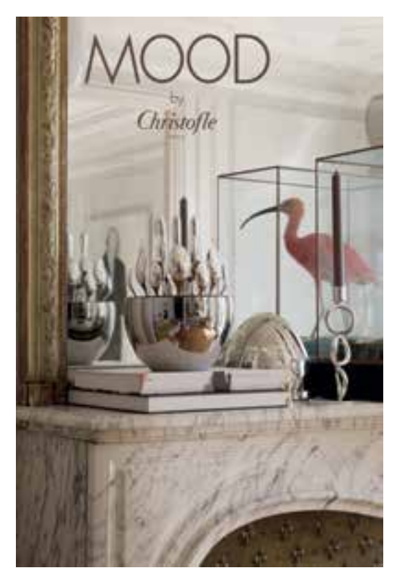
Christofle 'MOOD' collection tableware. 「Christofle」的「MOOD」系列餐具。