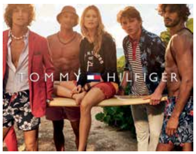
Fashionwear by Tommy Hilfiger. 「Tommy Hilfiger」 時裝。

Cosmetics and beauty products at Beauty Avenue. 於「Beauty Avenue」的化妝及美容產品。