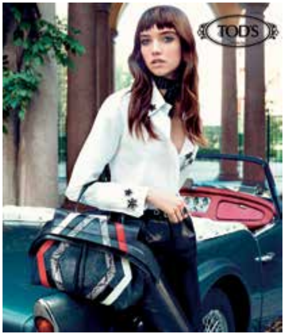
Handbag by Tod's. 「Tod's」 手袋。