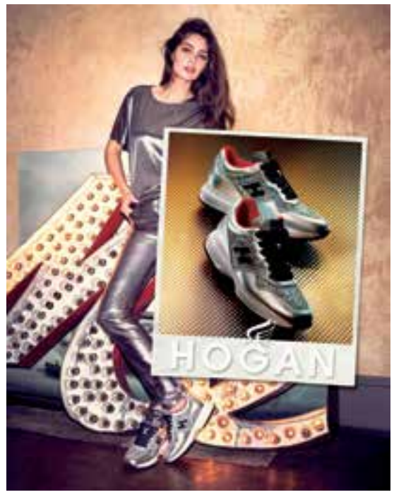
Shoes by Hogan. 「Hogan」 鞋履。