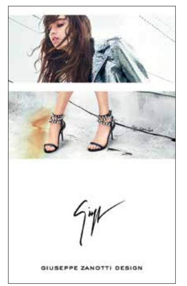
Shoes by Giuseppe Zanotti Design. 「Giuseppe Zanotti Design」 鞋履。