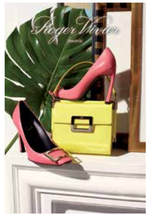
Handbag and shoes by Roger Vivier. 「Roger Vivier」手袋及鞋履。

With its substantial net cash position of HK$1,316.2 million, the Group is well positioned to take advantage of any suitable investment opportunities that arise and which will diversify and broaden its earnings base.