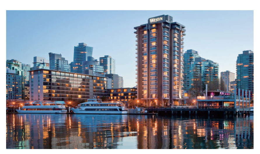
The Westin Bayshore Vancouver 溫哥華灣岸威斯汀酒店

位於銅鑼灣摩頓臺7號之珀麗尚品酒店工程完 工後,酒店牌照申請等籌備工作進行得如火如 茶,預料此設有90間客房之酒店將於二零一六 年最後一季開業。