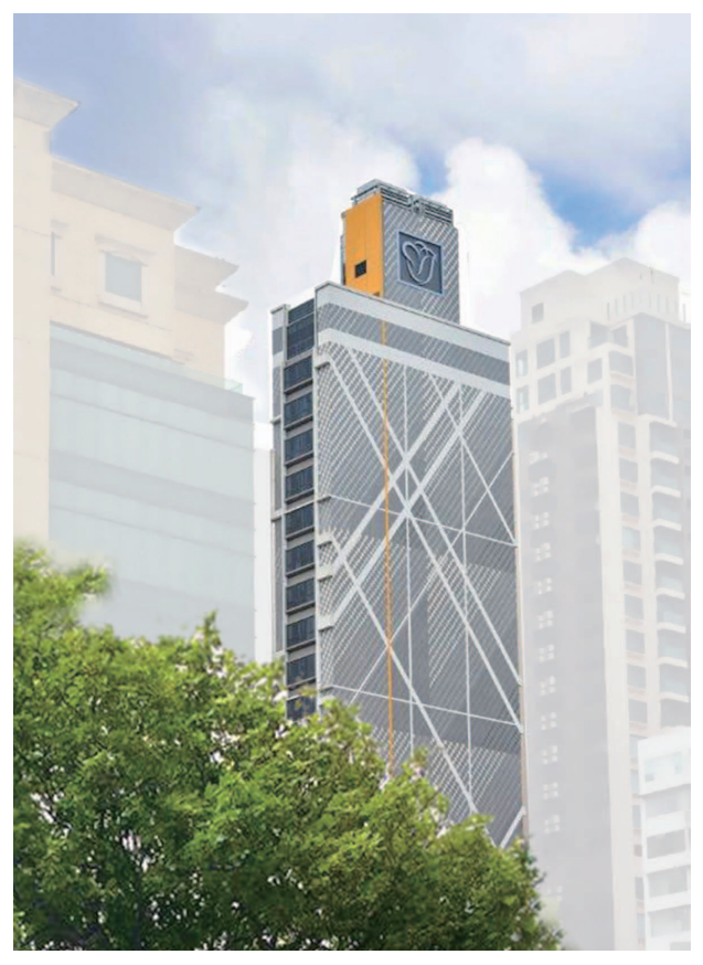
Le Petit Rosedale Hotel 珀麗尚品酒店

此分部於本年度之收益為港幣111,200,000元 (二零一五年:港幣36,700,000元),主要來自九龍珀麗酒店自二零一四年十二月獲本集團收購以來之酒店業務收益。受現時酒店業市場氣氛拖累,本集團確認酒店權益之公平值變動虧損合共港幣212,200,000元及分部虧損港幣226,700,000元(二零一五年:分部溢利港幣2,200,000元)。