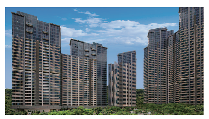
One Oasis 金峰南岸