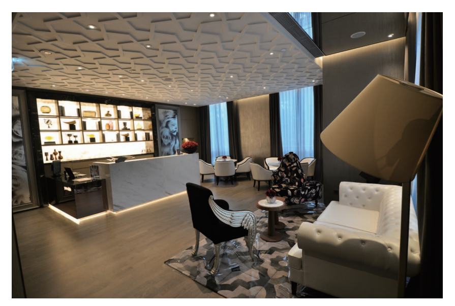
Club house, yoo Residence yoo Residence 會所

除取得傑出銷售表現及產品質素贏盡口碑外, 我們對金峰南岸餘下各期在設計及規格上精益 求精,務求提升銷售價值。我們仍有信心金峰 南岸住宅單位可在市場上取得良好迴響,大幅 拋離第一至十二座之平均售價。