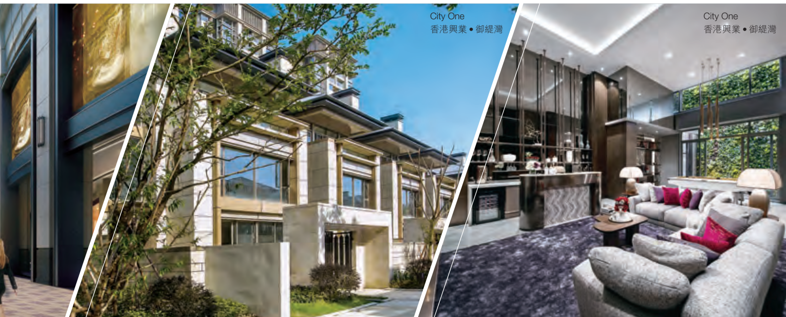
City One 香港興業·御緹灣