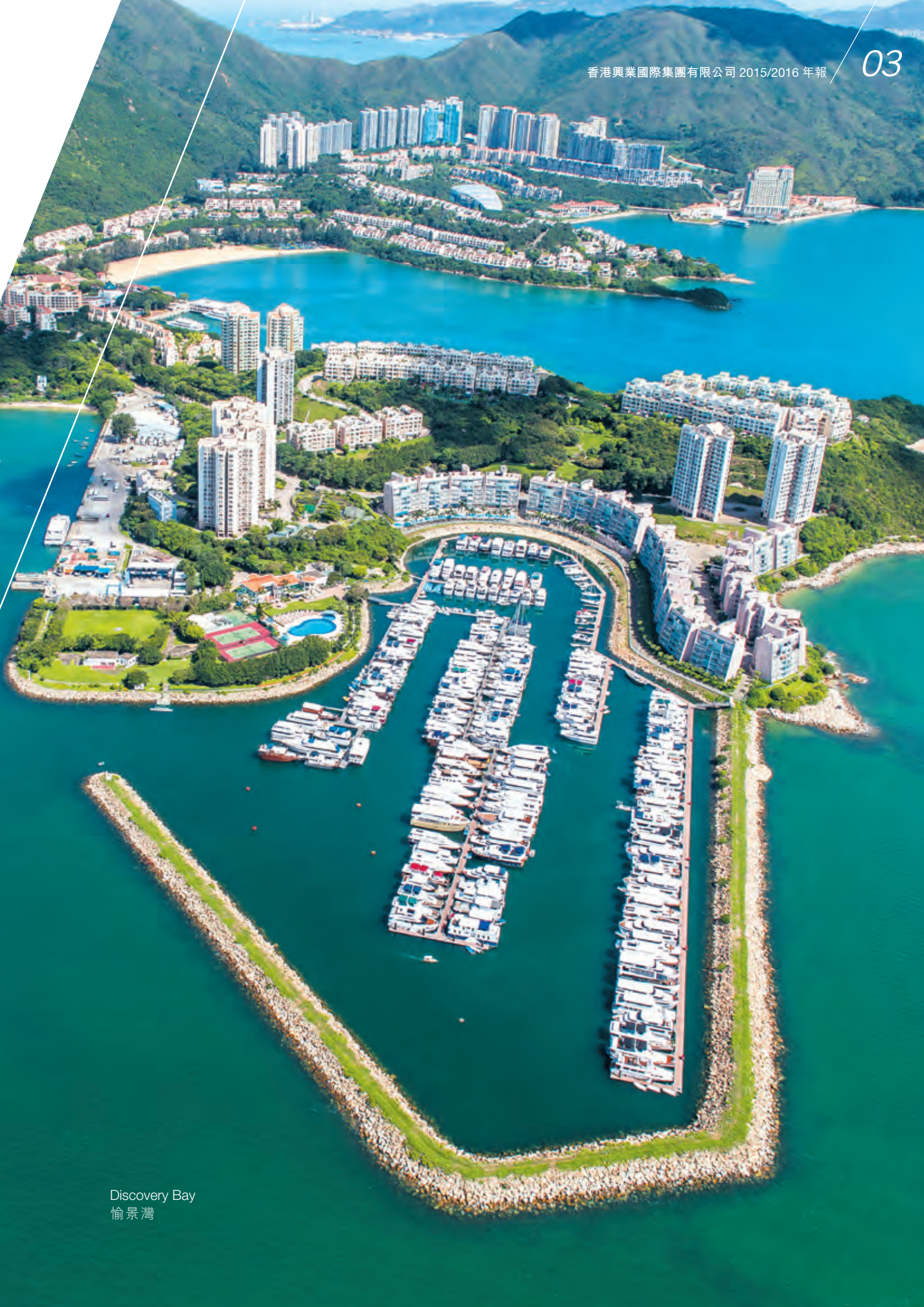
Discovery Bay 愉景灣