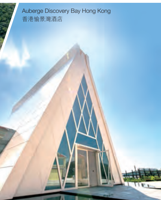
Auberge Discovery Bay Hong Kong 香港愉景灣酒店