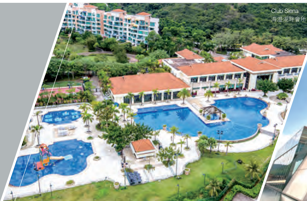
Club Siena 海澄湖畔會所