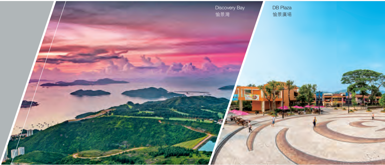
DB Plaza 愉景廣場