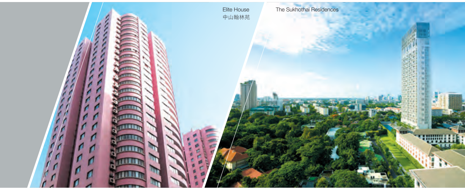
Elite House 中山翰林苑