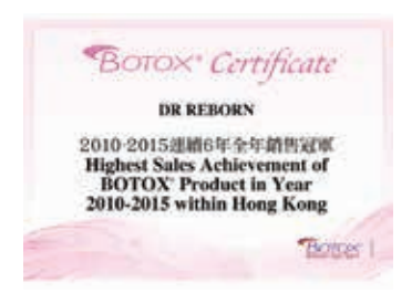
Botox - Highest Sales Achievement for Consecutive 6 Years from 2010 to 2015 within Hong Kong