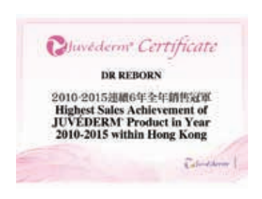
Juvederm - Highest Sales Achievement for Consecutive 6 years from 2010 to 2015 within Hong Kong