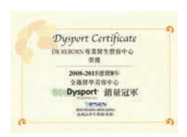
Dysport - Highest Sales Achievement for Consecutive 8 Years from 2008 to 2015 within Hong Kong