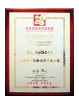
The Creditable Business Awards of Asian Beauty Industry 2015