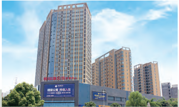
Grand Lake City Phase 3 梓山湖公館第三期

During the year, Phase 3 of Grand Lake City started to deliver completed properties to buyers.