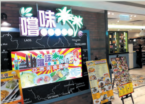
Gustation Restaurant (Tsuen Wan Discovery Park Shop) 嗜味 (荃灣愉景新城店)