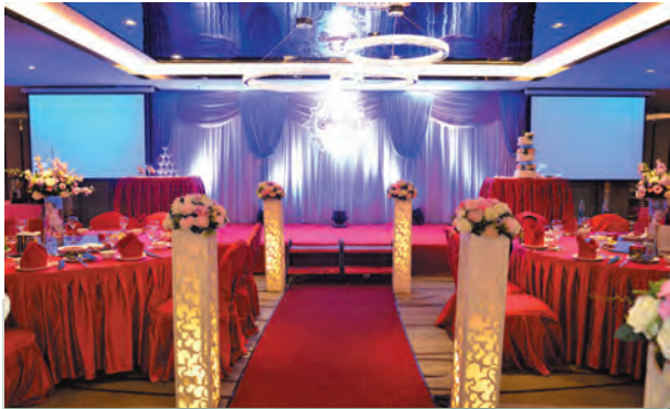
Shenzhen Carrianna Friendship Square Restaurant 深圳佳寧娜友誼廣場大酒樓