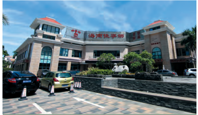
Hainan Carrianna Restaurant 海南佳寧娜酒樓