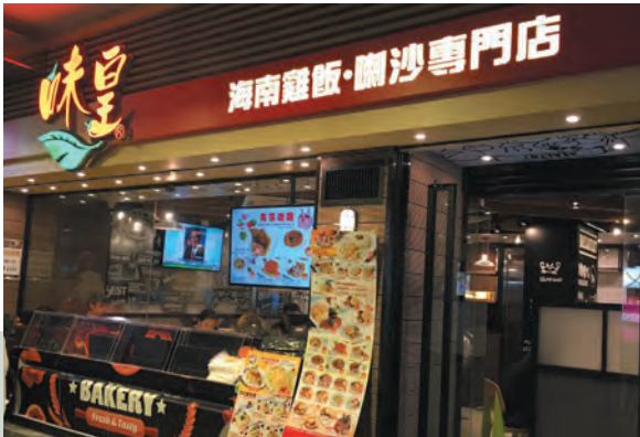
Delicious (Mongkok Bute Street Shop) 味皇 (旺角弼街店)