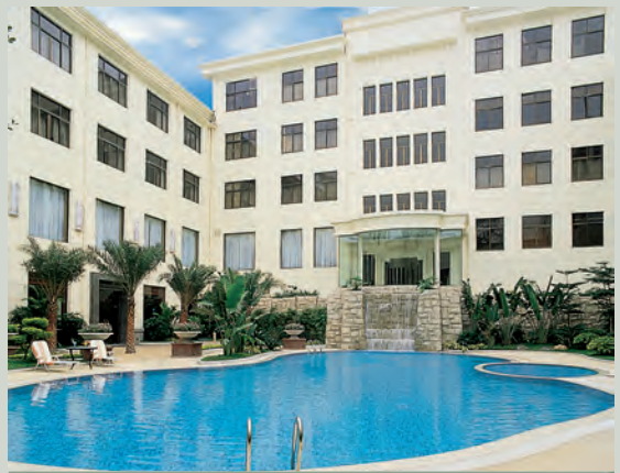
Foshan Carrianna Hotel 佛山佳寧娜大酒店