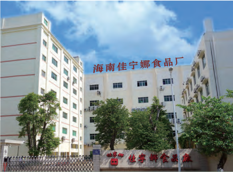
Food factory in Hainan 海南食品廠