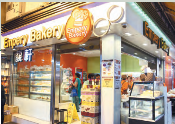
Empery Bakery (Kwun Tong Hip Wo Street Shop) 馥軒 (觀塘協和街店)