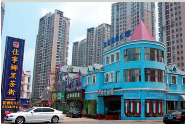
Hunan Yiyang Carrianna Commercial Street 湖南益陽佳寧娜商業街

Carrianna Friendship Square rental income maintained at the same level of last year. The major growth contributor of rental income was commercial properties of Grand Lake City in Yiyang, Hunan Province.