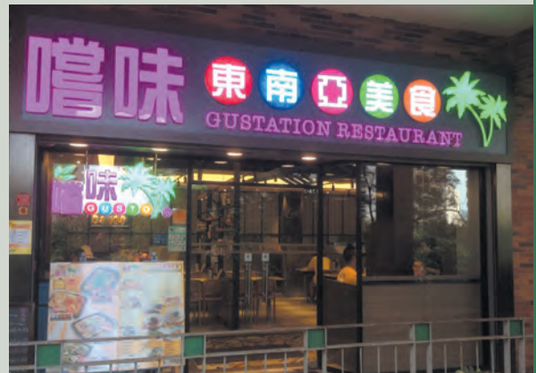
Gustation Restaurant (Shatin Kwong Yuen Shop) 嗜味 (沙田廣源店)