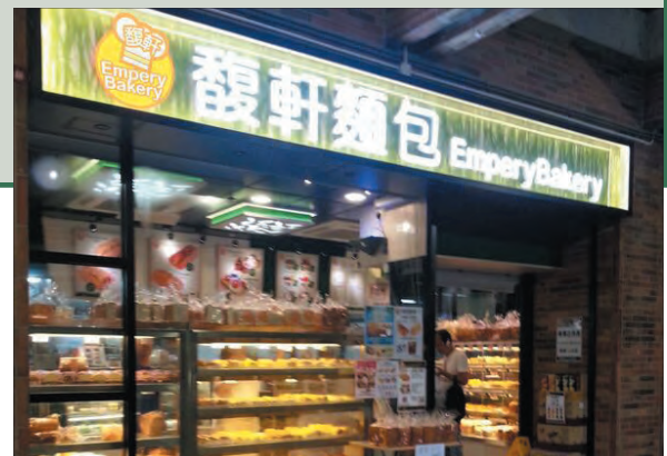
Empery Bakery (Shatin Kwong Yuen Shop) 馥軒 (沙田廣源店)