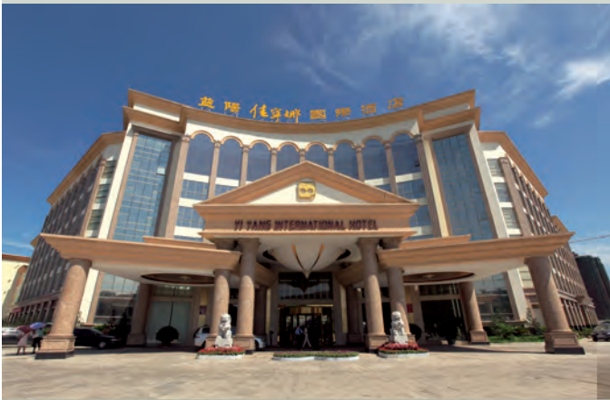
Yiyang Carrianna International Hotel 益陽佳寧娜國際大酒店