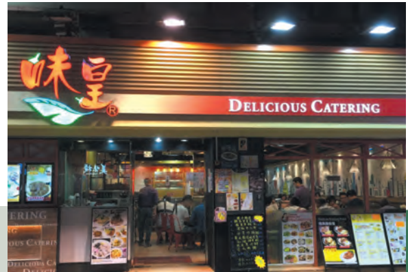
Delicious (Yau Ma Tei Shop) 味皇 (油麻地店)