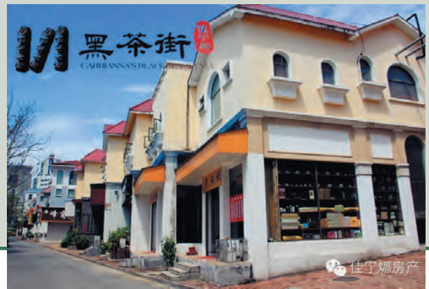
Hunan Yiyang Carrianna Commercial Street 湖南益陽佳寧娜商業街