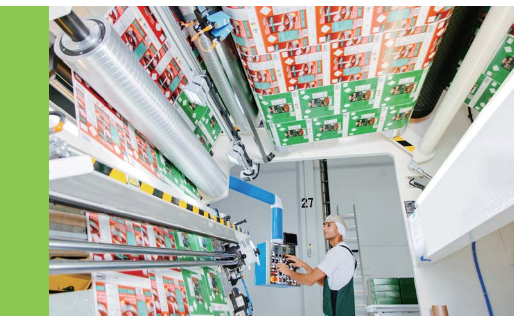
Greatview Factory at Halle (Saale), Germany.

In the first half of 2016, domestic liquid milk production showed a slowly increasing trend against such backdrop as macro-economic development entered a new stage. Meanwhile, the rising of people's per-capita income and enhancing of consumer's nutrition and health consciousness in recent years continue to drive dairy enterprises to adjust their product structure. The competition in aseptic packaging industry continued to intensify in the first half of 2016, which led to an adverse effect on our sales performance. In the meantime, global demand of aseptic packaging material increased at a slow pace. Notwithstanding our sustainable development suffered the pressure from the above industry factors, we still achieved growth in sales and net profit in the first half of 2016.