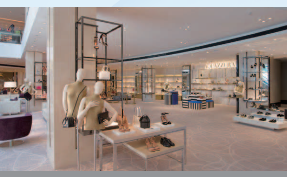
The new shopping precinct at The Boulevard at City of Dreams will feature the largest collection of luxury brands in Cotai and create an exciting luxury shopping scene for all aspirational, sophisticated and cosmopolitan leisure seekers in the region.

In spite of on-going challenges to Macau's gaming demand, Melco Crown Entertainment managed to deliver strong operational and financial results in the first half of 2016, thanks to the Group's strategic focus on the resilient mass market segment and consistent commitment to controlling costs. The segment profit of HK$72.7 million represents the share from Melco Crown Entertainment attributable to the Group when Melco Crown Entertainment became a subsidiary of the Group on 9 May 2016. The performance of Melco Crown Entertainment during the first half of 2016 under review is described below: