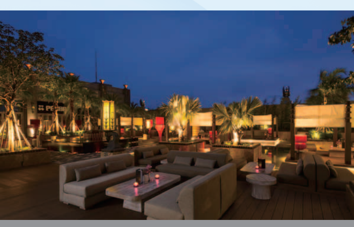
The newest outdoor lounge at Pacha Macau at Studio City, El Cielo, has a relaxed and chill-out vibe that can be appreciated alongside drinks, music, and special performances, serving as the best choice for entertainment in the evenings.

Gaming machine handle for the six-month period ended 30 June 2016 was US$1,266.5 million, compared with US$1,477.9 million in the same period of 2015. The gaming machine win rate was 4.6% in the first half of 2016 versus 4.5% in the corresponding period of 2015.