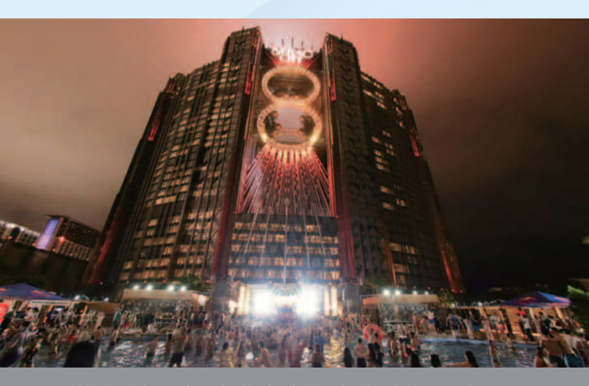
Pacha Macau's first ever "Summer Love" Pool Party Series brought to Macau the biggest names in entertainment, including fashion and media icon Paris Hilton and the legendary DJ Ferry Corsten.

EGT has an established presence in the gaming markets of Cambodia and the Philippines through its slot operations business, which during the first half of 2016 included the leasing of machines on a fixed lease and participation, or revenue sharing, basis. As of 30 June 2016, EGT had approximately 1,574 electronic gaming machine seats in operation. This included 670 seats in NagaWorld Resort and Casino, owned by NagaWorld Limited, a wholly-owned subsidiary of NagaCorp Ltd, located in Phnom Penh, Cambodia. Average revenue per day per unit was US$66.0 for the first half of 2016 compared to US$120.0 in the first half of 2015. The decline was due to the expiration of the participation agreement with NagaWorld on 29 February 2016 and commencement of a fixed lease agreement on 1 March 2016.