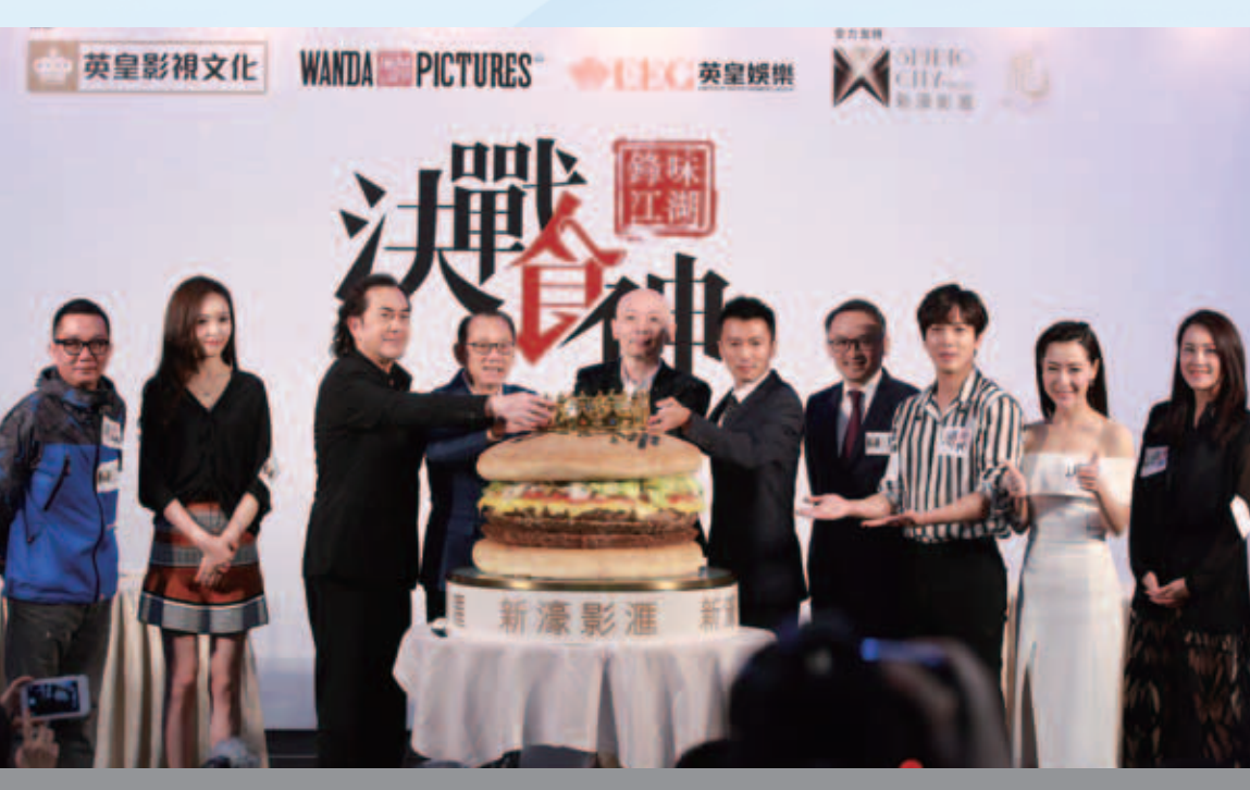
The Hollywood-inspired theme enabled Studio City to be featured in "Cook up a Storm", a blockbuster movie with a star-studded cast of award-winning actors and international Michelin-starred chefs, showcasing Studio City's world-class dining and next generation of entertainment offerings to all food and entertainment lovers.

According to the figures published by the Ministry of Finance, China lottery sales achieved a year-on-year growth of 7.8% to RMB34.6 billion in May 2016. It is the third consecutive month in which overall lottery sales recorded growth, turning from the continued decline in sales over the past nine months. Total lottery sales saw slightly growth by 0.5% year-on-year with accumulative sales of about RMB160 billion up to May 2016. We believe the China lottery market will continue to be challenging as a result of the constantly changing regulatory environment. We remain prudent but optimistic on the development of the China lottery market.