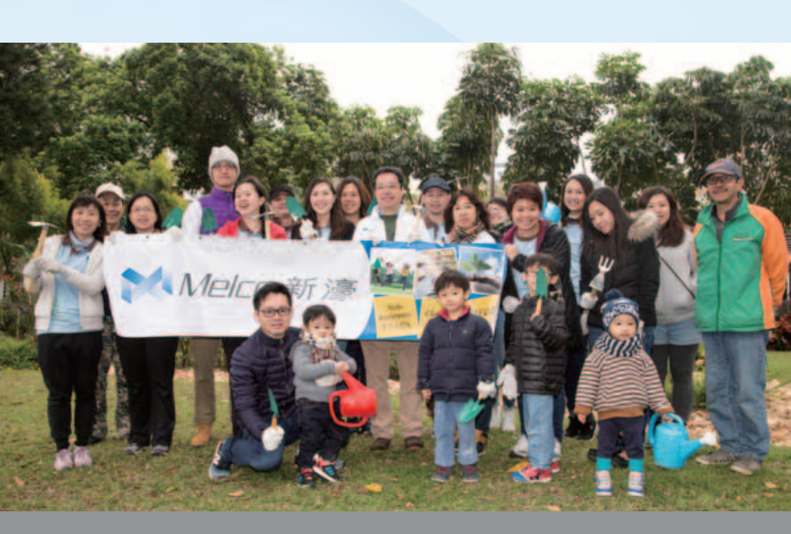
Staff engagement is a crucial part amongst Melco's wide range of CSR events to generate positive impacts to the community and the environment.

As for fine dining, Jade Dragon and The Tasting Room restaurants in City of Dreams have again received Michelin two-star ratings, and Shinji by Kanesaka earned its first Michelin recognition with a one-star rating. These three restaurants have also been feted by Wine Spectator Magazine for Wine Spectator Restaurant Awards. Additionally, Jade Dragon and The Tasting Room are both honored by Forbes Travel Guide as five-star restaurants and among SCMP's 100 Top Tables 2016 by the South China Morning Post. Aurora and Tenmasa in Altira Macau are also winners of Forbes Five-Star Restaurant awards, while Ying has received a Four-Star Restaurant award.