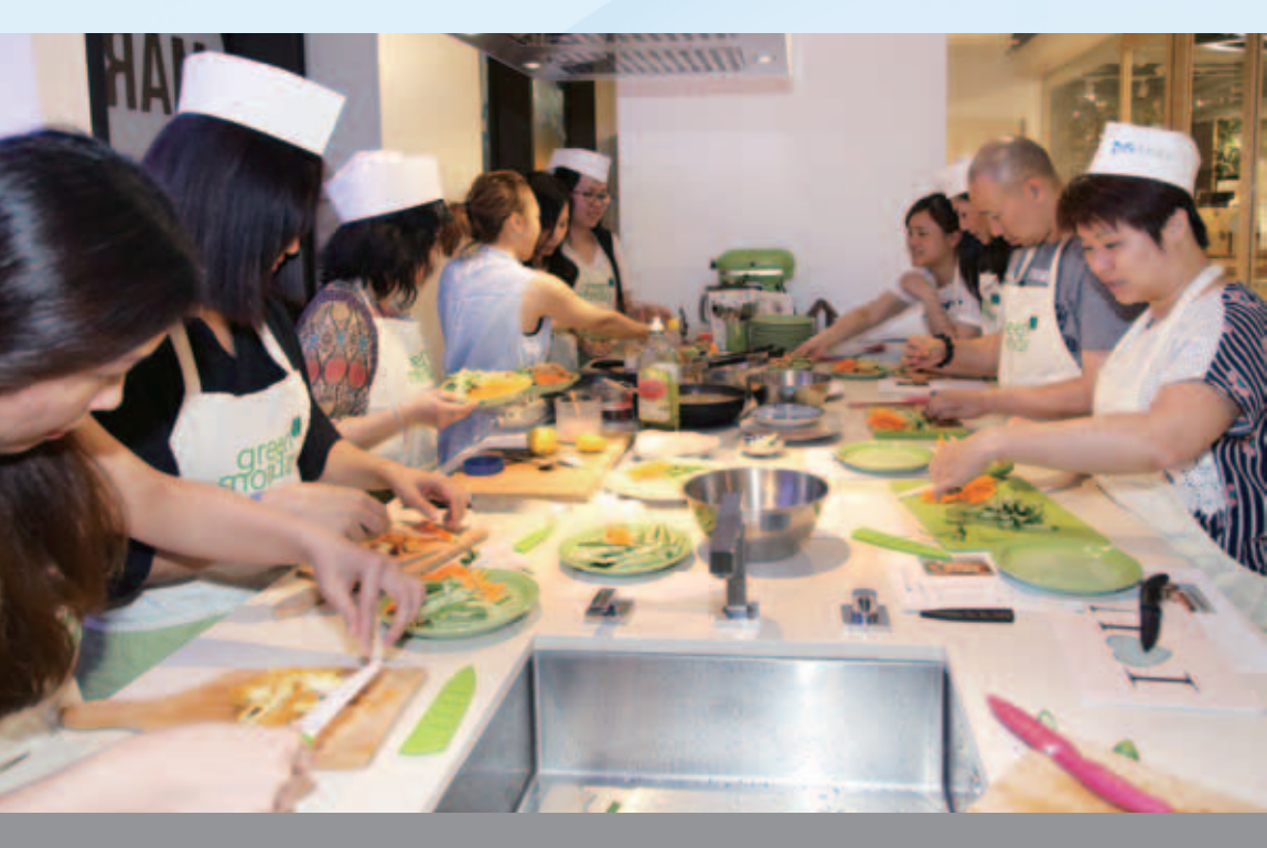
Staff members at Melco are constantly encouraged to live out a green office culture and pursue a wise choice of sustainable food.

All these accolades are demonstrations of the appreciation from the community and across different industries of the Group's commitment to pursue excellence in corporate governance and operational performance.