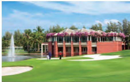
THAI COUNTRY CLUB, BANGKOK, THAILAND