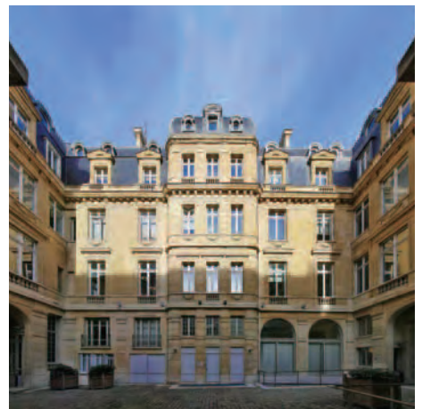
21 AVENUE KLÉBER, PARIS, FRANCE