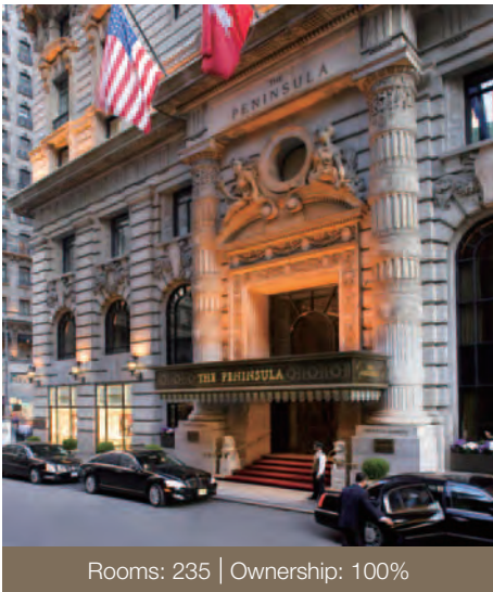
Rooms: 235 | Ownership: 100%