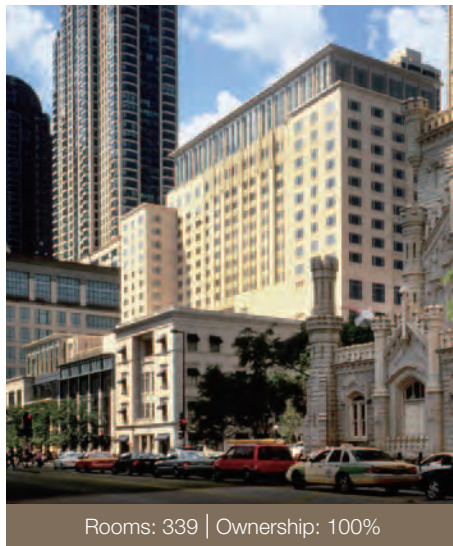
Rooms: 339 | Ownership: 100%

The Hongkong and Shanghai Hotels, Limited (HSH) was incorporated in 1866 and is listed on the Hong Kong Stock Exchange (00045). HSH is the holding company of a Group which is engaged in the ownership, development and management of prestigious hotels and commercial and residential properties in key locations in Asia, the United States and Europe, as well as the provision of tourism and leisure, club management and other services.