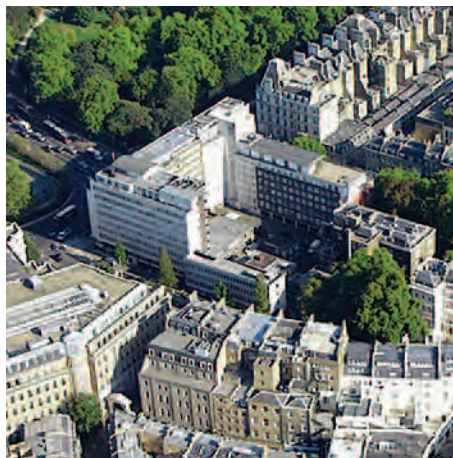
1-5 GROSVENOR PLACE, LONDON, UNITED KINGDOM