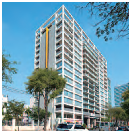
THE LANDMARK, HO CHI MINH CITY, VIETNAM