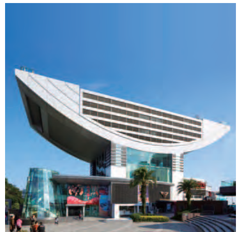
THE PEAK TOWER, HONG KONG