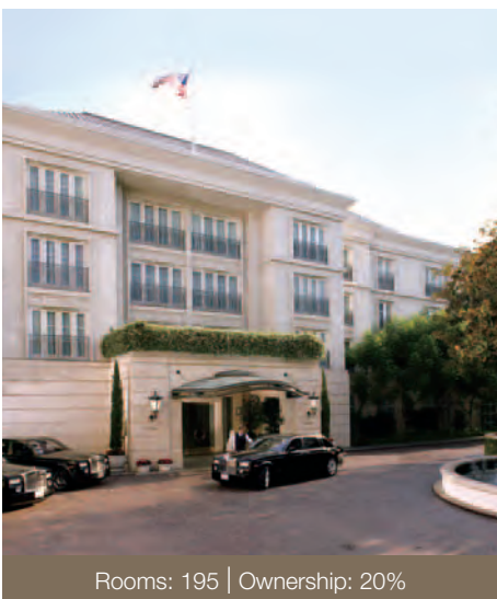
Rooms: 195 | Ownership: 20%