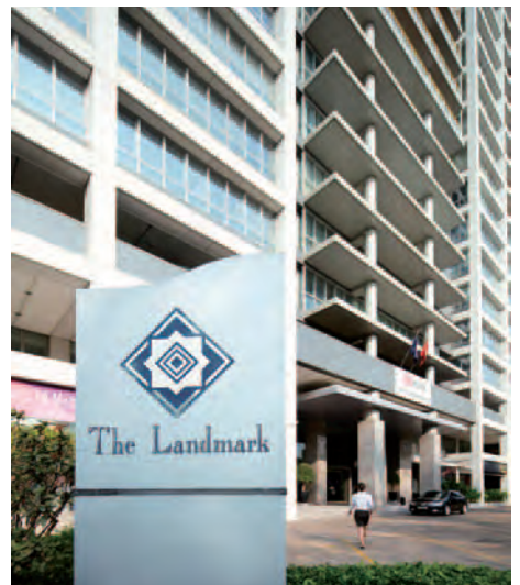
THE LANDMARK, HO CHI MINH CITY, VIETNAM