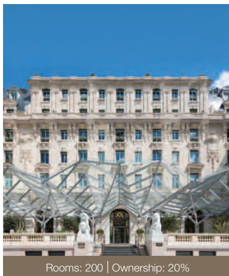
Rooms: 200 | Ownership: 20%