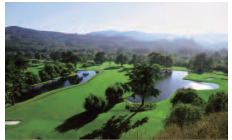
QUAIL LODGE & GOLF CLUB, CARMEL, USA