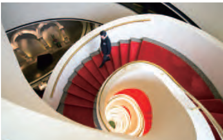
PENINSULA CLUBS AND CONSULTANCY SERVICES