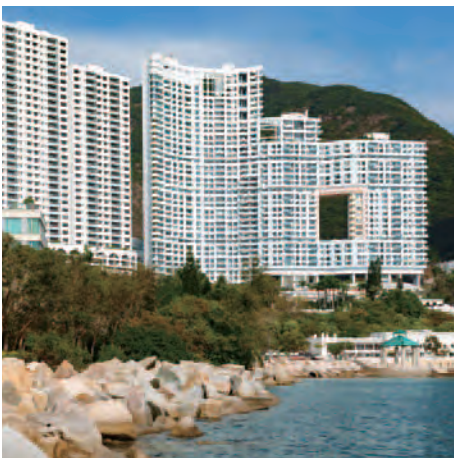
THE REPULSE BAY, HONG KONG