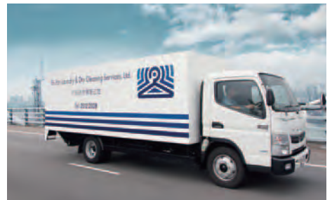
TAI PAN LAUNDRY, HONG KONG