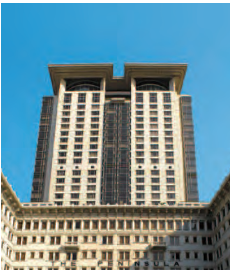
THE PENINSULA OFFICE TOWER, HONG KONG