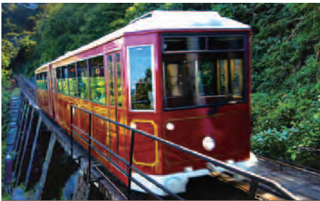
THE PEAK TRAM, HONG KONG