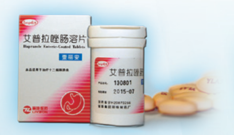
Ilaprazole Enteric Coated Tablets For treatment of duodenal ulcers.

During the year, there was no change to the principal activities of the Group. The Group is primarily engaged in the research and development, production and distribution of pharmaceutical products. The products of the Group covered drug preparation products, bulk medicines and intermediates as well as diagnostic reagents and equipment. Major products included Chinese and Western drug preparation products such as Shengqi Fuzheng Injection (參茂扶正注射液), a series of Bismuth Potassium Citrate Granules (麗珠得樂(枸櫞酸 鉍鉀)) products, Anti-viral Granules (抗病毒顆粒), Urofollitropin for Injection (麗申寶(注射用尿促卵泡素)), Menotropins for Injection (樂寶得(注射用尿促性素)), Ilaprazole (Ilaprazole Enteric Coated Tablet) (壹麗安(艾普拉唑腸溶片)), Voriconazole itraconazole for Injection (麗福康(注射用伏立康唑)) and Cefodizime Sodium for injection (Mouse Nerve Growth Factor for Injection) 麗康樂(注射用鼠神經生長因子) and Leuprorelin Microspheres for Injection (貝依(注射用亮丙瑞林微球)); bulk medicines and intermediates such as Mevastatin (美伐他汀), Colistin (硫酸粘菌素), Phenylalanine (苯丙氨酸), Ceftriaxone Sodium (頭孢曲松鈉); and diagnostic reagent products such as ELISA HIV Testing Reagent (HIV抗體診斷試劑), MYCOII Testing Reagent (肺炎支原體抗體診斷試劑(被動凝聚法)) and TPPA Testing Reagent (梅毒螺旋體抗體診斷試劑(凝聚法)).