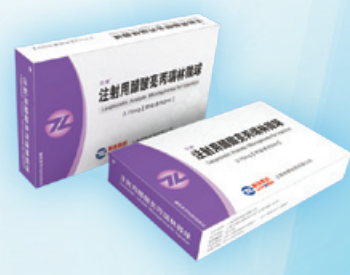
Leuprorelin Acetate Microspheres for Injection Endometriosis; fibroid.