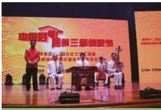
Solo performance of dizi in “Good Neighbor of China”, the Third Neighborhood Festival 中國好鄰居第三屆鄰里節笛子獨奏