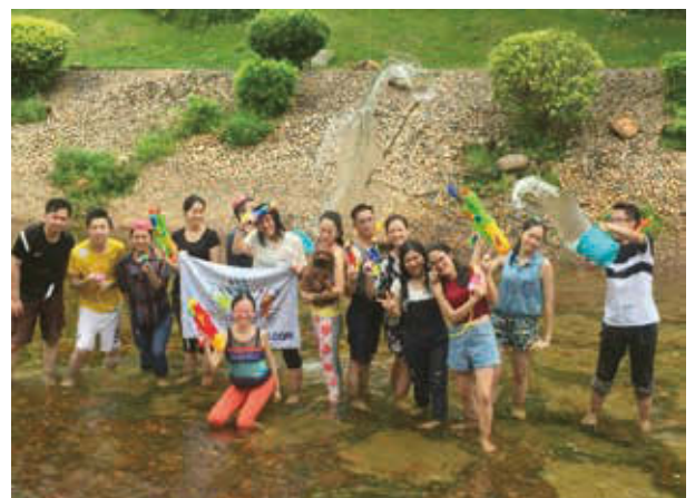
Outdoor Hiking Trip 戶外踏青旅遊