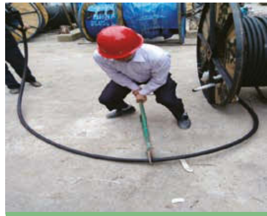
Sampling inspection of cables 電纜抽檢