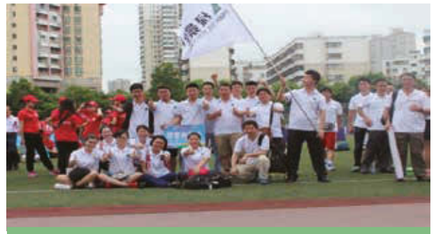
Outward bound training 戶外拓展訓練

注重瞭解員工訴求，關心員工心理，緩解員工壓力，積極解決員工關心的問題，不斷豐富員工的工餘文化生活，通過辦公室自動化共用平台加強員工之間的溝通、提升員工的滿意度、歸屬感，努力營造積極向上的和諧融洽的組織氛圍。本集團定期舉辦員工生日會、國內國際旅遊、各種體育競技比賽和節日慶典。二零一六年，本集團對員工進行了滿意度調查，調查結果顯示員工平均滿意度為90.4分。