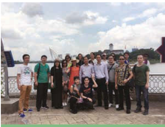
Singapore Tour 新加坡國際旅遊