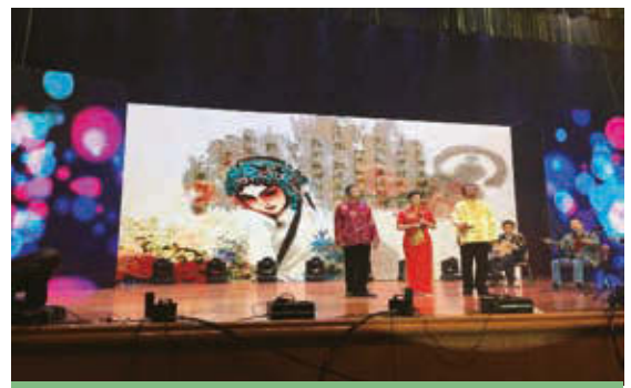
Peking opera performance in “Good Neighbor of China”, the Third Neighborhood Festival 中國好鄰居第三屆鄰里節京劇表演

綠憬會是由本公司發起成立的客戶聯誼組織，秉承「幸福綠景，一生友鄰」的宗旨，致力於建設融洽和諧的鄰里關係，營造和諧溫馨的鄰里關係和社區生活。過往年度，綠憬會持續舉辦「中國好鄰居」綠憬會鄰里節，開展了包括「綠景社區攝影大賽」、「趣味運動會」、「星藝廚藝大賽」、「社區文藝匯演」等互動活動，藉此希望改善鄰里之間人情漠然的現狀，弘揚鄰里守望相助的價值觀，建設社區文化。作為全城首個啟動「鄰里節」的地產開發商，綠景(中國)懷揣一顆精誠服務的心，以深圳這座年輕的移民城市為主陣地，聚焦快節奏的都市生活中「孩子沒有玩伴，老人沒有搭檔，鄰里沒有互助」的普遍現狀，聯合本公司開發的各大社區，引導人們尋回失落的鄰里記憶，在歡聲笑語中分享生活智慧，領悟幸福真諦，在城市中感受到更強烈的歸屬感。二零一六年，本集團舉辦中國好鄰居第三屆鄰里節暨第十二屆社區文藝匯演。本次匯演以「幸福鄰里·尋常生活」為年度主題，通過綠景物業智能化服務平台發佈會、社區文藝匯演、現場抽獎等形式，為來自本集團開發的住宅社區的近千名業主及嘉賓呈現出精彩、多元的綠景社區文化及人文關懷。