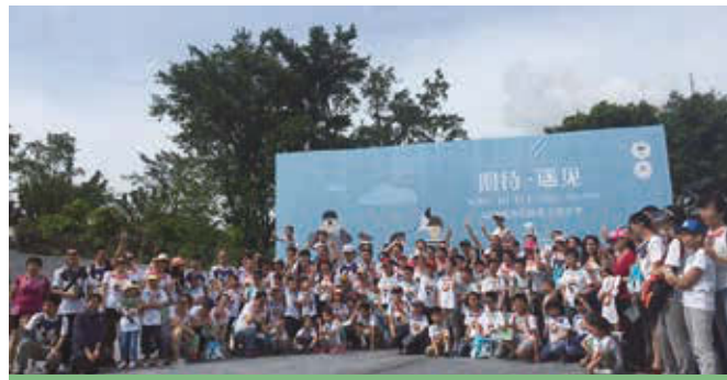
“Expect • Goodbye LVGEM Migrant Bird Parent-Child Carnival” 「期待•再見綠景候鳥遷徙親子嘉年華」活動

綠景(中國)多年來積極投身生態保護及資助環保公益組織。二零一六年度內，本集團向北京市企業家環保基金會捐款，資助阿拉善SEE生態協會改善和恢復內蒙古阿拉善地區的生態環境，減緩或遏制沙塵暴的發生，並推動中國企業家承擔更多的社會責任。本集團與深圳市紅樹林濕地保護基金會多次合作，共同保護瀕危邊緣的紅樹林。二零一六年度，本公司向綠景慈善基金會捐款，協助深圳市紅樹林濕地保護基金會在福田紅樹林生態公園舉行「期待•再見綠景候鳥遷徙親子嘉年華」活動。支持開展紅樹林系列科普教育活動，既是出於對自然之道的理解和崇尚，更是綠景(中國)始終站在企業公民的立場，熱忱參與各項社會公益和慈善事業的企業理念使然。