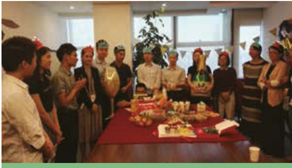
Birthday party for employees 員工生日會

LVGEM (China) placed emphasis on understanding the needs of its employees. Efforts were made to take care of their mental wellness, alleviate their stress, actively resolve their concerns and continuously enrich their cultural life after work. Through the use of office automation sharing platforms, LVGEM (China) has enhanced the communication among the employees and improved their satisfaction and sense of belonging, which has helped to create a positive and harmonious atmosphere throughout the organisation. The Group regularly held birthday parties, local and overseas tours, various sports competitions and festive celebration for employees. In 2016, the Group conducted an employee satisfaction survey and the survey results indicated that the average satisfaction of employees was 90.4 points.