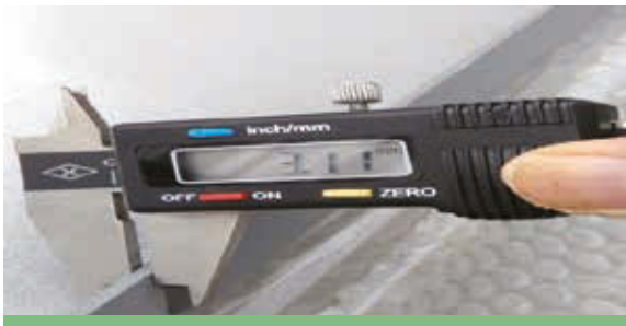
Inspection by actual measurements 實測實量檢查

綠景(中國)力爭為供應商提供公正的參與環境，儘量消除和供應商之間的信息不對稱。首先，我們結合大數據技術利用雲採購平台對全社會潛在供應商進行定期和專項招募，通過雲採購平台和招標管理系統形成了潛在供應商→準供應商→合格準供應商→合作供應商的金字塔層級管理模式。其次，通過參加深圳地產採購聯盟組織，我們與同行企業建立了供應商共享機制，簽訂了信用共享協定，對他們的優秀供應商進行吸納。