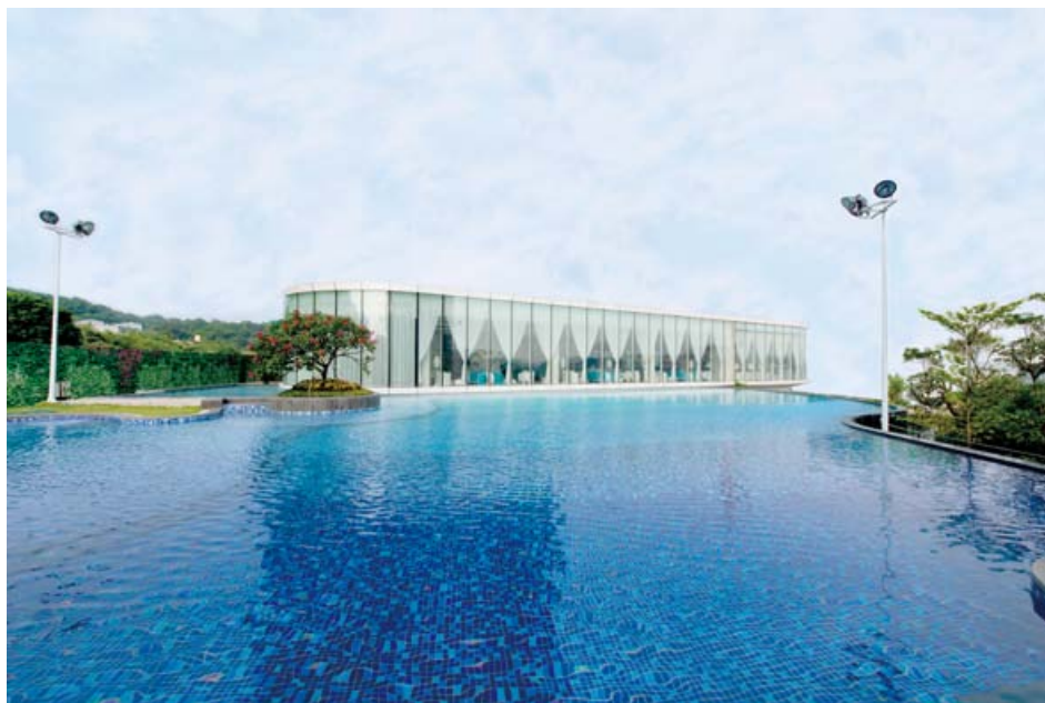
The Paramount, Guangzhou 廣州鼎峰項目

Chengdu Qing Cheng • Gen Yuan Development, Chengdu 成都青城 • 根園項目