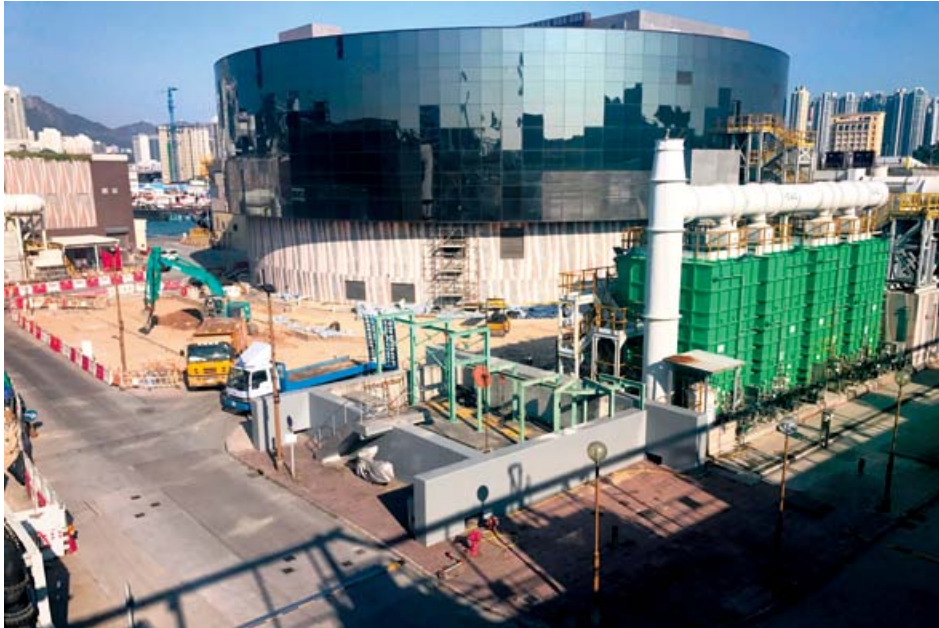
Stonecutters Island sewage treatment works for Drainage Services Department