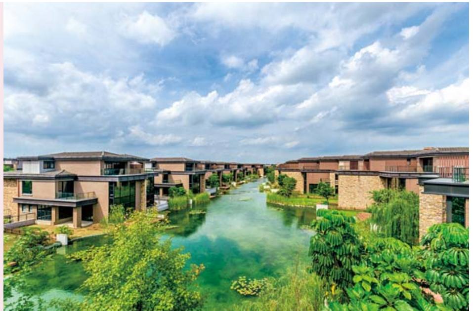
La Baie Palais, Heshan 鶴山峻廷灣項目