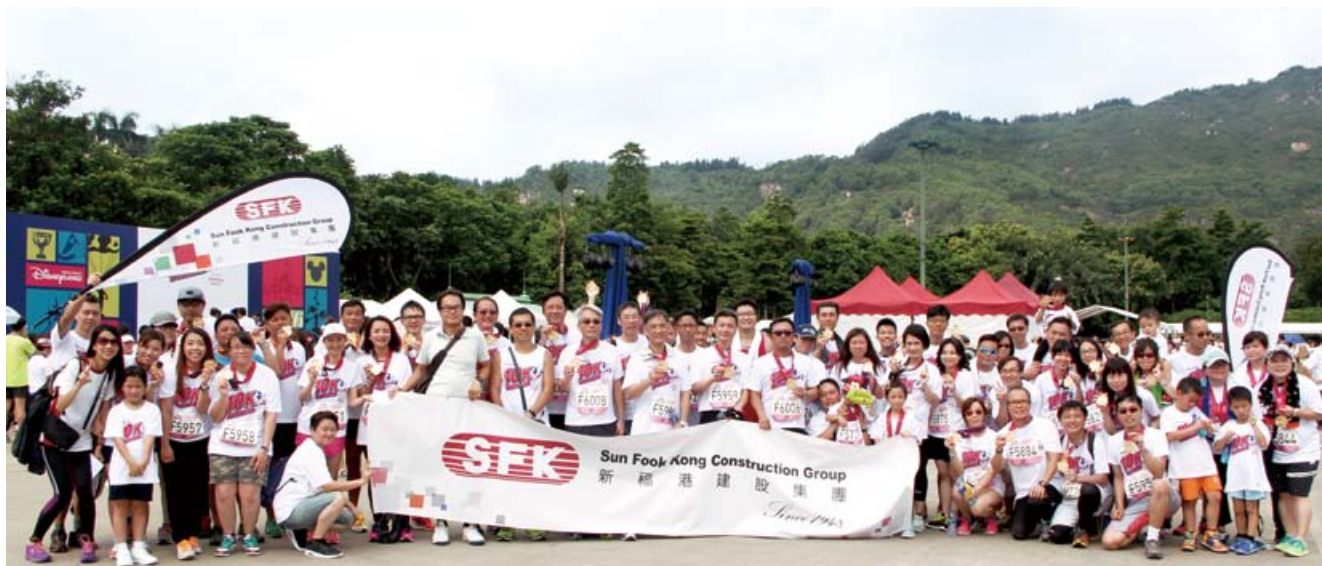
SFK staff and their family members participated in the "Hong Kong Disneyland 10K Weekend". 新福港員工及其家屬參加「香港迪士尼樂園 10K Weekend」。