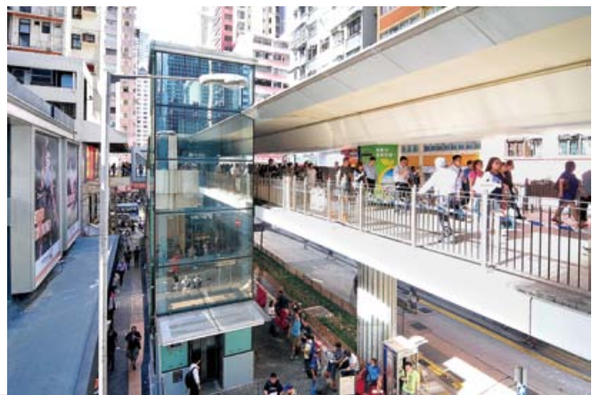
O'Brien Road 柯布連道

Provision of barrier-free access facilities for highways structures managed by Highways Department