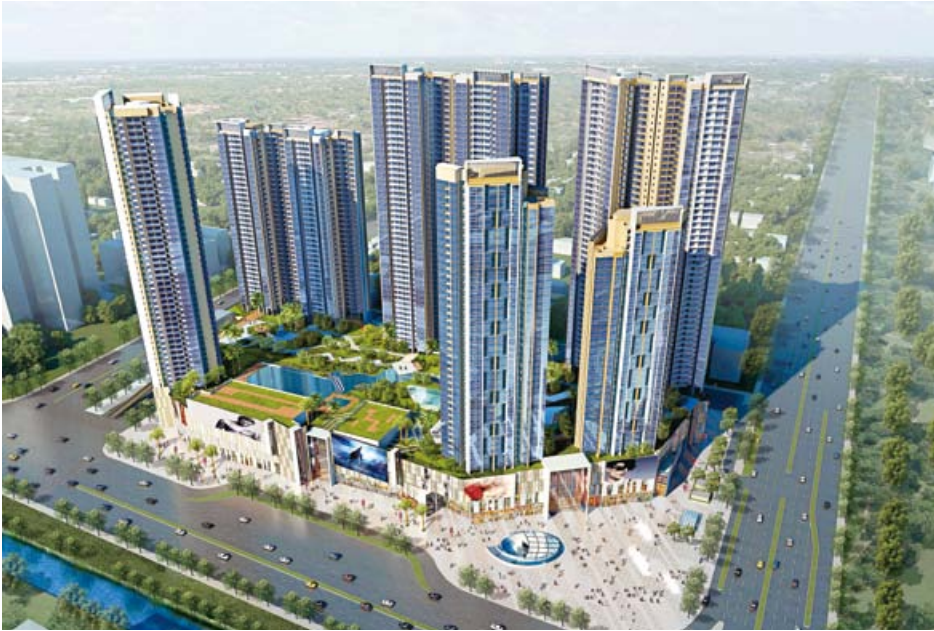
Foshan Sun Fook Kong Guang Chang Development, Foshan