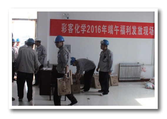
Figure 6. Dragon Boat Festival Welfare Activity 2016 圖六.二零一六端午福利發放活動

To acknowledge for the staff's contribution, the Group provide in total of 234 festival benefits on the eve of the Dragon Boat Festival.