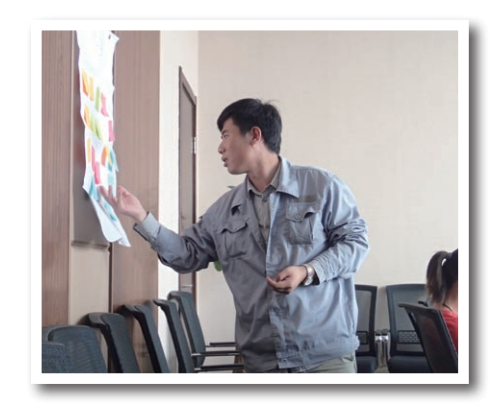
Deportment head's representative presented their consenses on materially issues 部門主管為大家總括重要性議題

本集團從ESG工作坊及持份者問卷中確認本集團與環境, 會及管治相關的重要議題。 部分員工認為與產品責任及 調產權相關的議題對本集團 一定的重要性,說明員產權, 記本集團獨有的知識產權, 相當重視產品的製造及發展。