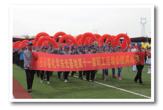
Figure 3. The Group has provided various activities for employees to enable them to achieve work-life balance 圖三.本集團提供不同的活動供員工參與,讓員工找到工作與生活的平衡

在報告期間,本集團符合所有有關 薪酬及解僱、招聘及晉升、工作時 數、假期、平等機會、多元化、反 歧視以及其他待遇及福利的相關法 律法規要求。