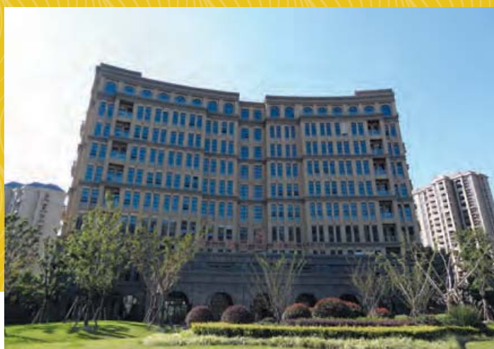
Commercial-cum-office Building 商用辦公大樓