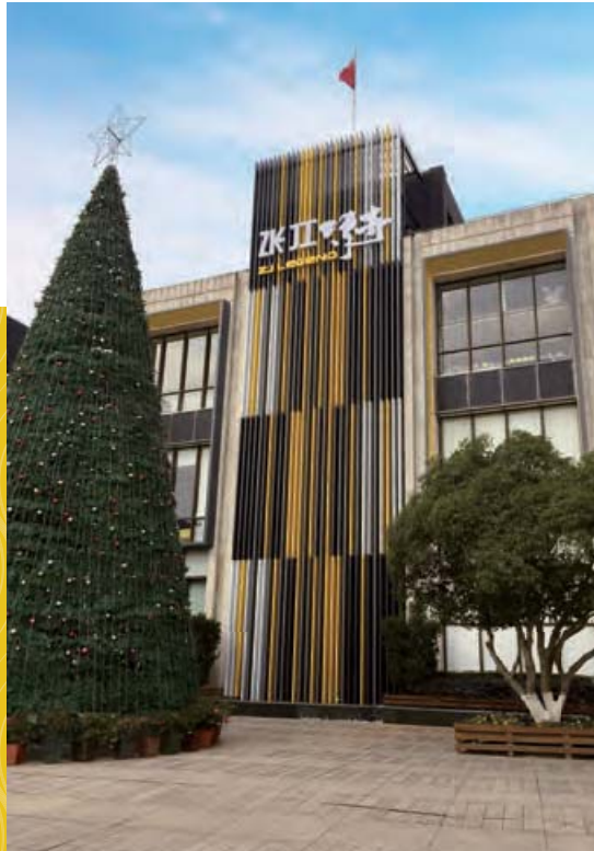
ZJ Legend 張江傳奇