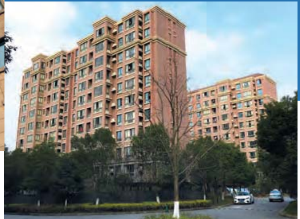
Zhangjiang Tomson Garden 張江湯臣豪園