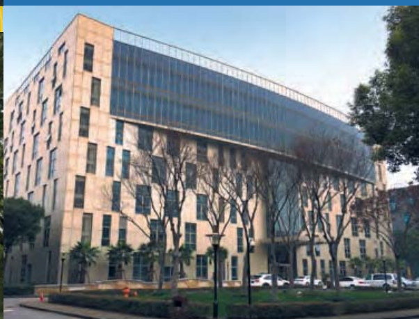
Zhangjiang Micro-electronics Port 張江微電子港