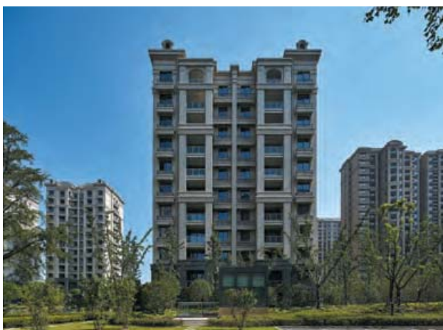
Tomson Ginkgo Garden 湯臣臻園