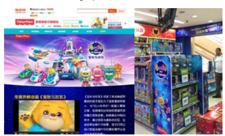
Bodhi and Friends toys available in retail outlets in China and Fisher-Price TMall store

■ Bodhi and Friends flagship animation series