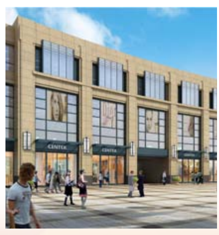
Regal Sky Walk, a shopping street in Regal Renaissance (*)