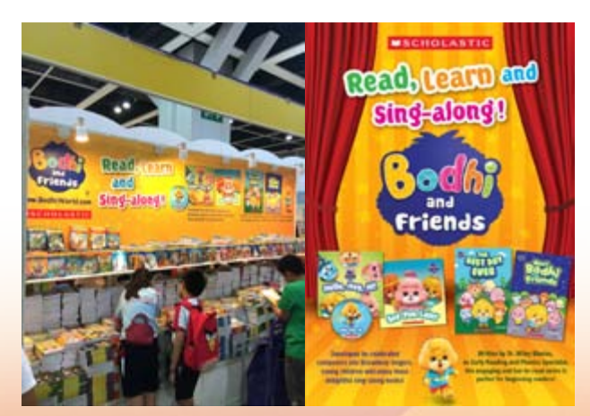
Scholastic's Books presents in Hong Kong