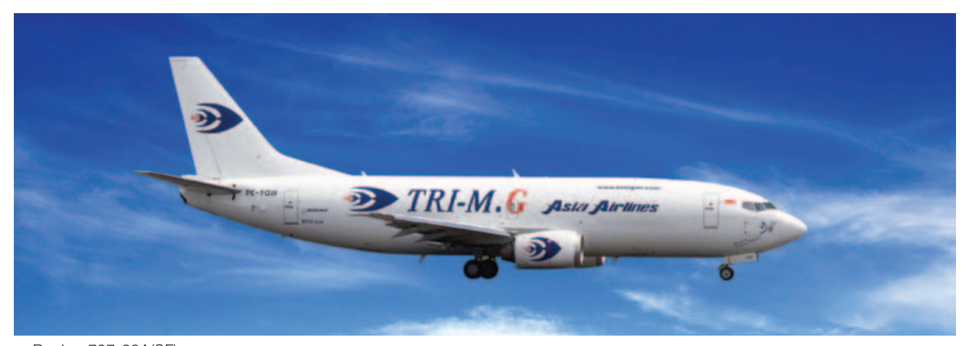
■ Boeing 737-33A(SF)