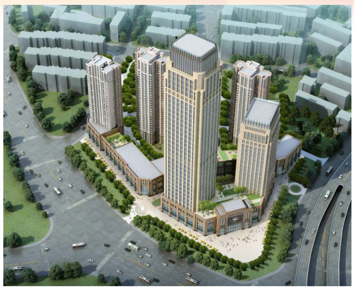
Regal Renaissance, a composite commercial/office/residential development in a prime location of Hedong District, Tianjin (*)