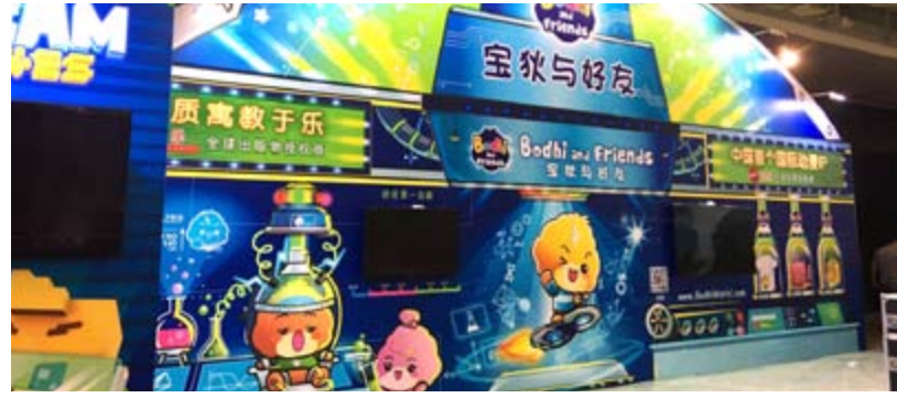
Participated in China Licensing Expo in Shanghai, China

■ Bodhi and Friends flagship animation series