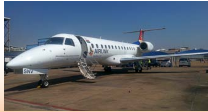
■ ERJ-135 Embraer Aircraft