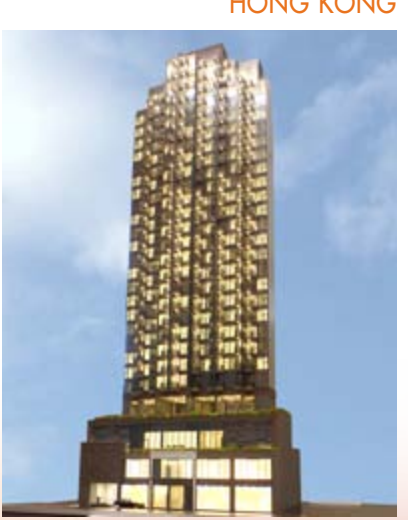
The Ascent, a commercial/residential development at No. 83 Shun Ning Road, Sham Shui Po, Kowloon – superstructure works in progress (*)