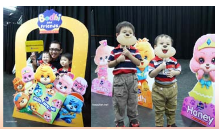
Scholastic's Books Preview Party in Malaysia