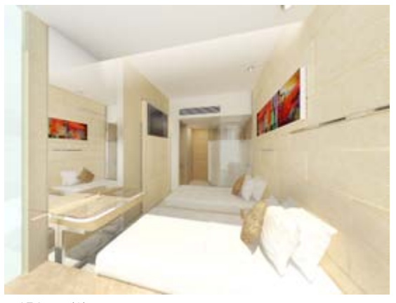
■ iPlus (*)