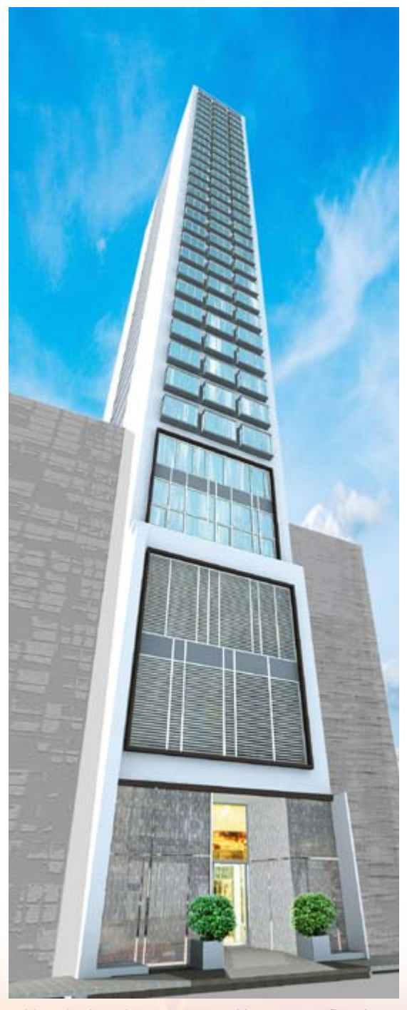
Hotel development at Nos. 5-7 Bonham Strand West and Nos. 169-171 Wing Lok Street, Sheung Wan – excavation works for pile caps are in progress (*)