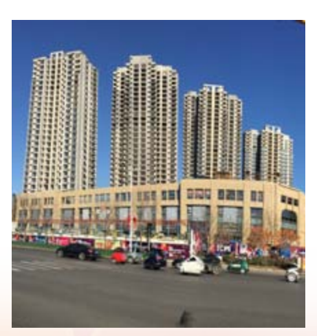
Residential and commercial portions of Regal Renaissance (*)