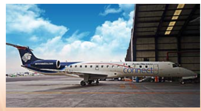
■ ERJ-145 Embraer Aircraft