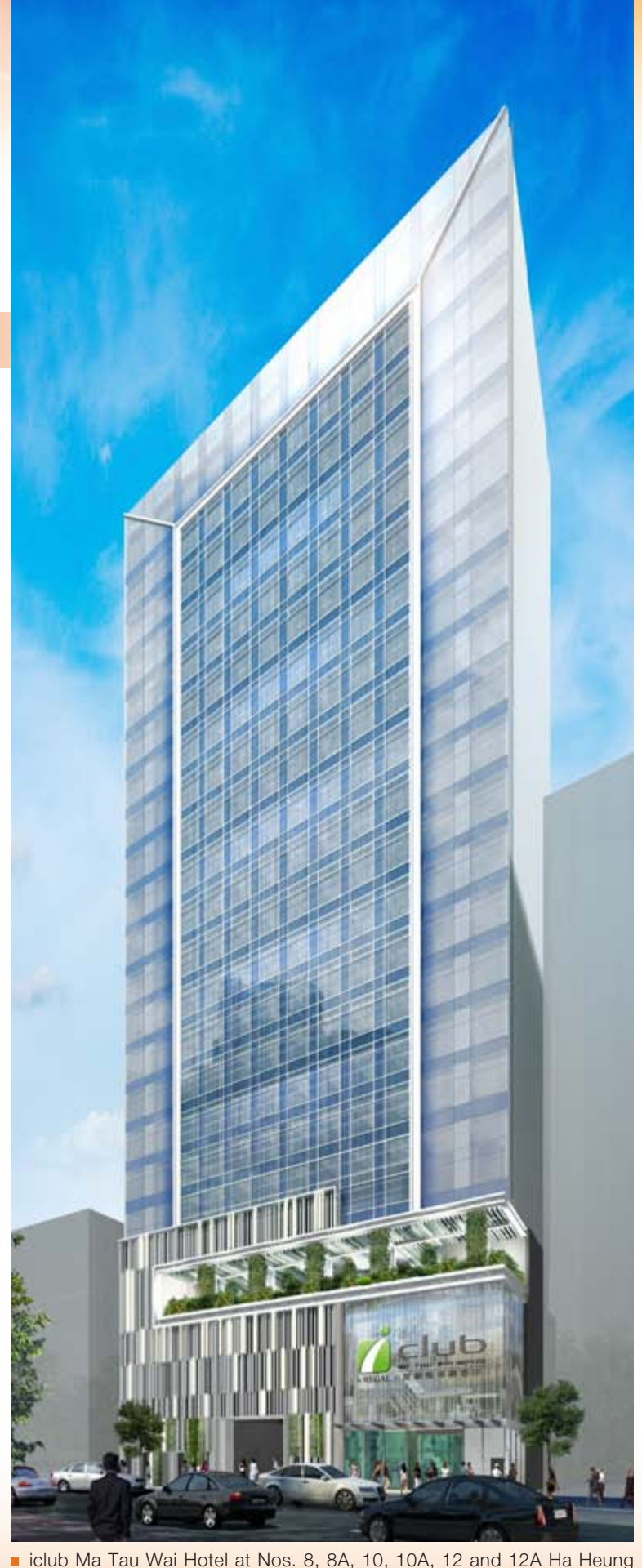
■ iclub Ma Tau Wai Hotel at Nos. 8, 8A, 10, 10A, 12 and 12A Ha Heung Road, To Kwa Wan, Kowloon – occupation permit already issued (*)