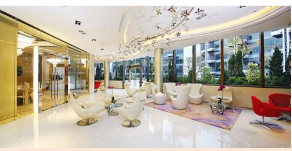
A luxurious garden house Club house of Casa Regalia and Domus in the Tan Kwai Tsuen Road development at Casa Regalia