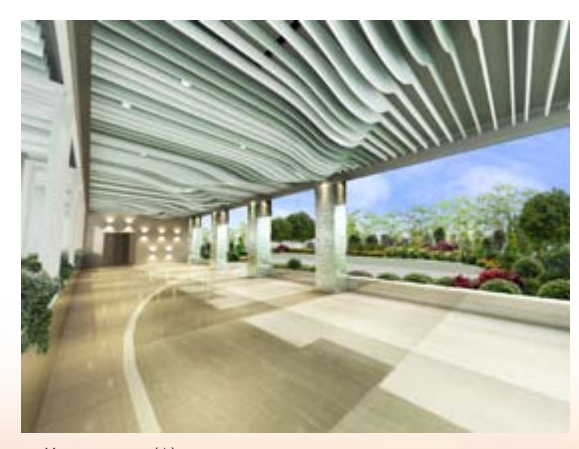
■ iLounge (*)