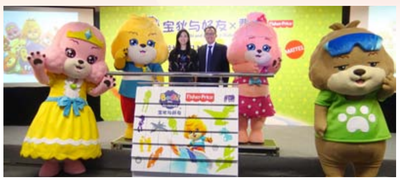
Announcement of Strategic Collaboration with Fisher-Price in Shanghai