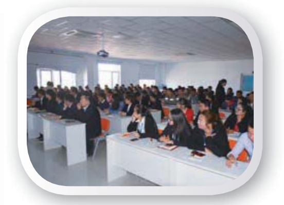
Figure: Occupational Health and Safety Training