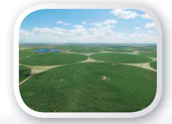
Figure: Shengmu Organic Grass Base

The "Shengmu Desert Organic Journey" includes various contents such as a tour of the Uulan Buh Desert scenic area, a welcome banquet, a tour of the production chain and a campfire party. The Group provides considerate and detailed arrangement for visitors, such as narration, accommodations and performances. Visitors to the Group's organic grass base, organic dairy farms and organic factories not only experience the beauty of the prairie and the desert, but also further understand the Group's ecological development path of feeding the desert, with social benefits coming first and economic benefits second.