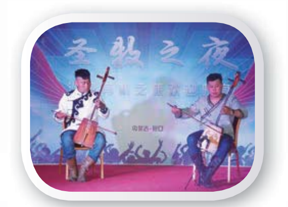
Figure: The "Shengmu Desert Organic Journey" Activity