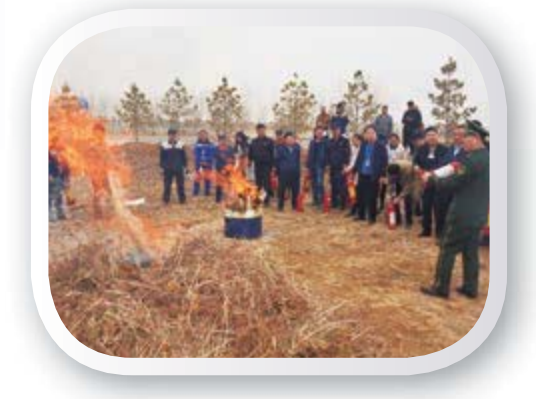
Figure: Fire Drills