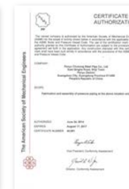
2011 (Renewed in 2014 續) ASME (美國機械工程師協會) (American Society of Mechanical Engineers)