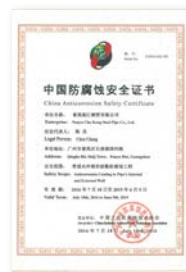
2016 CASC (中國工業防腐蝕技術協會) (China Industry Anticorrosion Technology Association)