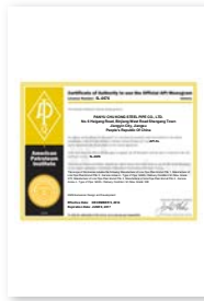
1996 (Renewed in 2011/2014 續) API (美國石油協會) (American Petroleum Institute)