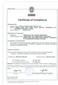
2002 (Renewed in 2009 2010/2014 續) BV (法國船級社) (Bureau Veritas)