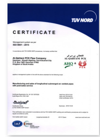
2016 ISO9001 (TÜV NORD CERT GmbH)