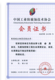
2016 CIATA (中國工業防腐蝕技術協會) (China Industry Anticorrosion Technology Association)