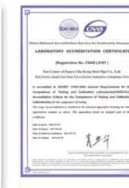
2011 (Renewed in 2014 續) CNAS (中國合格評定國家認可委員會) (China National Accreditation Service of Conformity Assessment)