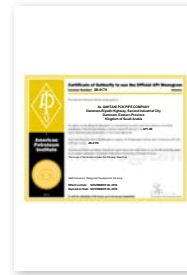
2016 API (美國石油協會) (American Petroleum Institute)