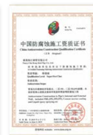
2016 CACQC (中國工業防腐蝕技術協會) (China Industry Anticorrosion Technology Association)