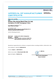
2006 (Renewed in 2010 2011/2015 續) DNV (挪威船級社) (Det Norske Veritas)