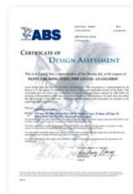
2014 ABS (美國船級社)