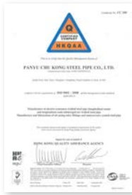
1996 (Renewed in 2010 2013/2016 續) ISO9001 (香港品質保證局) (Hong Kong Quality Assurance Agency)