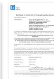
1999 (Renewed in 2010 2010/2013 續) CE (英國勞氏船級社) (Lloyd's Register of Shipping)