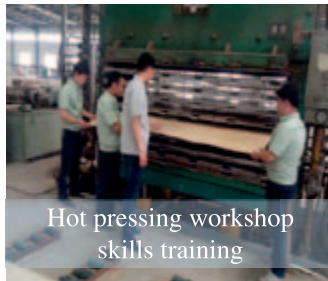
Hot pressing workshop skills training