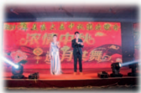
2016 Mid-Autumn Festival party

The Group prides itself on invariably providing generous employee benefits, a wide variety of activities and warm family atmosphere so that the employees can feel the kindness and care.