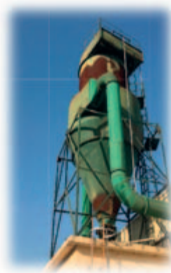
Waste Gas Treatment Facility