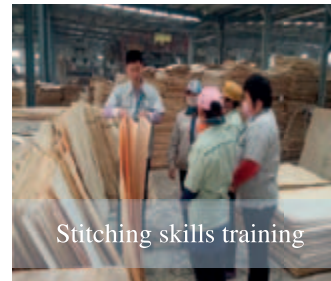
Stitching skills training