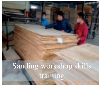
Sanding workshop skills training