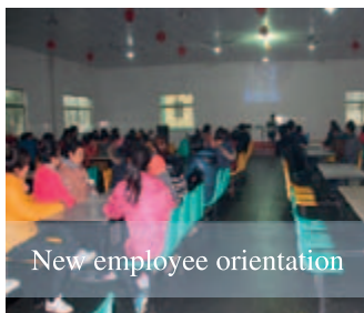
New employee orientation

New recruits receive orientations which enable them to adapt to the working environment and better perform duties. Trainings are also available for workshop technical personnel, environment and safety management personnel, quality inspectors and other personnel occupying key positions.