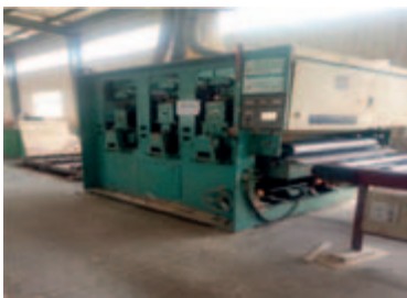
Electricity conservation notice

The main sources of water consumption of the Group are water usage in office blocks and residential quarters. The Group has intensified water conservation publicity, put up water conservation slogans, and encouraged staff to use water reasonably. The Group addresses usage of energy (water, electricity, oil etc.) through monthly usage summary, critical control of heavy power consuming equipment and regulation of equipment operating procedures to achieve improvements in energy efficiency.