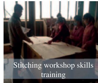
Stitching workshop skills training