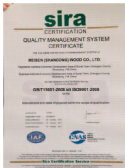
Meisen ISO 9001 Certificate

Meisen (Shandong) conducts inspection over purchased products, processed products and finished products; uninspected or defective products are not allowed to be processed, transferred, stored or delivered.