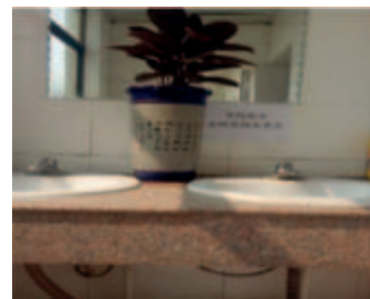
Water conservation notice