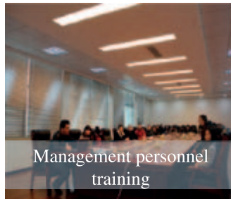
Management personnel training