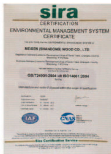
The ISO 14001 Certificate of Meisen

The Group strives to realise sustainability of resources, ecology, operation and society in the ordinary course of its business. For that purpose, it has endeavored to apply the best practice in forest utilisation, reduce damage and waste, avoid excessive consumption and over logging, and continually launch clean products to the market. It has been focusing on regulating day-to-day environment management through standard management system. Meisen (Shandong), for example, has set up the ISO 14001 environmental management system and gained certification from an independent third party organisation.