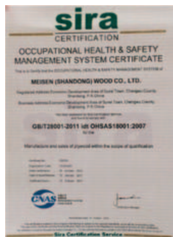
Meisen OHSAS 18001 Certificate

Subject to laws and regulations including the Labor law of the PRC, the Law of the PRC on Work Safety and the Prevention and Control Law of Occupational Diseases of the PRC, the Group attaches great importance to employees' health and safety, and provides healthy, safe and comfortable working environment. Emphasis has been put on regulating the Group's occupational health and safety management work using standard management system. For example, Meisen (Shandong) has obtained OHSAS 18001 certification from an independent third party and put in place demonstrably sound occupational health and safety performance, where a series of procedures were established, such as the Environment, Occupational Health and Safety Operation Control Procedures, Hazard Identification and Risk Evaluation and Control Procedures and Emergency Preparedness, Response and Control Procedures. Besides, the Production Safety Management Policy and Safety Production Training Management Policy were formulated to serve as production safety guidelines.