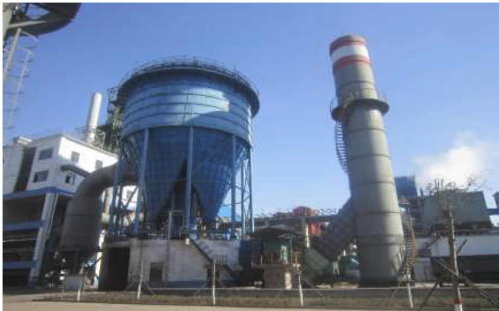
Figure 2 – Feed Launder Dust Removal System in Blast Furnace

The Company pays much attention to the generation and disposal of hazardous wastes. All wastes produced in 2016 were disposed of properly. Waste engine oil and oil drums of the Company, for example, were all delivered to qualified operators for disposal.