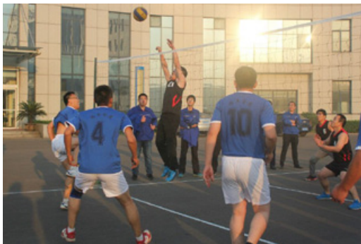
A tradition of morning exercise promotes good team work