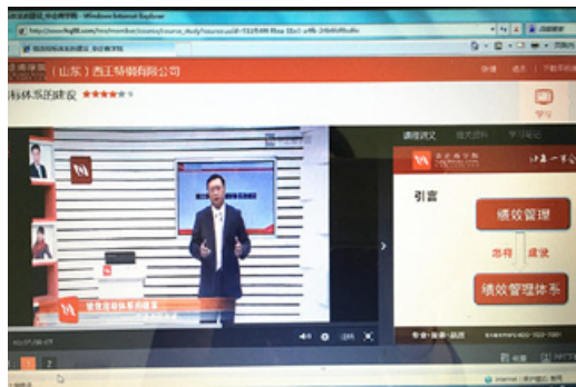
e-Learning platform powered by Jucheng