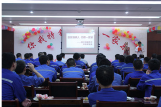
Celebrate Mid-autumn Festival