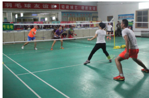
Badminton court is a ground for employees to play a match and establish a rapport.