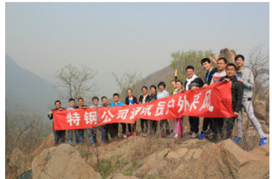
Field Trip in Autumn of Reporters