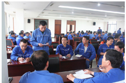
Leaderless group discussion