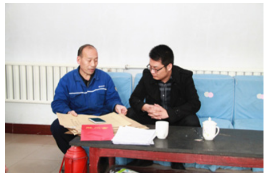
Visiting workers under difficulties to share the warmth from the Company