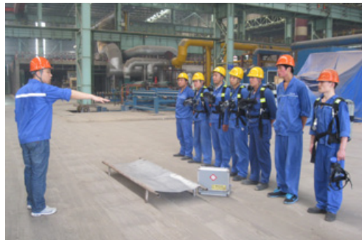
Safety Emergency Response Drill

The Company reported no incidence of production accident of materiality or new case of any occupational disease in 2016. The occupational disease awareness rate, the detection and evaluation rate and the employee health checkup rate were all marked positively at 100%. A raft of activities were organized to mitigate and eliminate hidden hazards and all production safety efforts were paid off and supported the realization of business goals, including hidden hazard identification and control, safety emergency response drill, employee safety education, close monitoring and management of key hazards and safety knowledge contest.