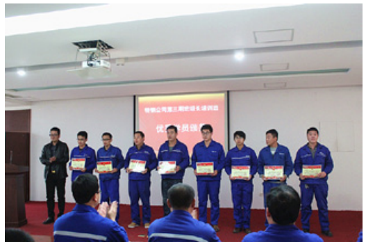
Graduation ceremony for the grassroots leader workshop