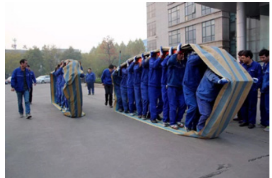
Morning Exercise "Unrivalled Wheel"