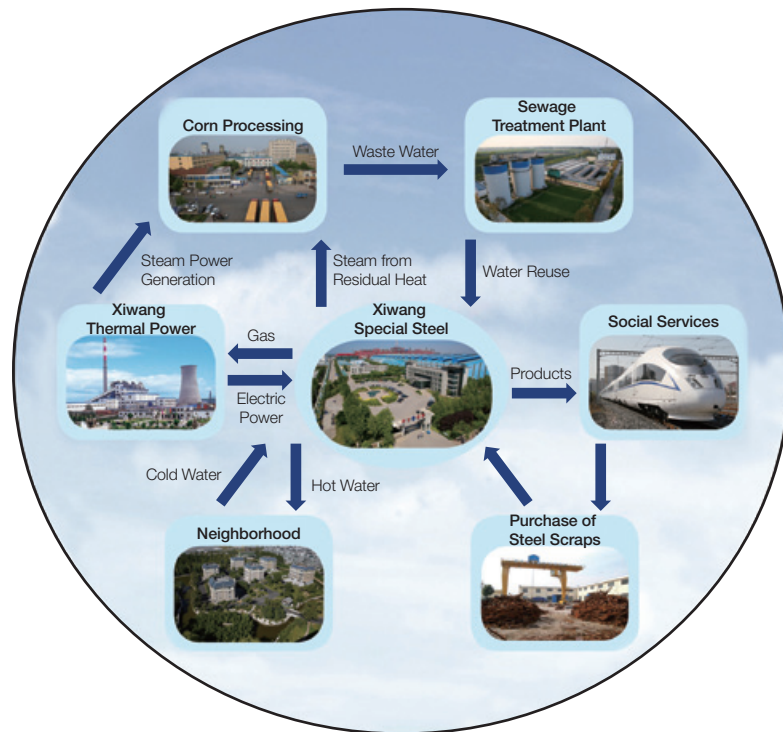
Figure 3 – Xiwang Special Steel External Cyclic Economy Diagram

Dust containing iron is reclaimed to sintering completely, as raw materials.