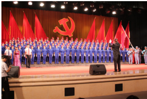
Fantastic Youth, Wonderful Special Steel Vocal Concert

In terms of software, group and sport activities are organized frequently to boost communication, teamwork learning and growth of the staff, relieve them of stress, vitalize their life and stimulate their creativity.