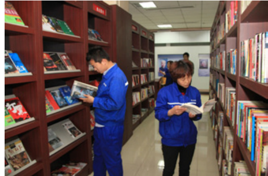
Library to provide a better learning environment for staff