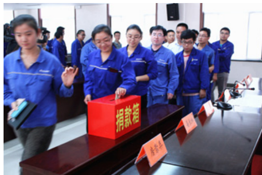
Organized Benevolence Day event to express love and care to the supporting people in disaster areas

Philanthropism spreads positively in the Company. The staff of the Company are solidaric and willing to help each other and have a bond of common interest. Aids are extended to disadvantaged employees in an open, equal, impartial and effective manner. Showing goodness, paying back the society, being willing to give and share social responsibility, these values have been instilled into the staff and become their spontaneous act.