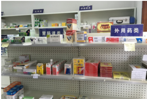
Clinic to safeguard the health of the staff

In terms of hardware, the Company makes available a comfortable, well-lit, safe and healthy work environment, and a lot of amenities, including dormitory, canteen, bathroom, library, clinic, badminton and Ping-Pong facilities for the employees, in order to build a safe, carefree and comfortable Xiwang Group community.