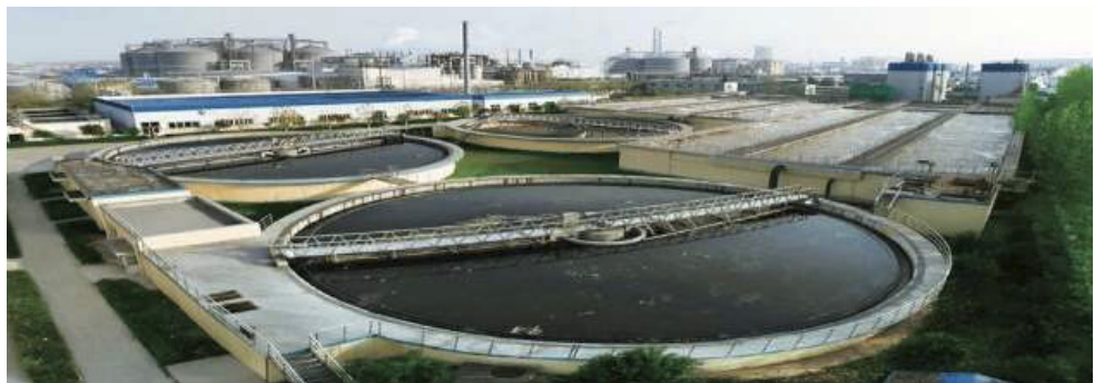
Figure 1 – Xiwang Group Sewage Treatment Plant