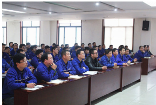
Prospective leader workshop