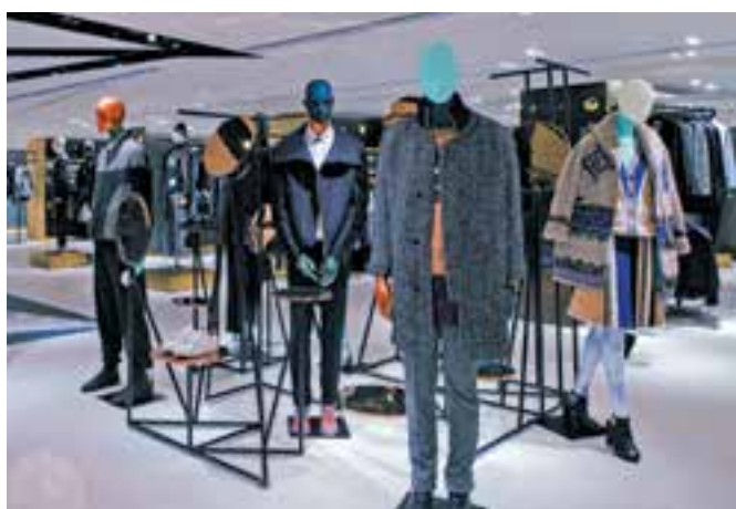
Menswear and accessories at Landmark Harvey Nichols Store. 於「置地Harvey Nichols店」的男士時裝及配飾。