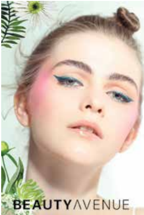
Cosmetics and beauty products at Beauty Avenue. 於「Beauty Avenue」的化妝及美容產品。