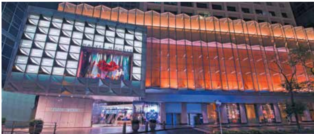
Newly renovated Harvey Nichols store at Landmark, Central, Hong Kong ("Landmark Harvey Nichols Store"). 位於香港中環置地廣場新裝修的「Harvey Nichols」店（「置地Harvey Nichols店」）。

Various store / boutiques / corner newly opened or renovated by the Group during the year.