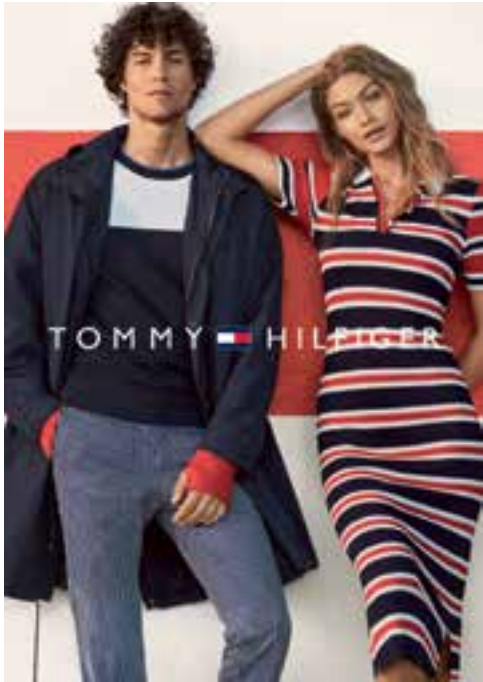
Fashionwear by Tommy Hilfiger. 「Tommy Hilfiger」時裝。