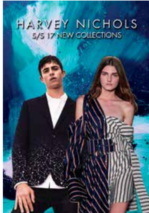
Spring / Summer 2017 fashion at Harvey Nichols. 於「Harvey Nichols」的二零一七年春/夏季時裝。

Shareholders will have an option to receive the final dividend either in cash or wholly or partly in the form of new and fully paid ordinary shares in lieu of cash under the Company's Scrip Dividend Scheme. A circular with details of the Scrip Dividend Scheme and the relevant election form are expected to be despatched to shareholders on or about Thursday, 10th August, 2017.