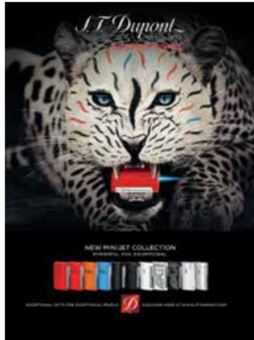
S.T. Dupont 'NEW MINIJET COLLECTION' lighters. 「都彭」的「NEW MINIJET COLLECTION」打火機。