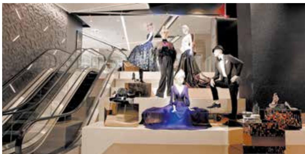
Fashionwear and accessories at Landmark Harvey Nichols Store. 於「置地Harvey Nichols店」的時裝及配飾。