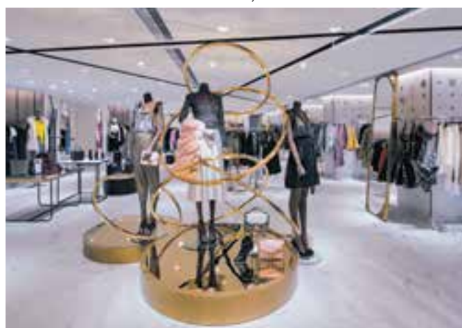
Ladieswear and accessories at Landmark Harvey Nichols Store. 於「置地Harvey Nichols店」的女士時裝及配飾。