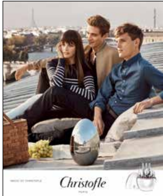
Christofle 'MOOD' collection tableware. 「Christofle」的「MOOD」系列餐具。