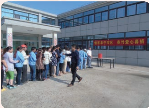
Yancheng Chunzhu "Love Donation" 鹽城春竹愛心募捐活動

本集團的企業文化建設和宣傳工作將會隨着時代的變化，科技的發展，不斷尋求創新和突破，把最好的、最積極向上的、最值得企業沉澱的好文化、好思想傳遞給員工，提高員工的滿意度、增強員工的歸屬感和自豪感，提升企業的形象、知名度和美譽度。