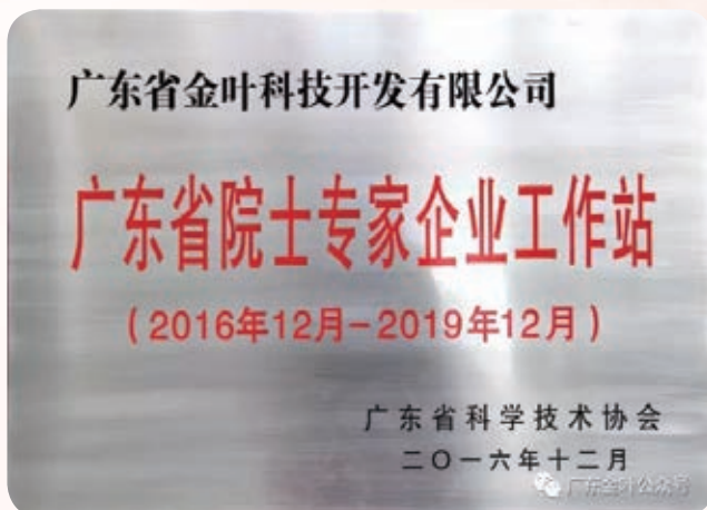
Guangdong Jinye was accredited as "Guangdong Province Academician Expert Enterprise Workstation"

報告期內，廣東金葉被廣東省科學技術協會授予「廣東省院士專家企業工作站」榮譽稱號，彰顯了廣東金葉在企業技術創新方面的強大實力，對該公司持續掌握再造煙葉行業核心技術，鞏固行業科技領先地位將起到重要作用。