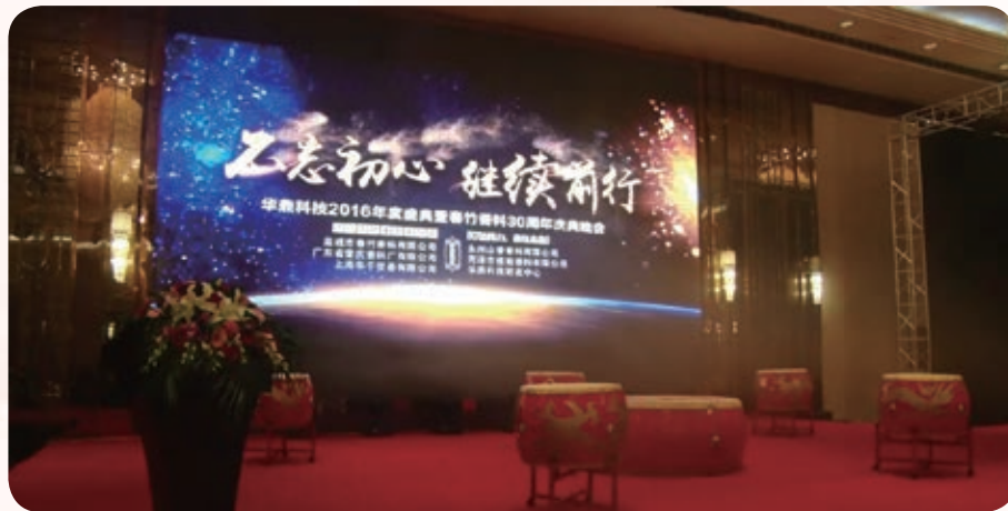
Huading Technology Annal Gathering 2016 華鼎科技2016年會

The Group's construction of corporate culture and advertising work will constantly seek innovation and breakthroughs with the change of time and the development of technology. And will pass the best, the most optimistic and the most worthy precipitation of corporate culture and thoughts to the employees to improve the employee satisfaction, sense of belonging and pride of employees and enhance the corporate image, awareness and reputation.