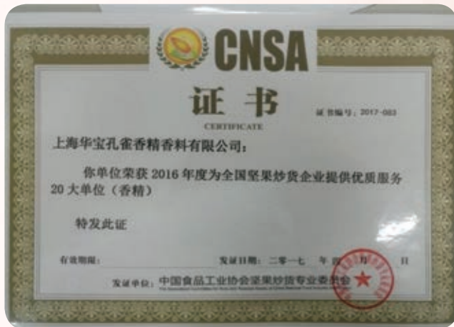
Huabao Kongque was granted "Top 20 Quality Services Suppliers for Nuts and Roasted Food Industry (flavours)" 華寶孔雀獲「堅果炒貨優質服務證書」

本集團在乳品飲料、堅果炒貨等市場中具備較好的技術水平。客戶群體涵蓋了部份國家知名企業，有著完善的客戶資源和先進的乳化技術及提取技術等。報告期內，華寶孔雀憑借自身的品牌優勢，瞄準細分市場，以烘焙和乳品行業作為突破口，打造食品香精加食品配料的平台，取得了良好的效果。尤其是在飲料市場和糖果市場不景氣的情況下，華寶孔雀依托技術研發實力和穩定的客戶資源，仍然取得了一定的業務增長。其中，炒貨類香精在保證傳統產品的質量和服務之外，研發重心側重中高檔堅果，並已成功打入新的大客戶；乳品香精銷售收入逆勢增長，主要源於為已有的大客戶研發新的產品和開發新客戶，包括啤酒行業的大客戶等。