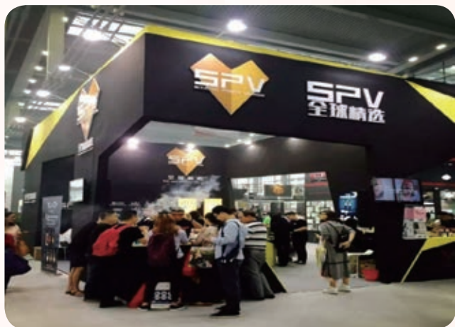
Standpoint attended e-cigarette exhibition 立場參加電子煙展會