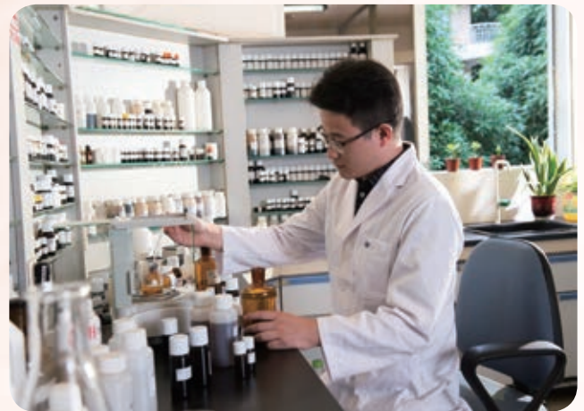
Technology Department 技術部門