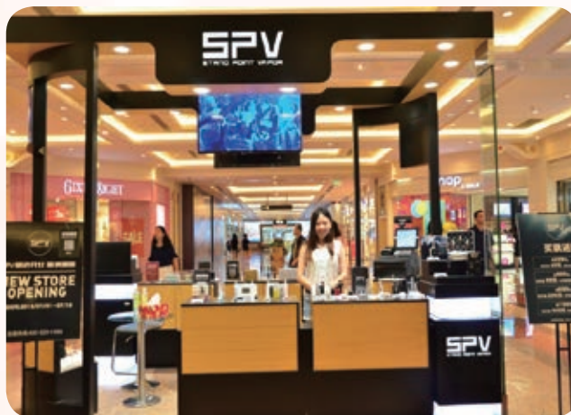
Physical store of Standpoint located in Shanghai 立場位於上海的直營店

In terms of international market, due to the gradually strengthened regulatory impact of FDA and the fiercely competitive market, the sales of VMR in international market have been seriously challenged. During the reporting period, VMR's revenue was flat as compared to last year and the losses declined. But its actual performance still did not reach expectations and the management expected that the future development of e-cigarette would still be challenging. The Group, according to the result of goodwill impairment test and the sake of prudence, decided to write off part of the goodwill arising from the acquisition of VMR by RMB22,710,000.