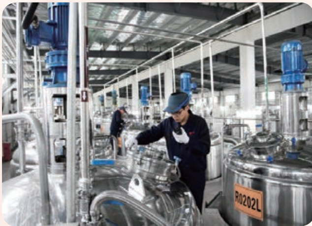
Manufacturing workshop 生產車間

面對煙草行業產銷雙降，庫存高居不下的嚴峻形勢，傳統的煙草用香精銷售方式受到挑戰。本集團正積極採取相應的對策，以市場需求為出發點，深刻洞察國內外香精行業發展的新趨勢、新技術和新領域，進一步加強團隊建設、產品開發和業務模式的升級。一方面，調整產品結構，推動客戶現有產品的升級換代，增加對客戶現有產品的市場滲透率；另一方面，把握消費升級機遇，通過消費者洞察為客戶發掘新的市場機會，提供一攬子解決方案，拓展新產品、新業務市場；從而不斷完善公司核心產品結構，豐富產品系列，以滿足客戶的多樣化需求。