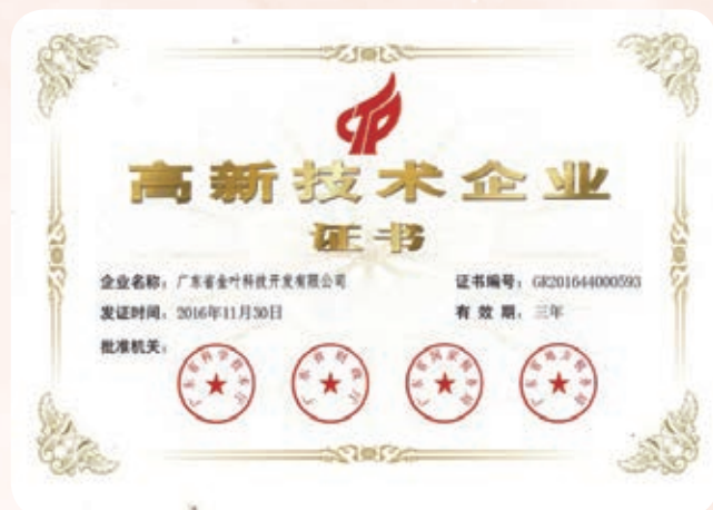
Guangdong Jinye was awarded the "High and New Tech Enterprise"