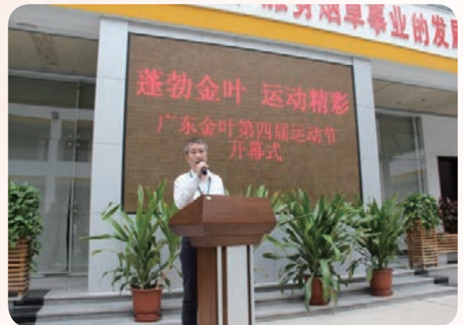
The Opening Ceremony of Employee Sports Game in Guangdong Jinye 廣東金葉職工運動會開幕