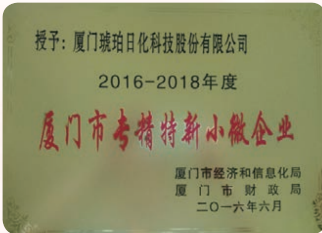
Xiamen Amber was awarded "Special New Small and Micro Enterprise" 廈門琥珀獲「專精特新小微企業」稱號