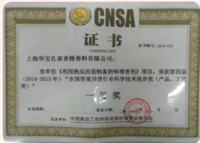
Huabao Kongque was awarded the First Prize in Science and Technology Progress 華寶孔雀獲科學進步獎一等獎