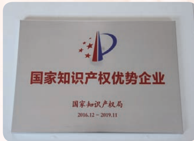
Guangdong Jinye was granted "National Intellectual Property Advantage Enterprise"

再造煙葉方面，廣東金葉獲中國煙草總公司技術發明三等獎，其研發項目《加熱不燃燒煙草製品用發煙介質的研究與應用》被評為國煙局重大專項之一。廣東金葉還被授予「廣東省院士專家企業工作站」、「廣東省高新技術企業」、「國家知識產權優勢企業」及「汕頭市知識產權優勢企業培育企業」等榮譽稱號，標志着廣東金葉在推進產學研合作、引進聚集高層次人才方面邁出了堅實的一步。2017年1月，廣東金葉與廣東中煙共建的「煙草行業再造煙葉技術研究重點實驗室」成為入選的唯一再造煙葉領域實驗室，廣東金葉由此成為全國唯一擁有國家重點實驗室的煙草薄片企業。這既代表着國煙局對廣東金葉行業貢獻與創新成果的高度評價，同時彰顯出公司行業領先的技術優勢與科研水平。