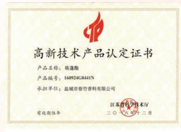
Yancheng Chunzhu's new product "Glibenolide" was awarded "High and New Tech Product Certificate"

報告期內，鹽城春竹新研發的產品「格蓬酯」獲江蘇省科學技術廳認定為高新技術產品；同年鹽城春竹還被江蘇省授予「綠色低碳環保企業」榮譽稱號。