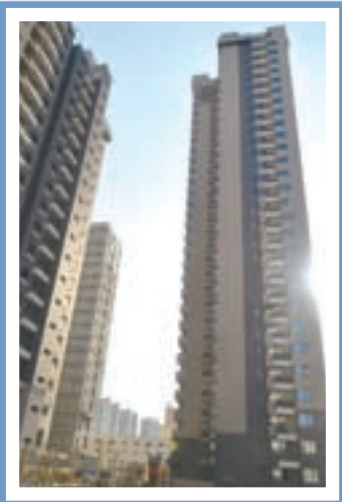
開封迪臣世博廣場 住宅區 Kaifeng World Expo Plaza Residential Area