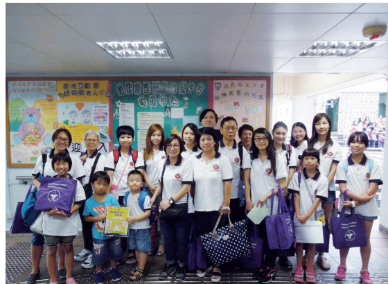
Mooncake Delivery Voluntary Services 2016 (同心關懷賀中秋 2016)