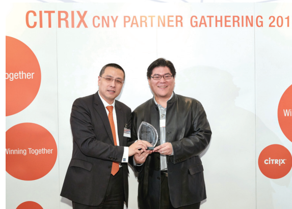
Citrix Systems, Inc - The Top Performer (Virtualisation) 2016