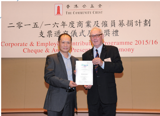
The Community Chest 2015/16 Corporate & Employee Contribution Programme-Cheque & Award Presentation Ceremony