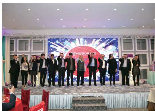
Annual Dinner 2016