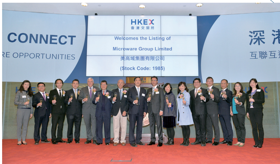
Listing Ceremony - Successful listing on the Main Board of The Stock Exchange of Hong Kong Limited on 8 March 2017