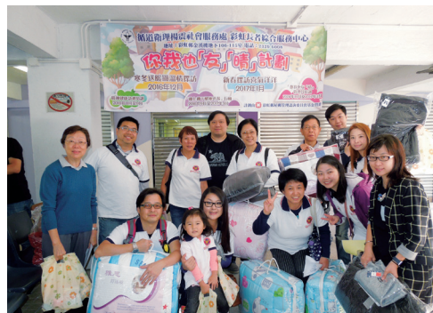
Winter Elderly Care Programme 2016 (寒冬送暖 顯溫情 2016)