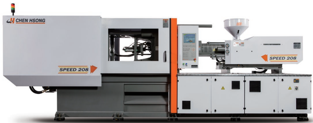
SPEED伺服驅動節能高速注塑機 SPEED Servo Drive High-speed Injection Moulding Machine

During this financial year, the Group's new, "Sixth-Generation" MK6 (Mark-Six) series of injection moulding machines, which were based on Japanese technology, continued to garner significant market praises, with close to 700 sets sold by the end of this financial year and projected to break through 1,000 sets by May 2017 – an extremely encouraging rate of take-up. The MK6, product of years of R&D investments by the Group yielding high return, is an all-rounding performer with superior stability and price-performance ratio, achieving a "repeat-order ratio" (i.e. the portion of customers purchasing the MK6 and coming back for new purchases) that was the highest in recent history of the Group. Within a very short period of time, this product line will become the Group's new star product, and is expected to gain substantial market share in the future.