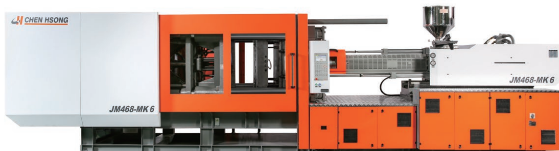
捷霸MK6伺服驅動注塑機 JETMASTER MK6 Servo Drive Injection Moulding Machine

Due to an unexpectedly robust market during the second half, with demands concentrated on the MK6 and two-platen product lines, the Group experienced certain supply chain difficulties due to the unavailability of spare parts and other bottlenecks at vendors. As a result, there were demands that the Group had not been able to fulfill due to lack of products – a situation that the Group is actively resolving through working closely with suppliers to increase their capacities and developing new supply sources.