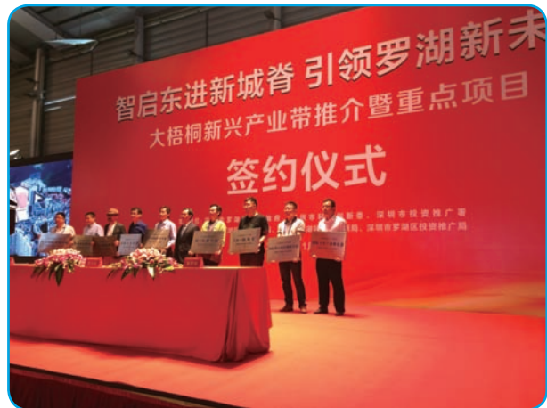
Participated in the promotion conference of the industrial belt in the area under its governance