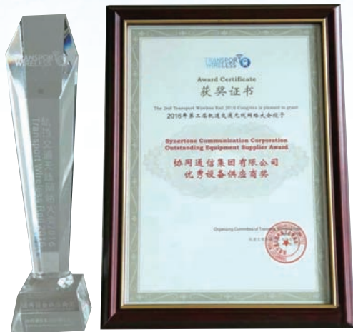
“Outstanding Equipment Supplier Award”