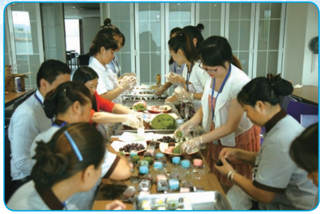
Mooncake DIY event