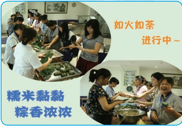
Activities at Dragon Boat Festival