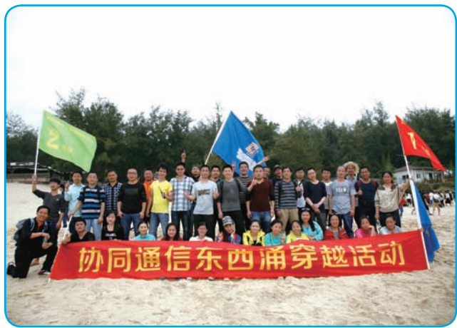
Dongxi Yong (東西涌) Walkthrough activity