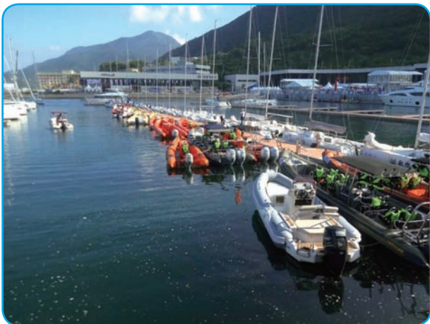
Broadcast for the China Cup International Regatta in Shenzhen