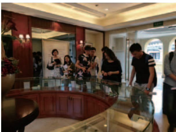
Visiting residential project — Hometown

In the Period, the Company was proactive and conducted reverse roadshow, inviting fund managers, analysts, media and investors to visit our headquarters as well as communities under our management. Its an opportunity to showcase our various services and operation openly to investors, and follow up with management discussion. In 2H 2016, the Company organized 4 reverse roadshows, yet due to strong demand, this number increased to 10 in 1H 2017 with some 127 individuals participated including repeated visits. The latter is some 6 times more than last year's.