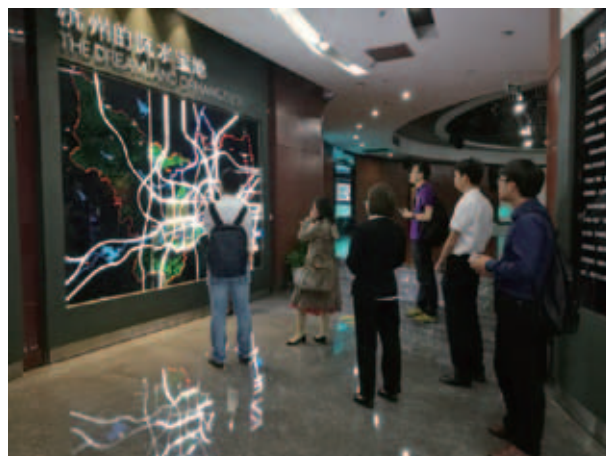
Visiting non-residential project — Zhejiang Overseas High-level Talents Innovation Park

期內，公司主動開展反向路演活動，邀請投資人、基金經理、分析師和媒體，來公司實地調研考察，公開透明地向資本市場展示公司的各項業務，並與管理層進行討論。二零一六下半年，公司組織了4次考察活動，到了二零一七年上半年，因為投資人的需求，我們一共組織了10次活動。來訪投資人數量也大為增加，二零一七上半年有127人次，是二零一六下半年的6倍多。