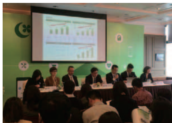
2016 full year results briefing 二零一六全年業績發佈會