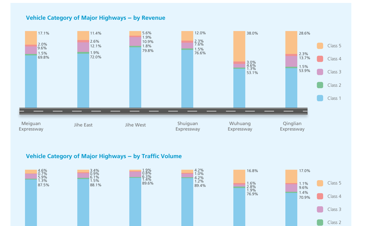
Diagram showing the vehicle category of major highway projects of the Group during the first half of 2017: