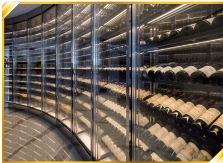
Wine cellar, Le Pan Le Pan餐廳酒窖

我們位於廣州自貿區的酒窖乃留作儲存優質酒品之用，並將繼續加強我們的酒品貿易業務，有助進軍日益增長的香港及中國酒品市場。預期中國政府於粵港澳大灣區推動更緊密經濟合作的政策將會加強區內的業務活動。該發展亦將惠及酒品貿易業務。本集團的酒品業務已準備就緒，把握機會提高其於中國及香港之市場滲透率。