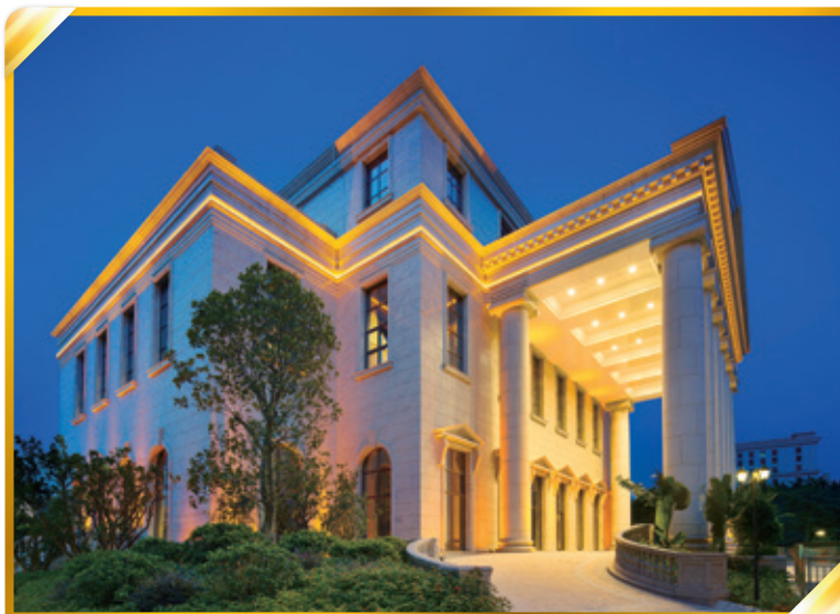
Guangzhou Cellar 廣州酒窖

The Hong Kong Government's policy of exempting wines from duty and the city's Closer Economic Partnership Arrangement with the mainland have led to encouraging performance in the wine re-exports in the recent years. In the first half of 2017, China has already accounted for almost 90% of the total volume of wine re-exports in Hong Kong. Undoubtedly, Hong Kong as the gateway to wine-trading in the free trade zones of China has sustained a boom in wine business. The Guangdong province and Shanghai are the two largest entrepôts of bottled wines in China, accounting for over half of the wine imports into the country. #