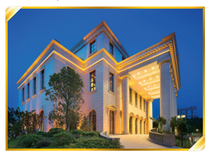
Guangzhou Cellar 廣州酒窖

於二零一七財政年度,我們策略性鞏固了酒品及酒品相關業務,穩步向前。憑藉精簡酒品業務的架構,開拓新的收益來源,讓我們於新財政年度開端之時,邁向康莊大道,並為本集團發展注入動力。