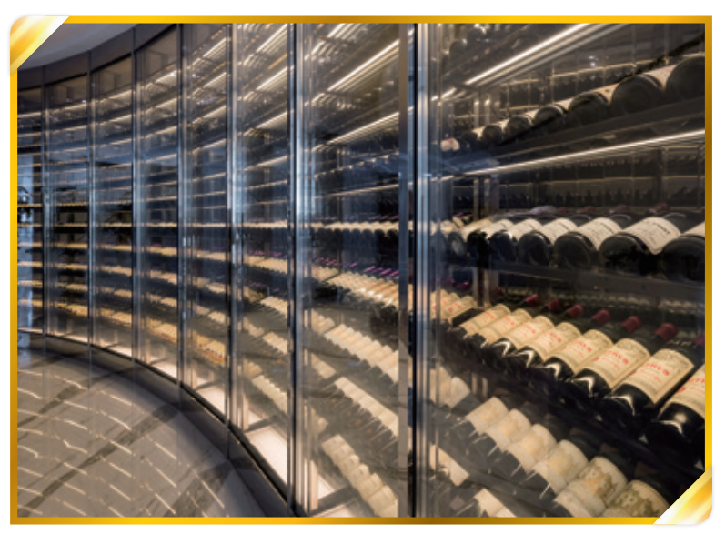
Wine cellar, Le Pan Le Pan餐廳酒窖

我們位於廣州自貿區的酒窖乃留作儲存優質酒品之用,並將繼續加強我們的酒品貿易品務,有助進軍日益增長的香港及中國酒品更出。預期中國政府於粵港澳大灣區推動更密經濟合作的政策將會加強區內的本業務區數。該發展亦將惠及酒品貿易業務。本集於中國及香港之市場滲透率。