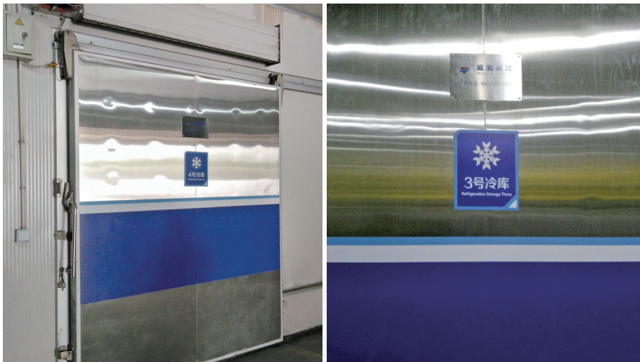
▲ the entrance of the cold storage warehouse at Songjiang Base.

The Group is principally engaged in cold-chain food integrated distribution in the PRC, which, in essence, does not involve any direct production process. As such, the Group does not discharge pollutants into water and land or generate hazardous wastes. Vehicles used in food delivery business are not directly owned by the Group but it would still arrange delivery services according to the schedule and location as set out in the order of the customers to reduce the utilization of the vehicles and their travel distance. As a result, the utilization and carbon emission of the vehicles will be lowered during delivery.