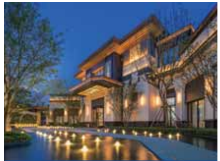
成都華宇旭輝錦繡花城 Chengdu Huayu CIFI Glorious Flower City