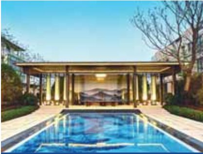
合肥旭輝御璟江山 Hefei CIFI Glory Land