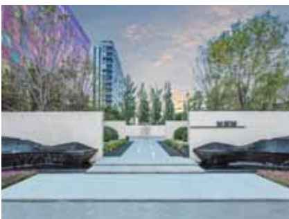
北京旭輝城 Beijing CIFI City