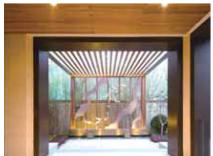
北京旭輝壹合相 Beijing CIFI Yihexiang