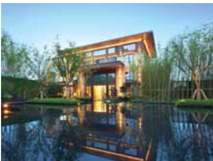
南京旭輝鉅悅泰淮 Nanjing CIFI Park Mansion Qinhuai