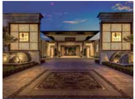
瀋陽旭輝雍禾府 Shenyang CIFI Luxury Mansion