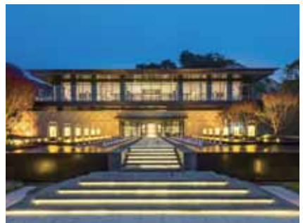
重慶旭輝鎔悅湖庭 Chongqing CIFI Prime Orient