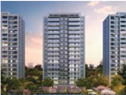
溫州旭輝顧海之光 Wenzhou CIFI Future City