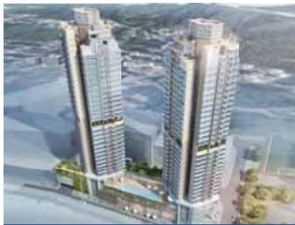
香港油塘四山街項目 Hong Kong Yau Tong Sze Shan Street Project