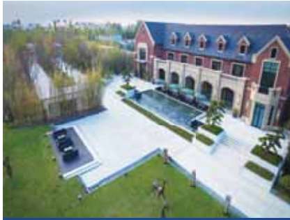
合肥旭輝陶沖湖別院 Hefei CIFI Lake Betsuin