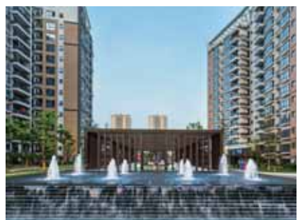
蘇州恒基旭輝水漾花城 Suzhou Henderson CIFI Riverside Park