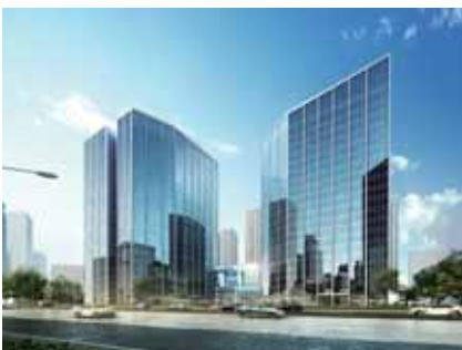
西安旭輝中心 Xi'an CIFI Center