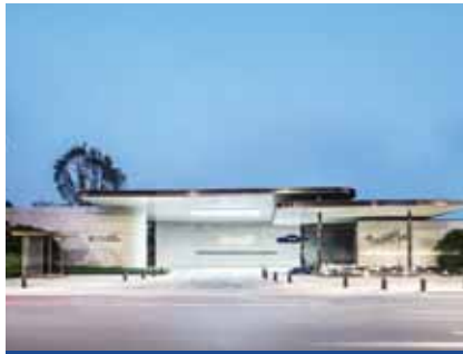
佛山旭輝公元 Foshan CIFI New Century