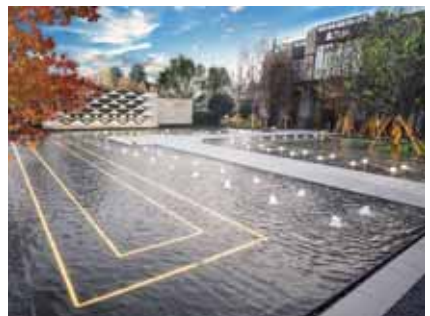
青島旭輝星悅城 Qingdao CIFI Xingyue City