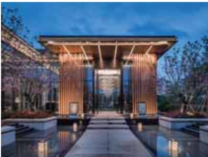
武漢紅龍旭輝半島 Wuhan Yulong CIFI Peninsula