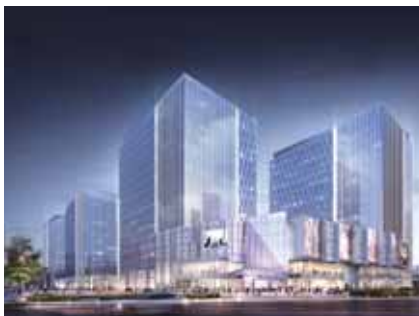
上海陸家嘴洋涇項目 Shanghai Lujiazui Yangjing Project