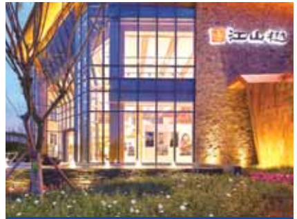
重慶東原旭輝江山樾 Chongqing Dongyuan CIFI Jiangshan Yue