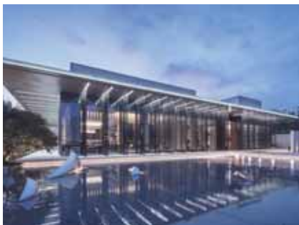
蘇州綠地旭輝吳門府 Suzhou Greenland CIFI Wujiang Mansion