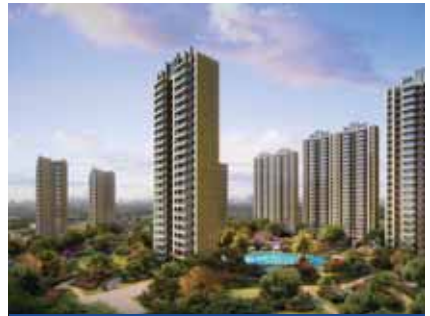
溫州碧桂園旭輝湖悅天境 Wenzhou Country Garden CIFI Lake Mansion