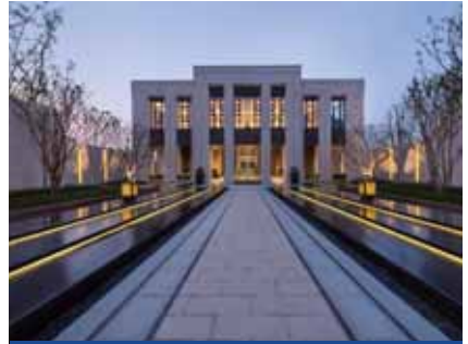
合肥旭輝公元天下 Hefei CIFI Lake Mansion