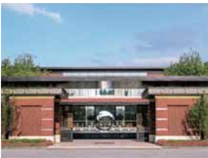
瀋陽旭輝東樾城 Shenyang CIFI Dong Yue City