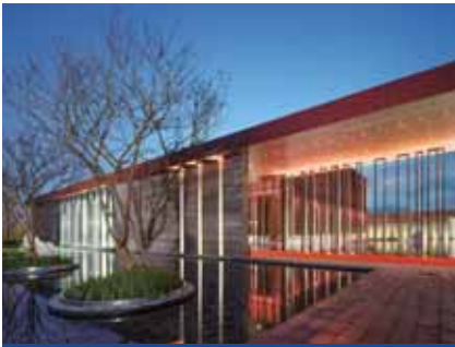
重慶旭輝御璟湖山 Chongqing CIFI Glory Land