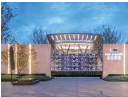
蘇州旭輝鎊悅犀湖 Suzhou CIFI Lake Mansion