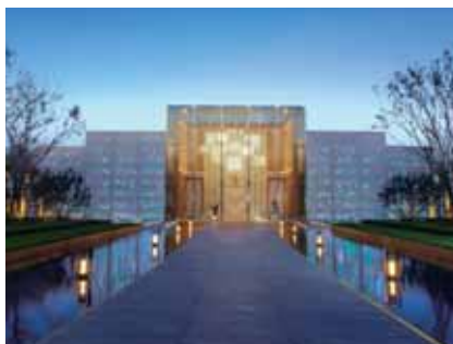
鄭州旭輝正榮首府 Zhengzhou CIFI Grand Mansion