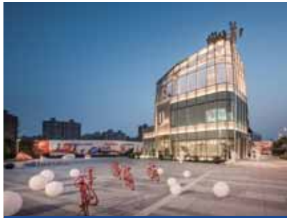
上海寶山區羅店鎮項目 Shanghai Baoshan District Luodian Town Project