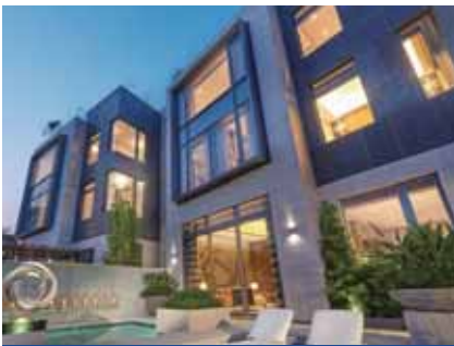
香港春坎角項目 Hong Kong Chung Hom Kok Project