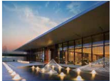
無錫旭輝時代城 Wuxi CIFI Times City