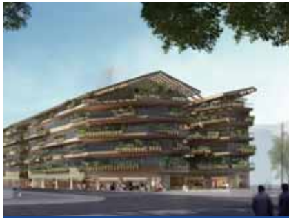
上海黃浦區馬當路項目 Shanghai Huangpu District Madang Road Project