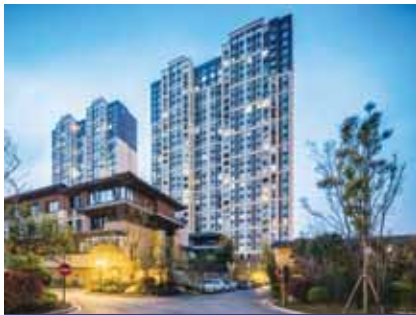
武漢旭輝御府 Wuhan CIFI Private Mansion