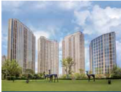
杭州綠地旭輝城 Hangzhou Greenland CIFI Glorious City