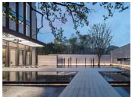
寧波旭輝鉅宸府 Ningbo CIFI Central Mansion