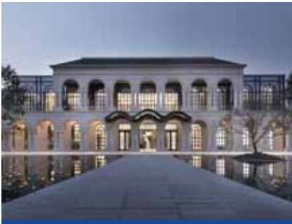
長沙旭輝湖山賦 Changsha CIFI Hushan Mansion