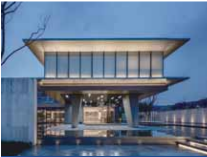
杭州旭輝濱江東方悅府 Hangzhou CIFI Binjiang East Mansion