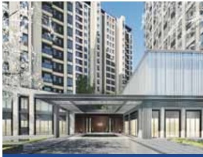
長沙旭輝南宸府 Changsha CIFI Nanchen Mansion