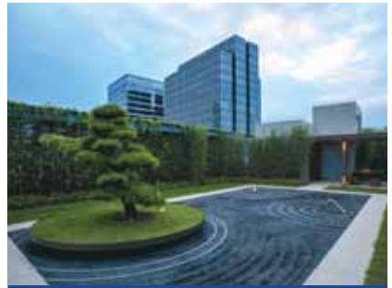
上海閔行區莘莊項目 Shanghai Minhang District Xinzhuang Project