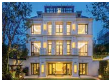
上海旭輝鎊悅西郊 Shanghai CIFI Park Mansion West