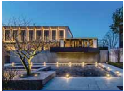
杭州旭輝東原東越府 Hangzhou CIFI Dongyuan Majestic Mansion