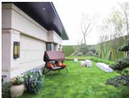
杭州旭輝瑋悅府 Hangzhou CIFI Jun Yue Palace