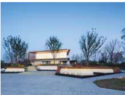
寧波上湖城 Ningbo Prosperous Reflection