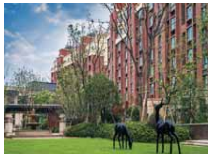
蘇州旭輝香格里 Suzhou CIFI Shangli