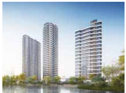
杭州蕭山區北幹單元項目 Hangzhou Xiaoshan District Project