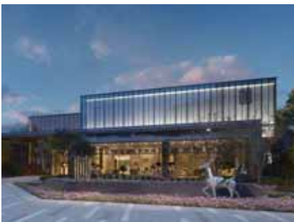
杭州旭輝和昌都會山 Hangzhou CIFI Hechang Metropolis Mansion