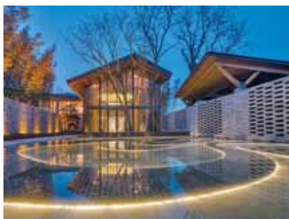
蘇州北辰旭輝壹號院 Suzhou North Star CIFI No.1 Courtyard