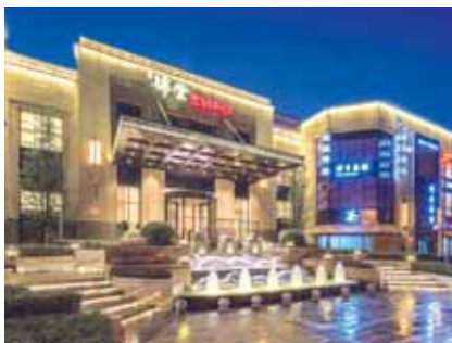
瀋陽旭輝錦堂 Shenyang CIFI Jin Court