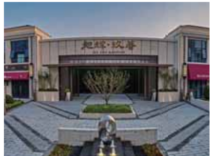
合肥旭輝玖著 Hefei CIFI Jiuzhu Mansion