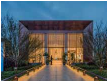
合肥旭輝江山印 Hefei CIFI Jade Seal