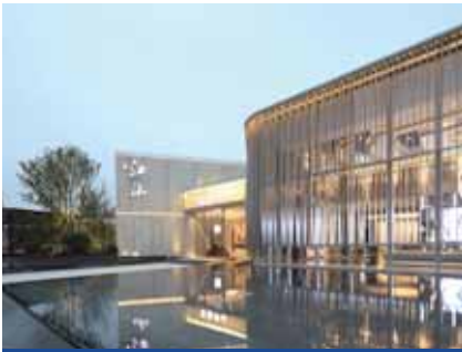
佛山旭輝江山 Foshan CIFI Homeland