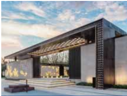
宜興恒基旭輝府 Yixing Henderson CIFI Mansion