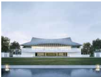
蘇州吳中區西山項目 Suzhou Wuzhong District West Mountain Project