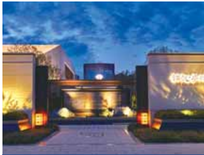
合肥北辰旭輝錦悅廬州府 Hefei North Star CIFI Park Mansion Luzhou