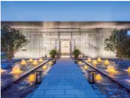
天津旭輝天悅風華 Tianjin CIFI Tianyuefenghua