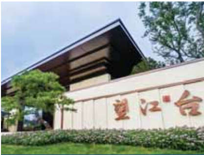
合肥旭輝望江台 Hefei CIFI Wonderful Mansion