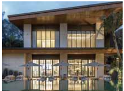
三亞旭輝鉅悅亞龍灣 Sanya Park Mansion Yalong