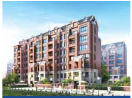
長沙旭輝國際廣場 Changsha CIFI International Plaza