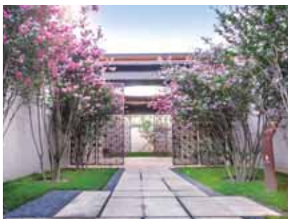
北京天恒旭輝7號院 Beijing Tiancheng CIFI No.7 Courtyard