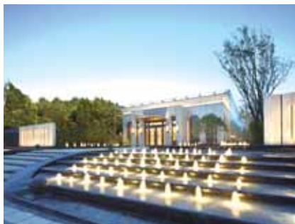
南京北辰旭輝鉅悅金陵 Nanjing North Star CIFI Park Mansion Jinling