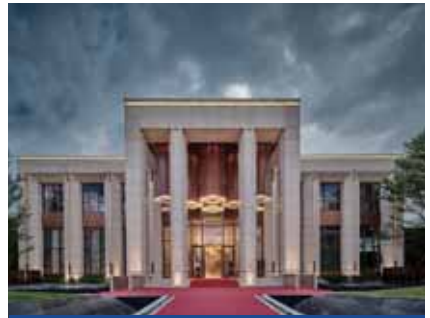
佛山旭輝城 Foshan CIFI City