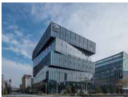
上海恒基旭輝中心 Shanghai Henderson CIFI Center