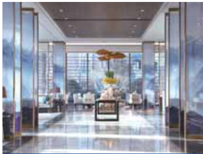
天津旭輝6號院 Tianjin CIFI No.6 Courtyard