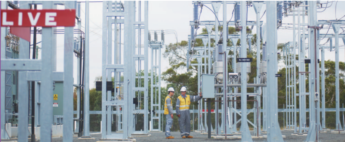
Australian Energy Operations operates the Elaine terminal station to connect the Ararat wind farm to the state grid.

Australia is a key market for the Group. Since entering the market in 2000, we have steadily increased our presence across generation, transmission and distribution and our five operating companies serve approximately 4.6 million households and businesses. The acquisition of DUET during the year under review has also positioned us to participate in the growing energy-from-waste and biogas sectors in Australia.