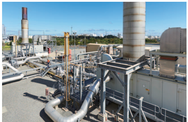
The DUET acquisition offers synergies with and access to new energy sectors in Australia.

DBP owns and operates gas transmission pipelines in Western Australia, delivering 339 million GJ of gas during the year. System availability was high at 100%. The company spent A$71.8 million in capital works to enhance network safety and reliability.