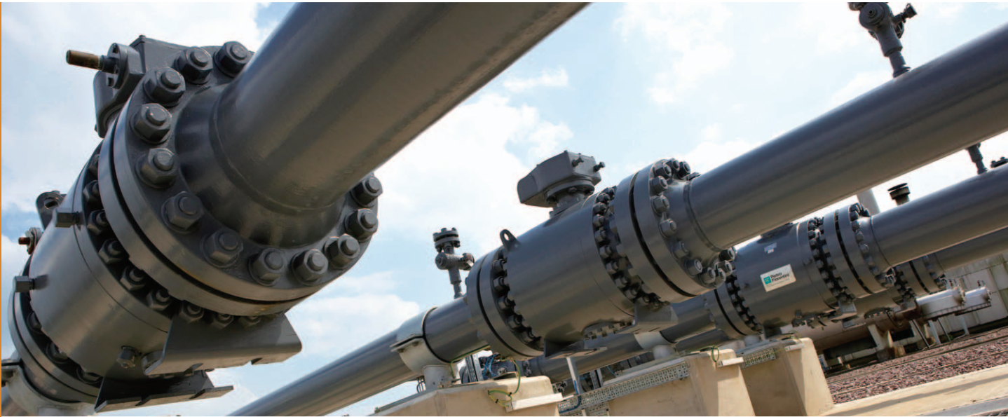
WWU's pipelines enable it to keep more than 2.5 million customers safe and warm.

The UK is the Group's largest market. With a presence in the geography since 2005, today we have four companies spanning the electricity generation, electricity and gas distribution sectors. They have a combined domestic, commercial and industrial customer base of over 13 million, generation capacity of 1,150 MW, and a combined electricity network length of 188,000 km and gas pipeline length of 71,100 km in the country.