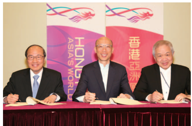
HK Electric signs the new Scheme of Control Agreement with the Government, effective for 15 years.

The construction of two new gas-fired generating units, L10 and L11, at Lamma Power Station progressed on schedule, and the units are on track for commissioning in 2020 and 2022 respectively. Together, the two units will increase the proportion of the company's gas-fired generation to 55% from the present 34%. While one coal-fired unit L1 has retired, another unit L2 has undergone a major upgrade to extend its operating life by five years to 2022.