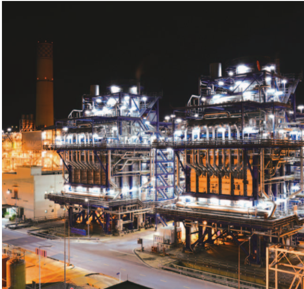
Ratchaburi power plant achieves all its operational parameters.