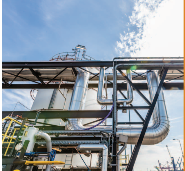
AVR's Rotterdam plant expands its supply of steam to industrial customers.

This year, AVR and its long-term partner, the Dutch Packaging Waste Fund, embarked on a plan to build municipal waste separation facilities at its plant in Rozenburg. This major initiative will enable AVR to separate and recycle plastics from residual municipal waste. It creates a new