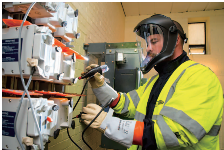
UKPN offers extensive technical training to all engineers to ensure the highest standards are maintained.

UK Power Networks (UKPN) owns, operates and manages three of the 14 regulated electricity distribution networks in the UK. It is one of the largest electricity distribution network owners in the UK covering an area of approximately 30,000 km 2 . UKPN also operates a number of private networks on behalf of clients including the British Airports Authority and the Ministry of Defence. The Group owns 40% of the company since 2010.