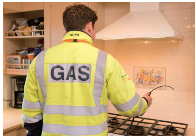
A WWU engineer at a customer's premises. WWU is lauded for its commitment to supporting vulnerable groups in the community.

In 2017, WWU distributed 62,009 GWh of gas to 2.53 million supply points, a decrease in throughput of 4% over 2016. The company achieved or exceeded all its regulatory target outputs and met all its guaranteed standards of performance during the year, improving safety and operating performance. WWU upheld the Group's standards of excellence in customer satisfaction, scoring 9.17 in the most recent Ofgem survey.