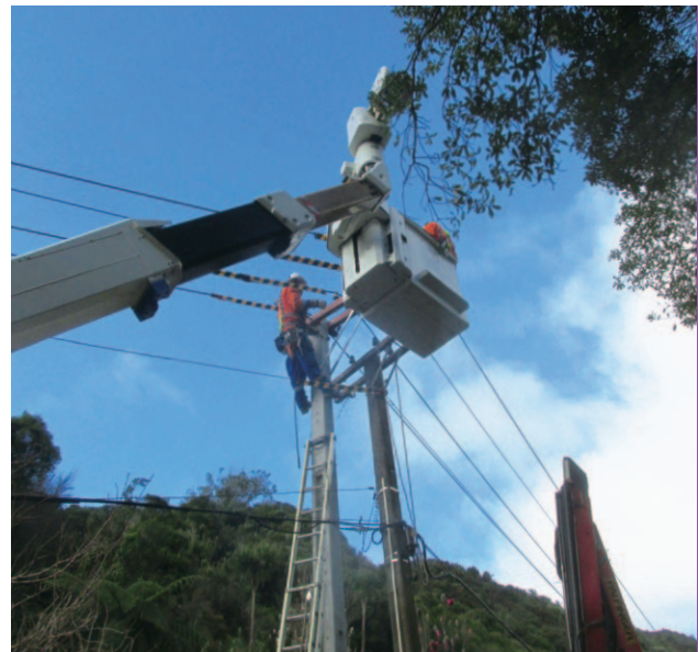
Proactive network maintenance lies at the heart of WELL's reliability record.

EV adoption in New Zealand is accelerating with the Government seeking to have 64,000 electric vehicles on the roads by the end of 2021. To support this mandate, WELL is working with the Wellington City Council and transport providers to support charging to help the introduction of 10 electric buses to the Wellington area. The company has also undertaken a study to understand the impact EVs would have on the network and the role tariffs could play in influencing EV charging behaviour to manage reduction of peak network loads. This will lead to less demand congestion and more efficient network utilisation and performance.