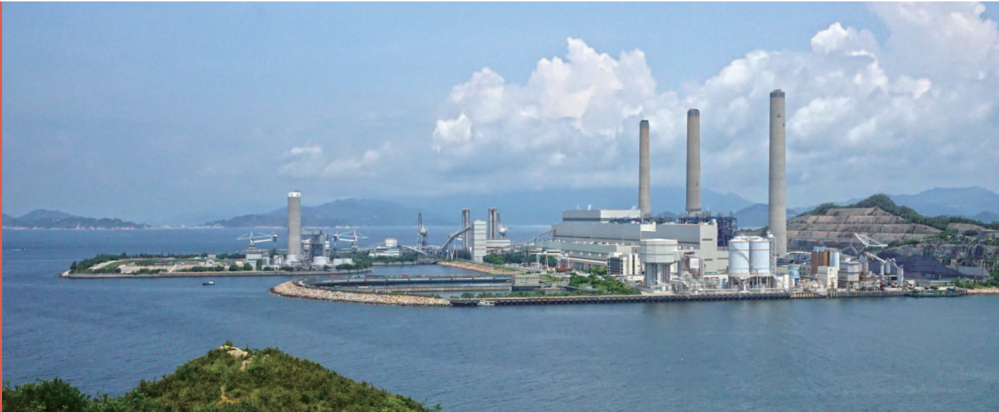
HK Electric's Lamma Power Station is in the process of renewing its infrastructure to increase gas-fired generation.