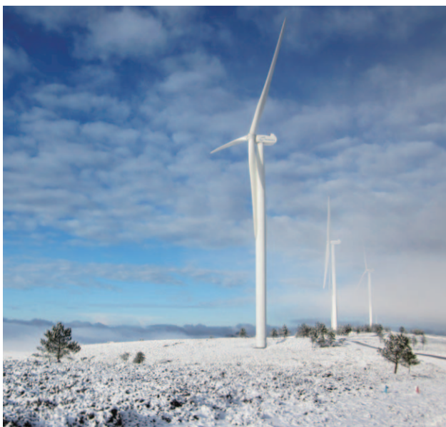
Iberwind's ongoing wind farm repowering programme improves output and efficiency.

In October 2017, AVR launched a sustainable paving stone in partnership with the recycling and concrete industries. The stone is made partly from residues of the incineration process of AVR, which are treated, cleaned and used to create a clean granulate that can be used in the concrete industry. The granulate is both strong and stable and an effective replacement for sand and gravel in the production of recyclable concrete.