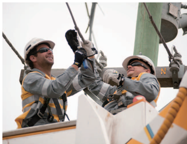
VPN's rigorous maintenance programme keeps power lines safe and functioning optimally.

Beon Energy Solutions, a VPN undertaking, connected Victoria's largest, hyperscale data centre, Air Trunk. The 66/22KV substation with diverse high voltage power feed was delivered ahead of schedule. The data centre, located south west of Melbourne, has a total capacity of over 50MW.