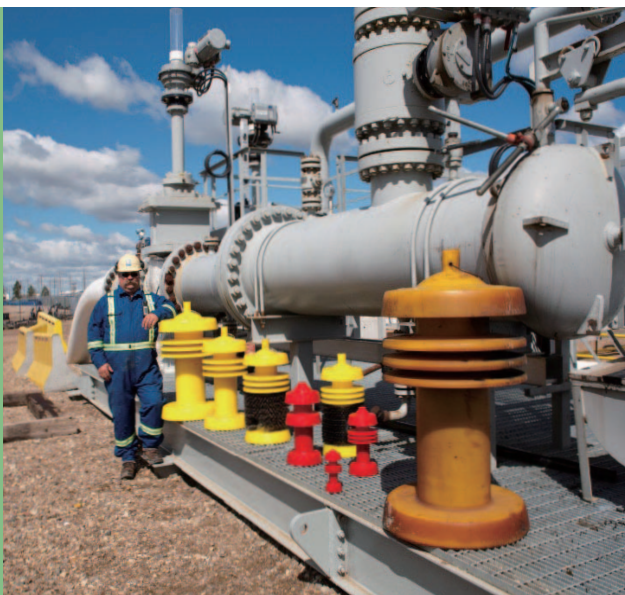
HMLP is in the process of expanding its pipeline systems to serve more customers.

The Power Assets Group has had a presence in Canada since 2007, which was further expanded in 2016. Our two operating companies, Canadian Power Holdings and Husky Midstream Limited Partnership, operate in the power generation as well as oil transmission and storage space and are spread across Saskatchewan, Ontario and Alberta.