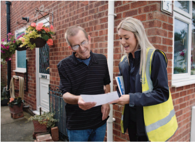
An NGN Customer Care Officer brings a customer up to speed with planned replacement work in his neighbourhood to ensure good community relations.

NGN's efficiency and customer satisfaction levels were very strong. The company received an average rating of 9.2 out of 10 in the Ofgem benchmark customer satisfaction surveys. It also retained its rank as a top two UK gas distribution network and was named by the regulator as the most efficient of the UK's eight gas distribution networks.