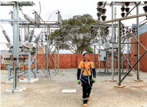
United Energy deploys advanced network infrastructure.

EDL focusses on the generation of clean energy and remote energy in Australia, North America and Europe. During the year, EDL expanded into the highly specialised landfill-gas-to-energy generation sector in North America with the acquisition of Lidya Energy LP and Lidya Energy Inc in Canada, and Granger Energy Services in the USA. The acquisitions take EDL's North American clean generation capacity to 204 MW, making it one of the top three landfill-gas-to-energy businesses in the region. It also expanded its production of wind energy in Australia with the acquisition of the 12 MW Wonthaggi wind farm. EDL's generation output grew by 7% during the year due to expanded operations through these acquisitions and the expansion of existing sites.