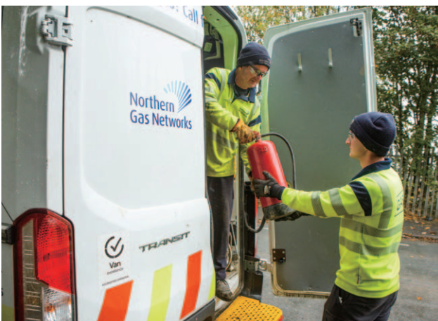
NGN engineers carry out works on a gas main in Bradford to maintain network reliability.

Network improvement and replacement to improve system efficiency, safety and reliability is an ongoing priority for NGN. Over 580 km of old iron mains were decommissioned during the year as part of this effort, while progress was made on an ongoing network extension programme to alleviate fuel poverty. About £3.9 million was invested in these projects as well as in upgrades to IT infrastructure of £21.3 million.