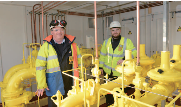
WWU's extensive and complex networks are at the core of its operations.

WWU's process transformation programme is a significant company-wide initiative that will upgrade customer services and future proof work processes for the longer term. Work continued in 2017 on upgrading IT systems, including capabilities like real time management information reporting.