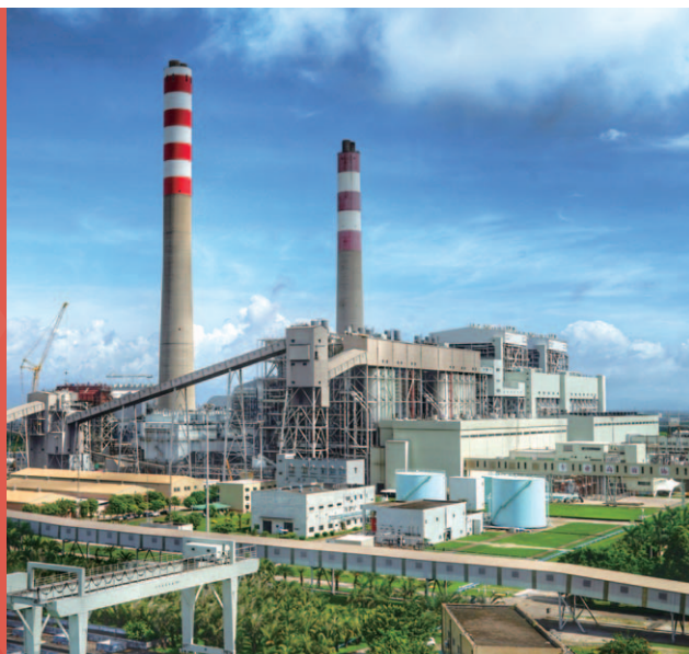
Jinwan Power Plant has increased steam output and plans to step up production even further.

The Power Assets Group has had a presence in mainland China since 2007. Today, the Group's presence consists of five power companies: two wind farms in Dali (Yunnan province) and Laoting (Hebei province), two coal-fired plants in Zhuhai and Jinwan (Guangdong province), and a cogeneration plant in Siping (Jilin province). The five units have a combined capacity of 2,898 MW.