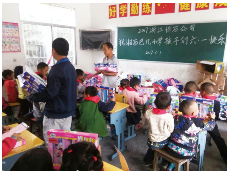
Donation of Love Activity