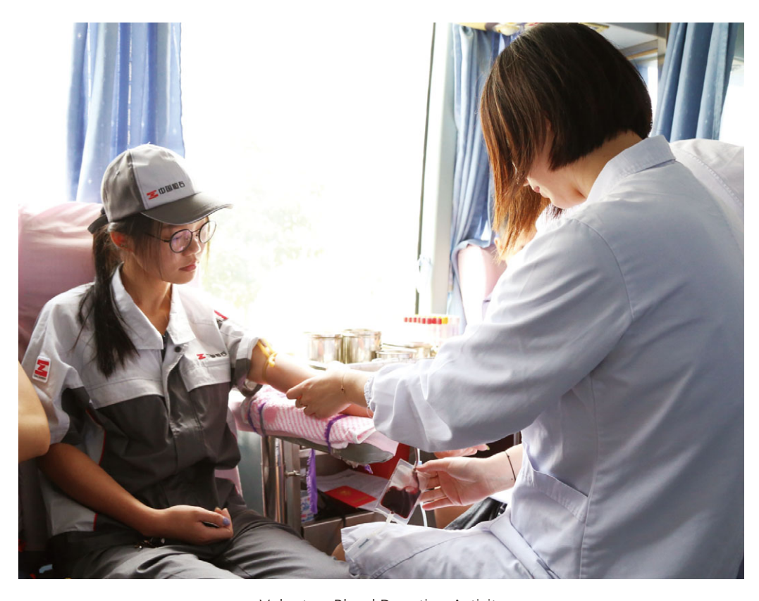
Voluntary Blood Donation Activity

With the concept of "taking from the society and serving the public", the Group is willing to work with all stakeholders to create an environment for "harmonious development of employees, corporation and society". During the Reporting Period, the employees of the Group actively participated in various social and public welfare activities within their capacity, such as volunteer service at the World Internet Conference and voluntary blood donation, etc., so as to contribute their own love to society.