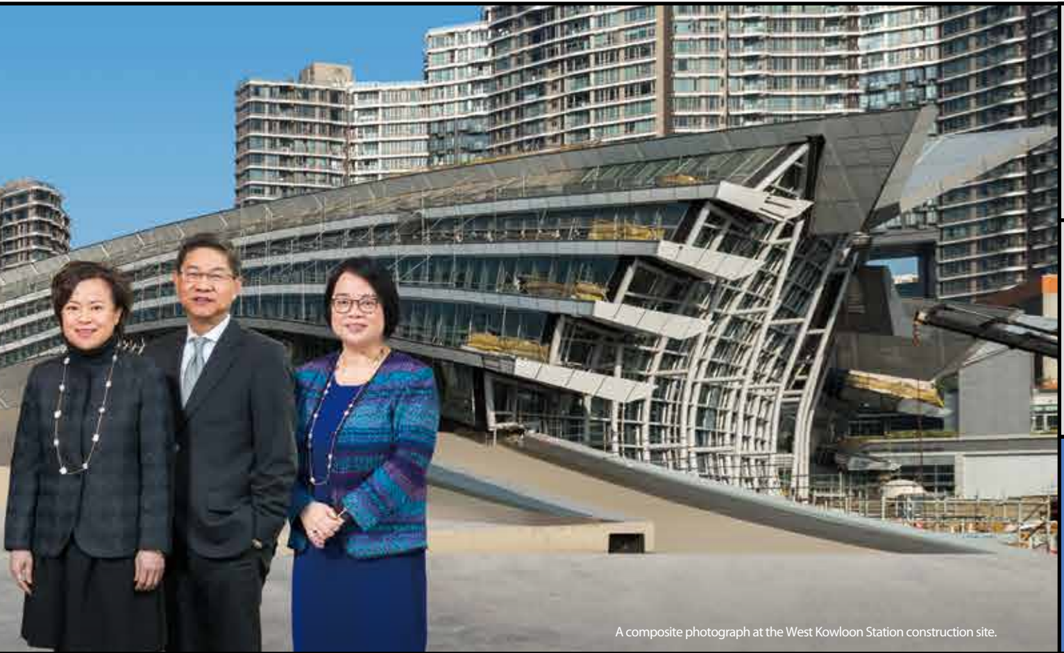
A composite photograph at the West Kowloon Station construction site.

He holds a Bachelor of Science degree in Civil Engineering from the University of Southampton, and a doctoral degree in Mechanical Engineering from the University of London (University College London), both in the United Kingdom.