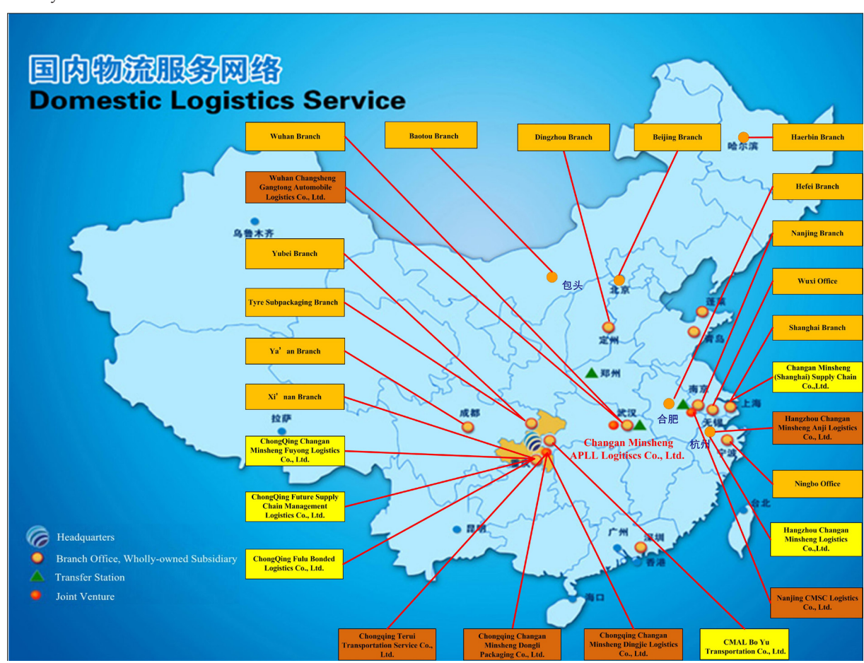
Picture 2: Location of the Company's existing branches, subsidiaries and representative offices

As at 31 December 2017, the Company had a total of 26 branches, subsidiaries, associated companies and representative offices, which are mainly located in East China, Central China, North China, South China and Southwest China (Picture 2). The continuous enhancement of service network enables the Group to provide logistics services to different parts of the country.